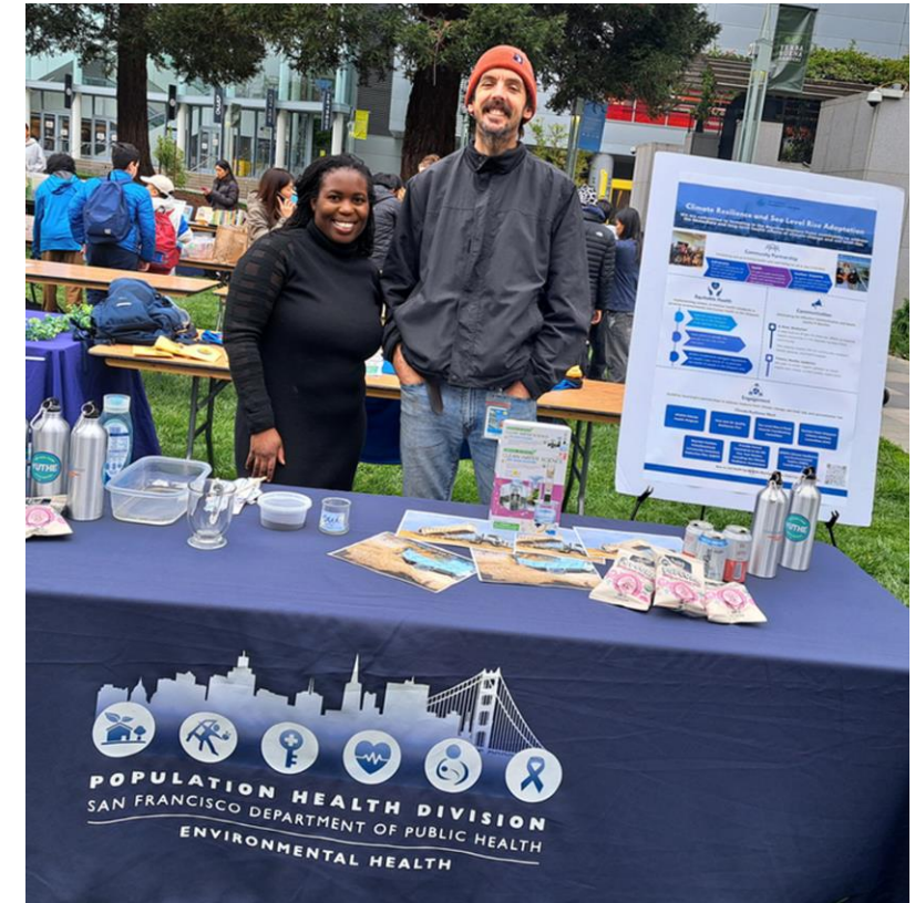
DPH staff at Youth Climate Action Summit in April 2025.