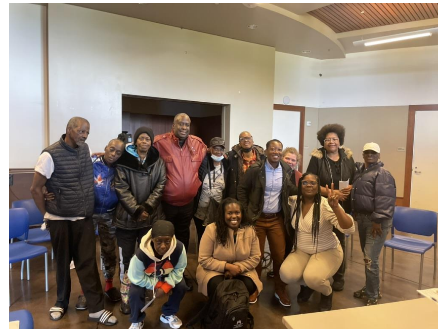
DPH staff with Hunter View residents for Community Listening Session in April 2024.