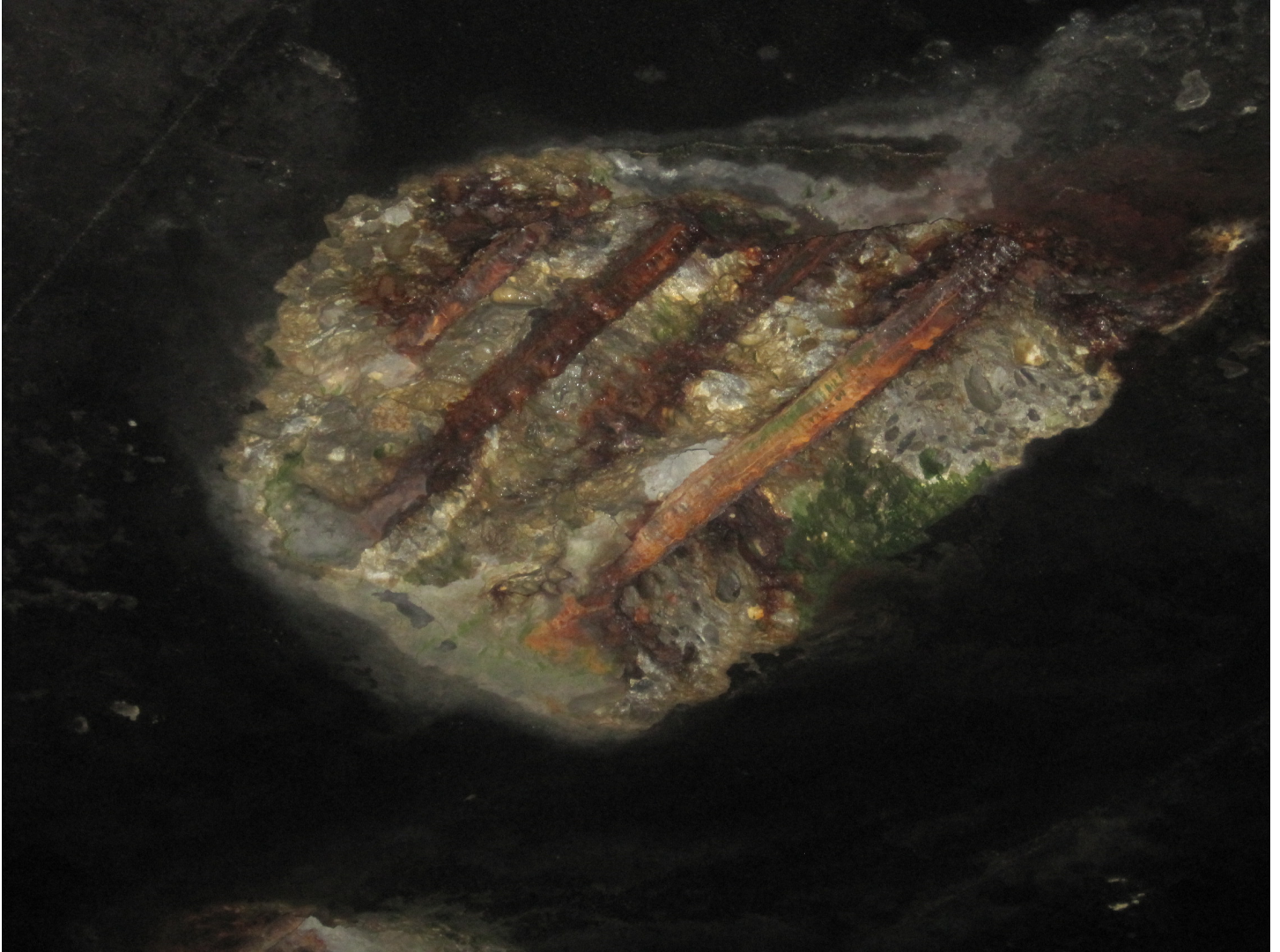
Photo 2. Spalling concrete and exposed/corroded rebar