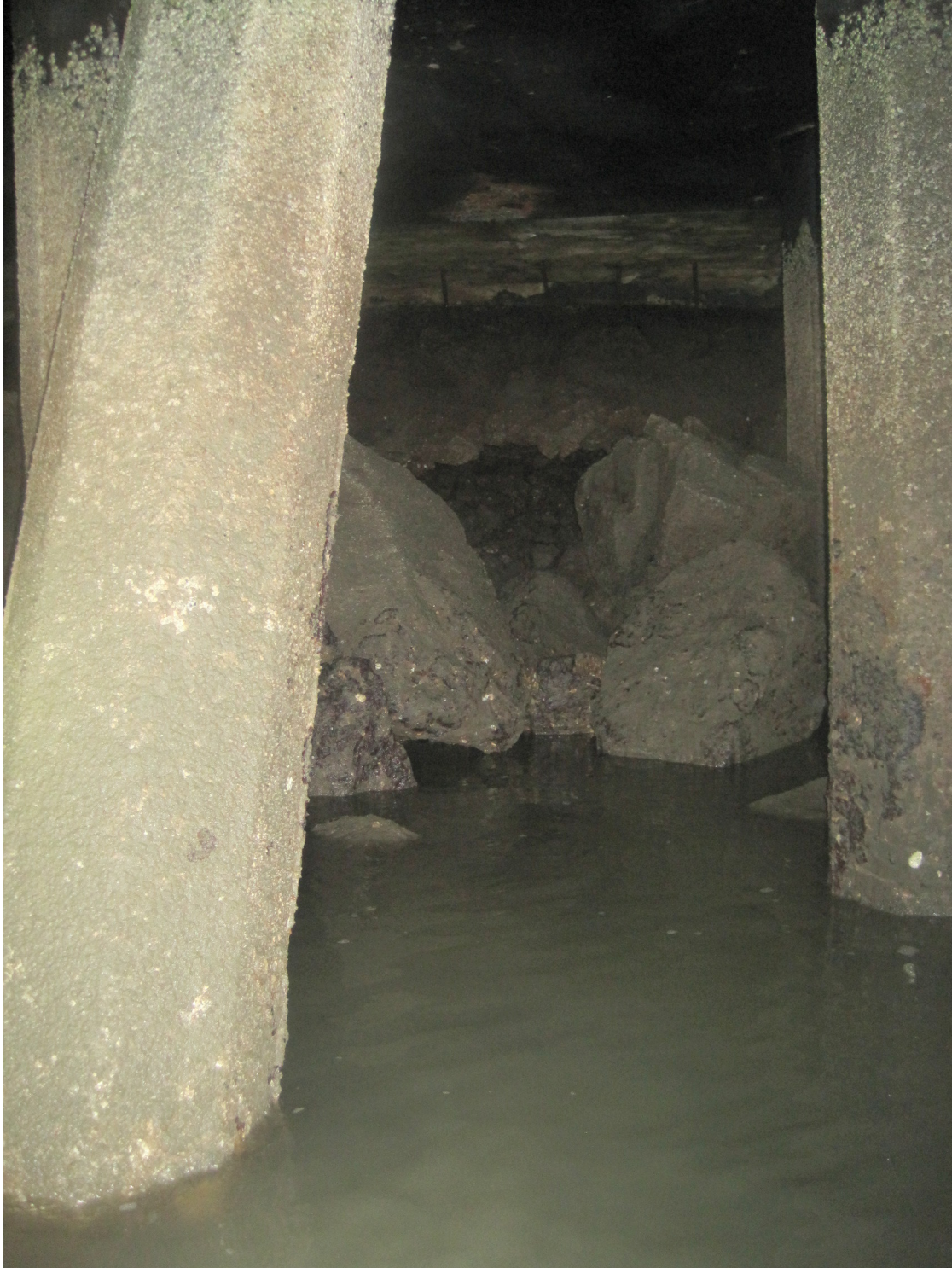
Photo 3. Undermining of seawall