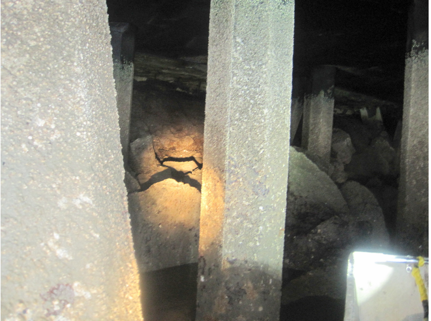
Photo 5. Undermining of seawall