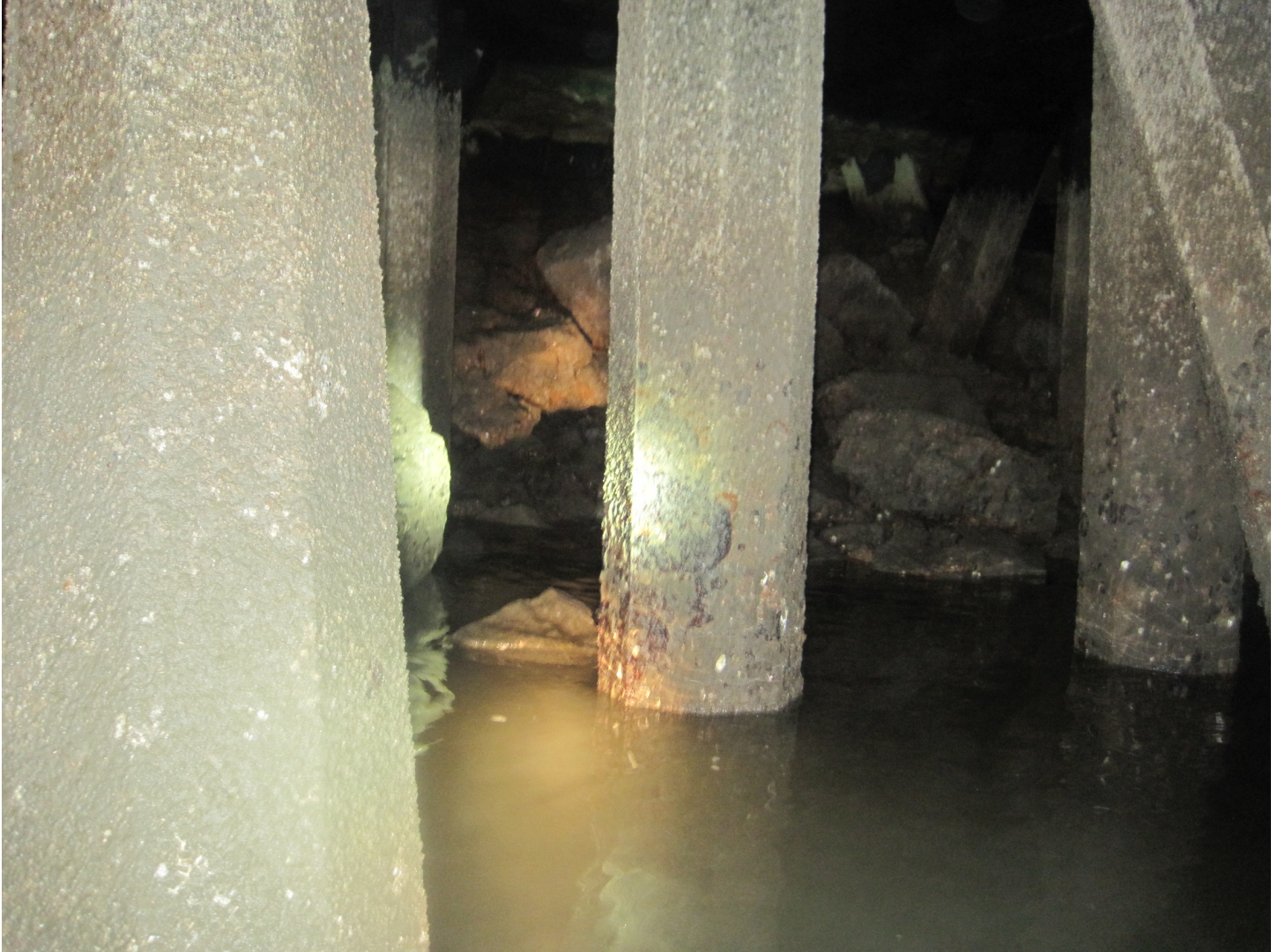
Photo 6. Undermining of seawall