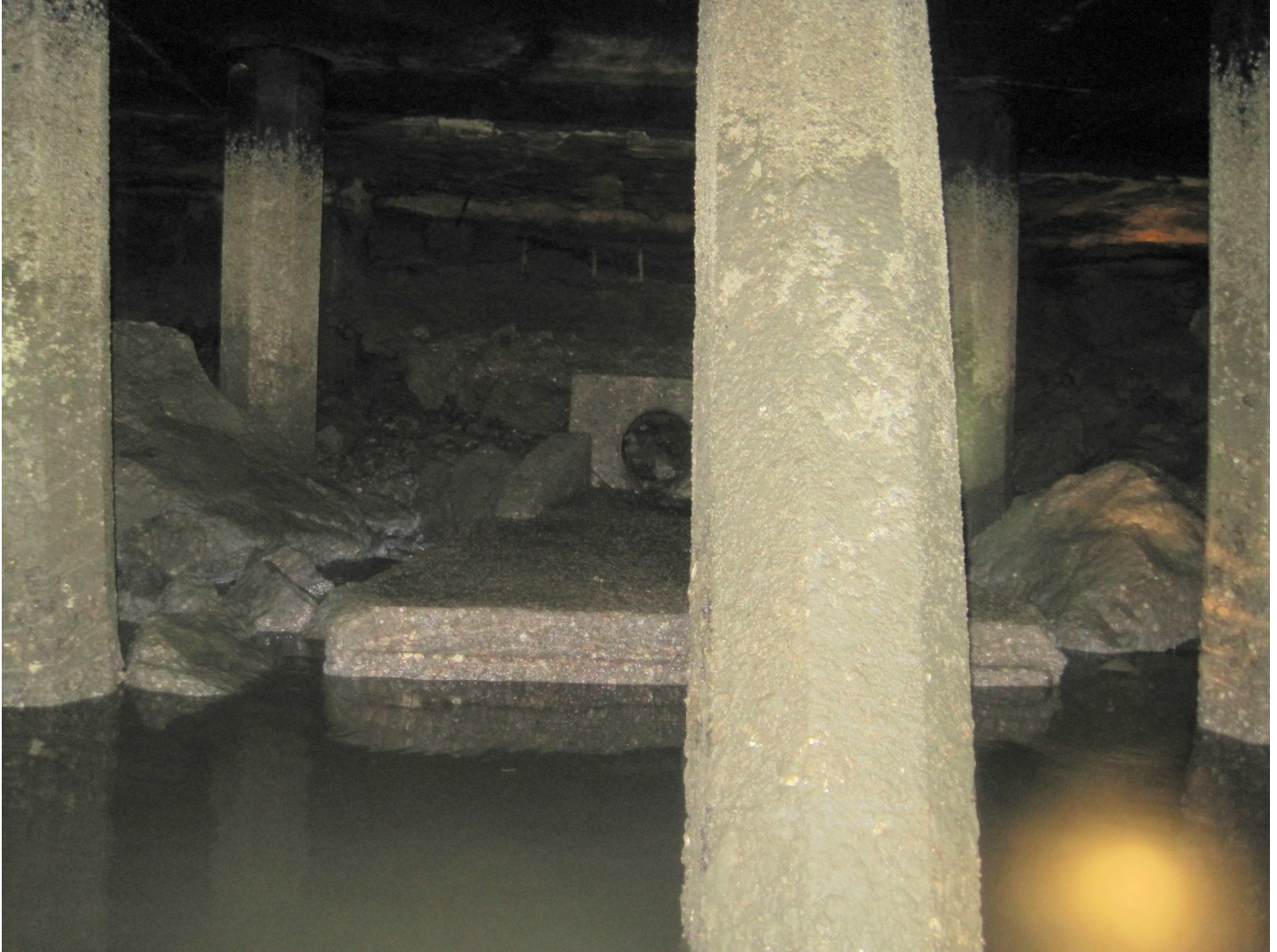
Photo 2. Drain underneath seawall