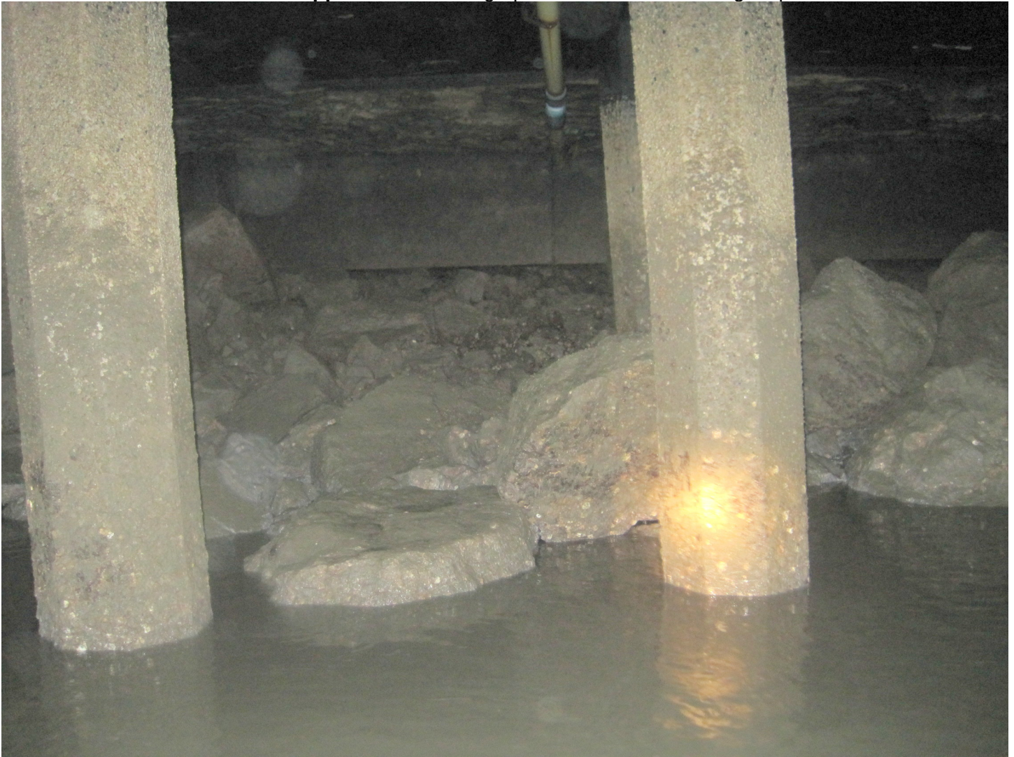
Photo 1. Undermining of rip-rap and slurry may be present