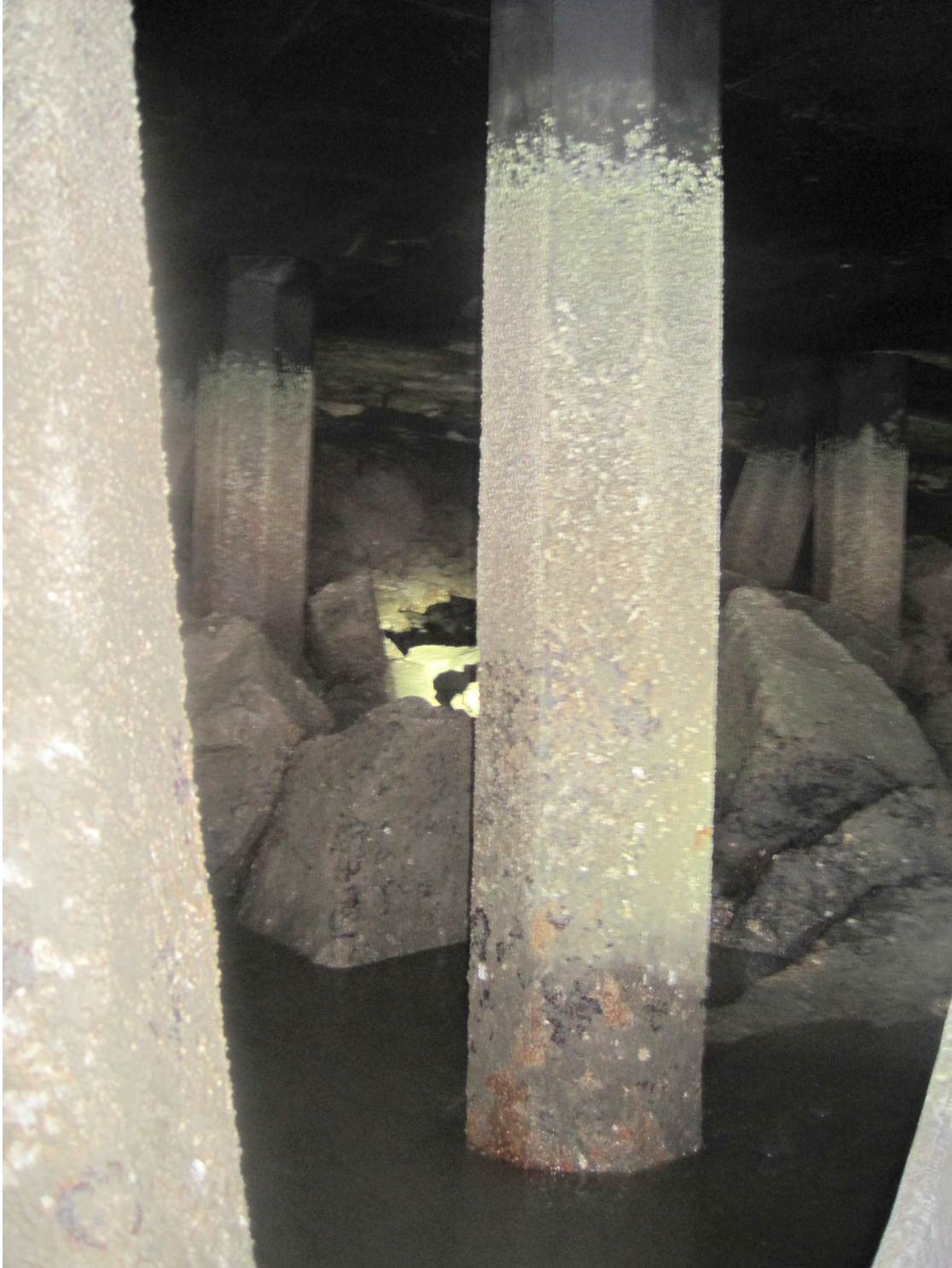
Photo 4. Undermining of seawall