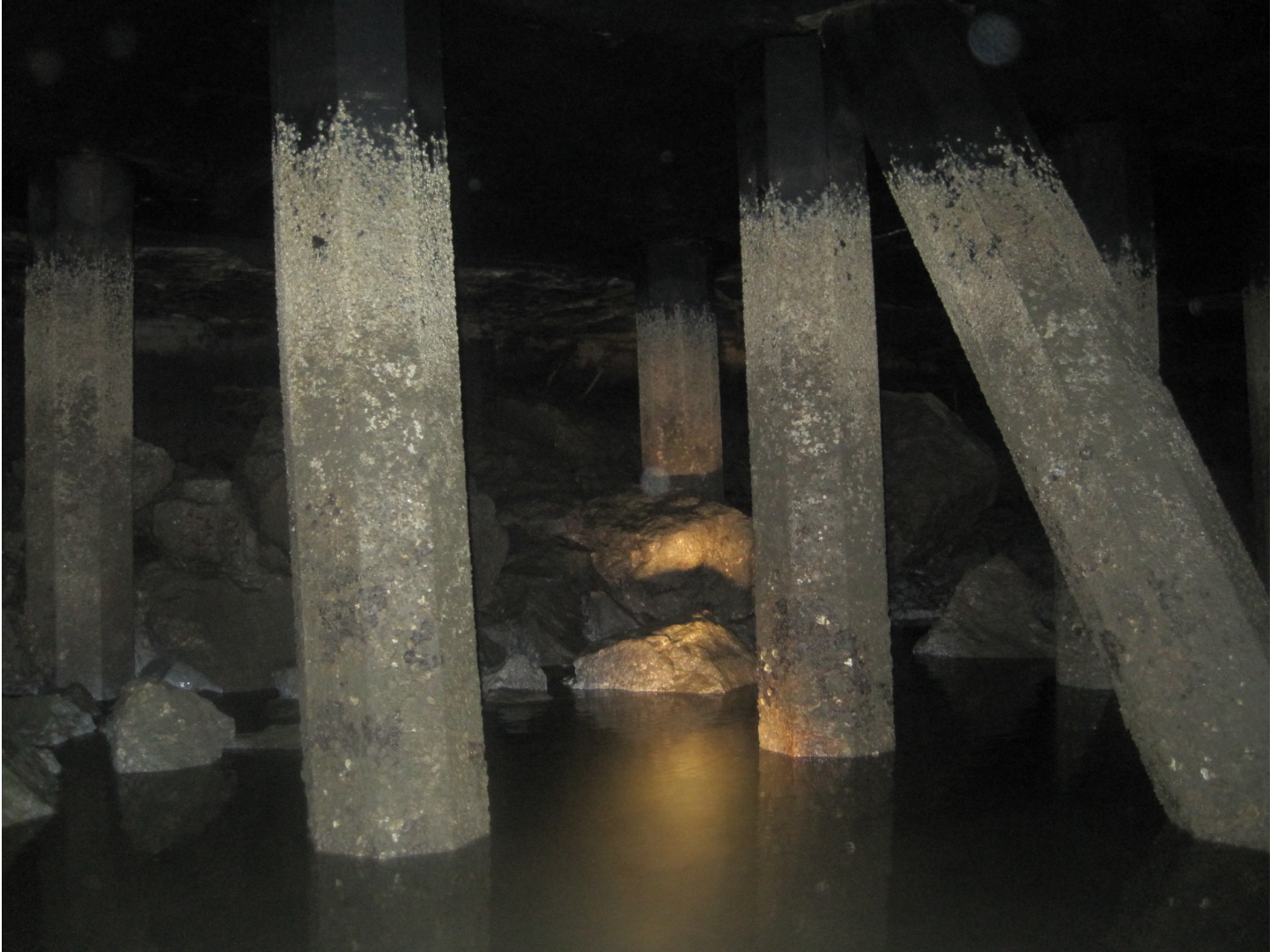
Photo 7. Seawall protected by rip-rap