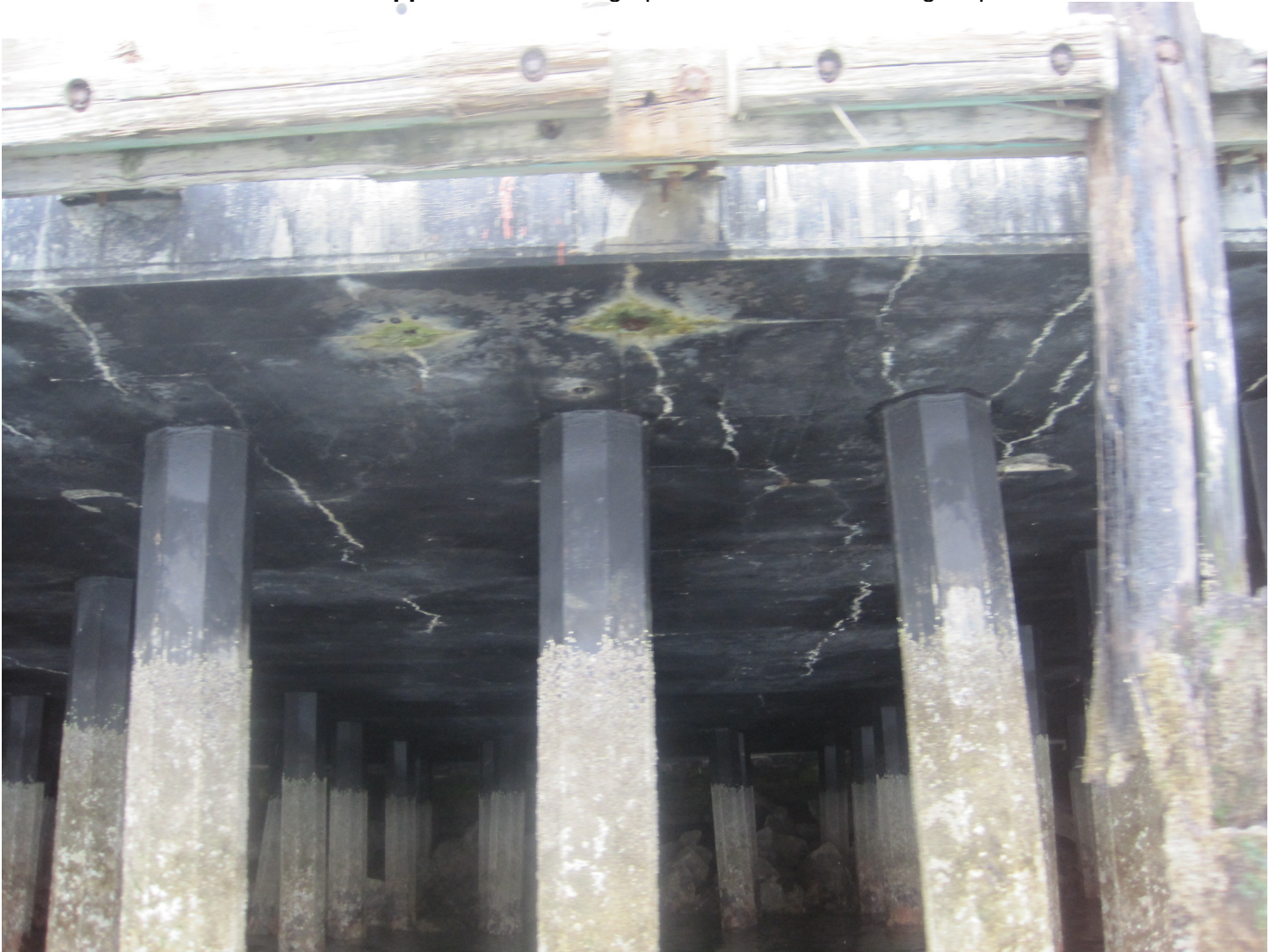
Photo 4. Cracks in concrete deck