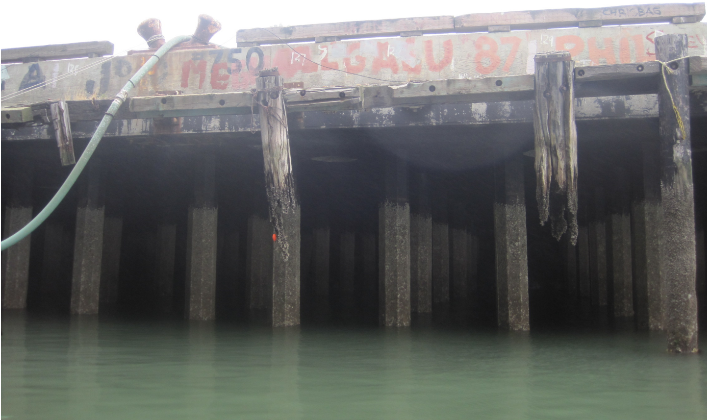
Photo 6. Hanging wood members