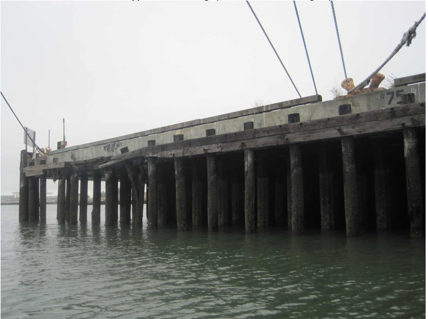
Photo 3. Damaged/deteriorated fendering system