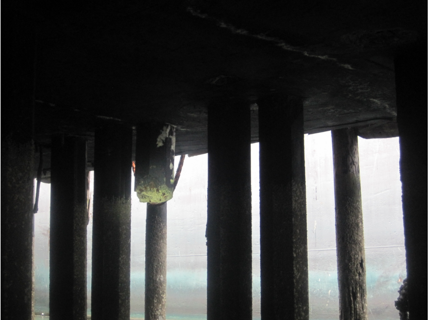
Photo 5. Missing pile