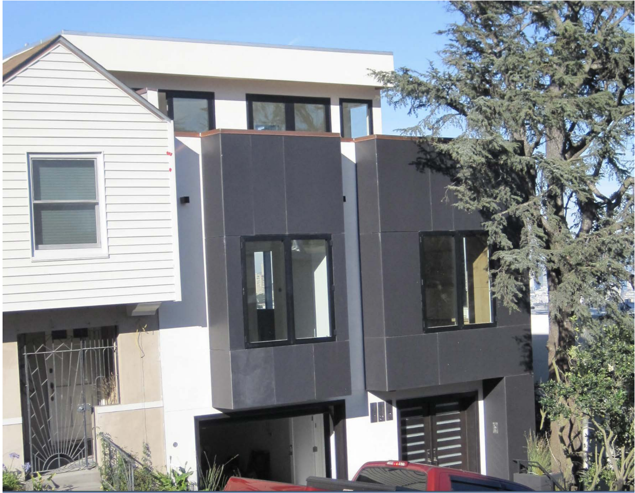
Photo #5 Project Completed in 2015 July 2012 Sales price = $1.26 million July 2015 Sales price = $ 4.85 million October 2021 Sales price = $ 6.1 million

This message is from outside the City email system. Do not open links or attachments from untrusted sources.