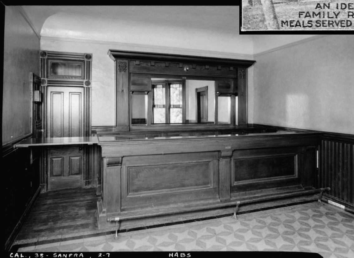
Trocadero Clubhouse, 1936 Bar Room

Source: Historic American Building Survey, CA-119. Photographer, Robert W. Kerrigan. Accessed via https://www.loc.gov/resource/hhh.ca0738.photos?st=gallery