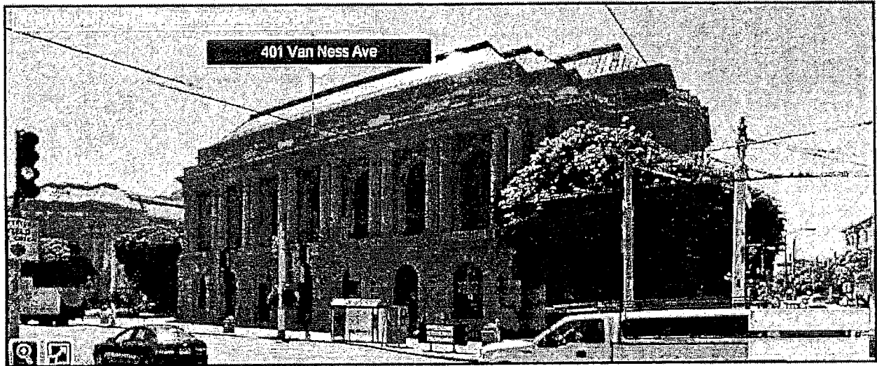
401 Van Ness Avenue (View looking southwest)