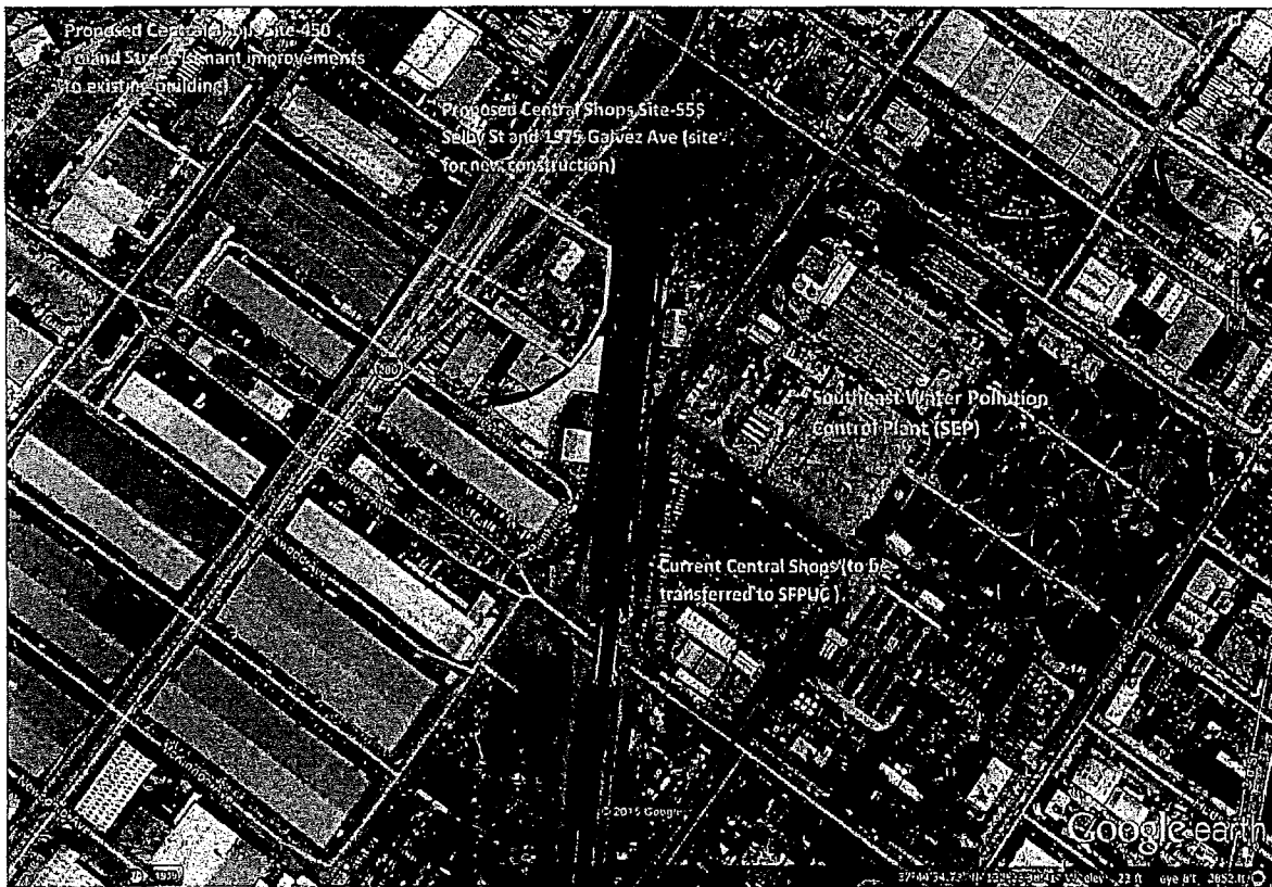
Figure 1: Current and Proposed Locations for Central Shops

Figure 1 below shows the current and proposed locations for Central Shops.