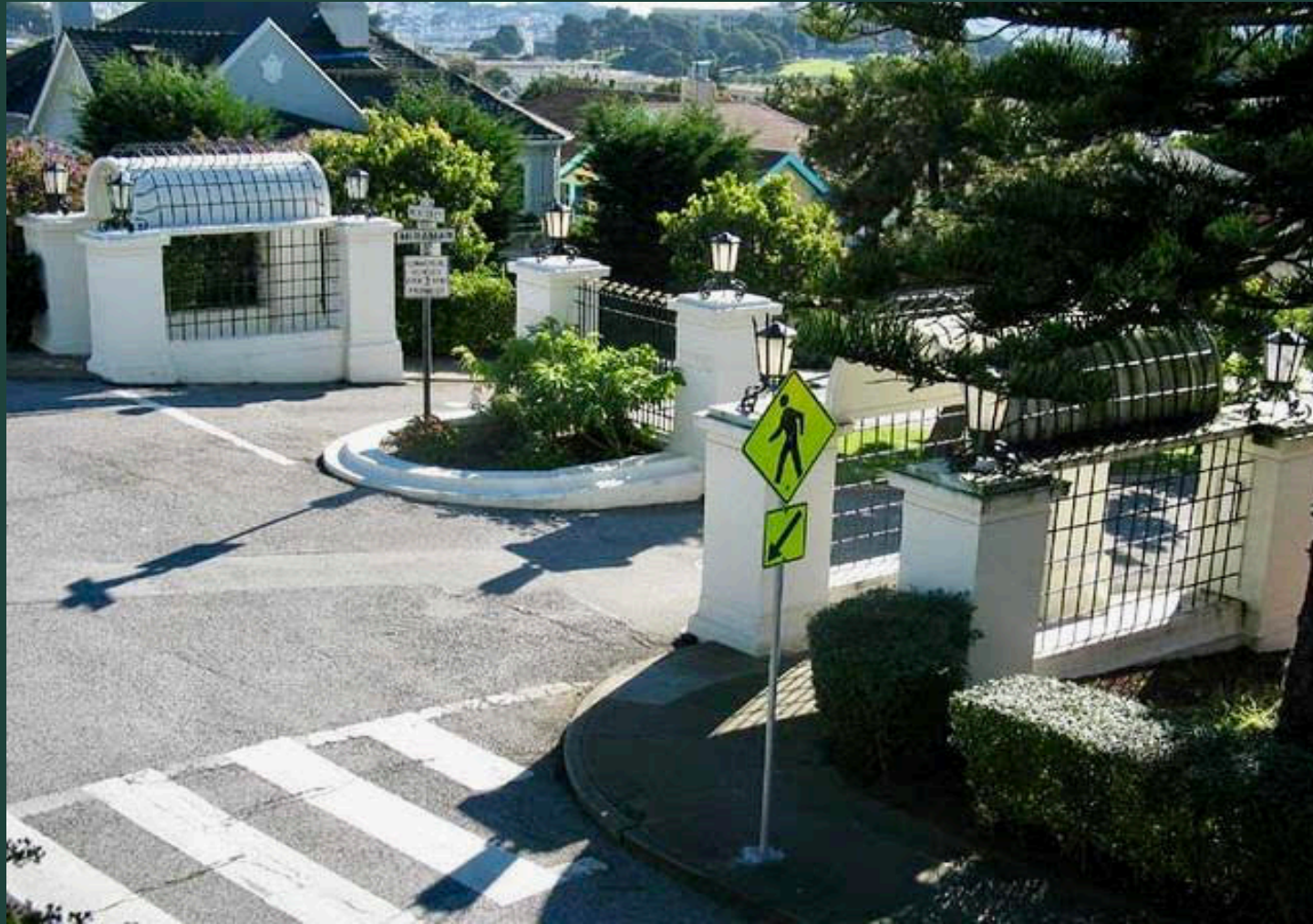
Pedestrian crossing at Westwood Park Entrance Gates, located at Miramar Avenue & Monterey Boulevard