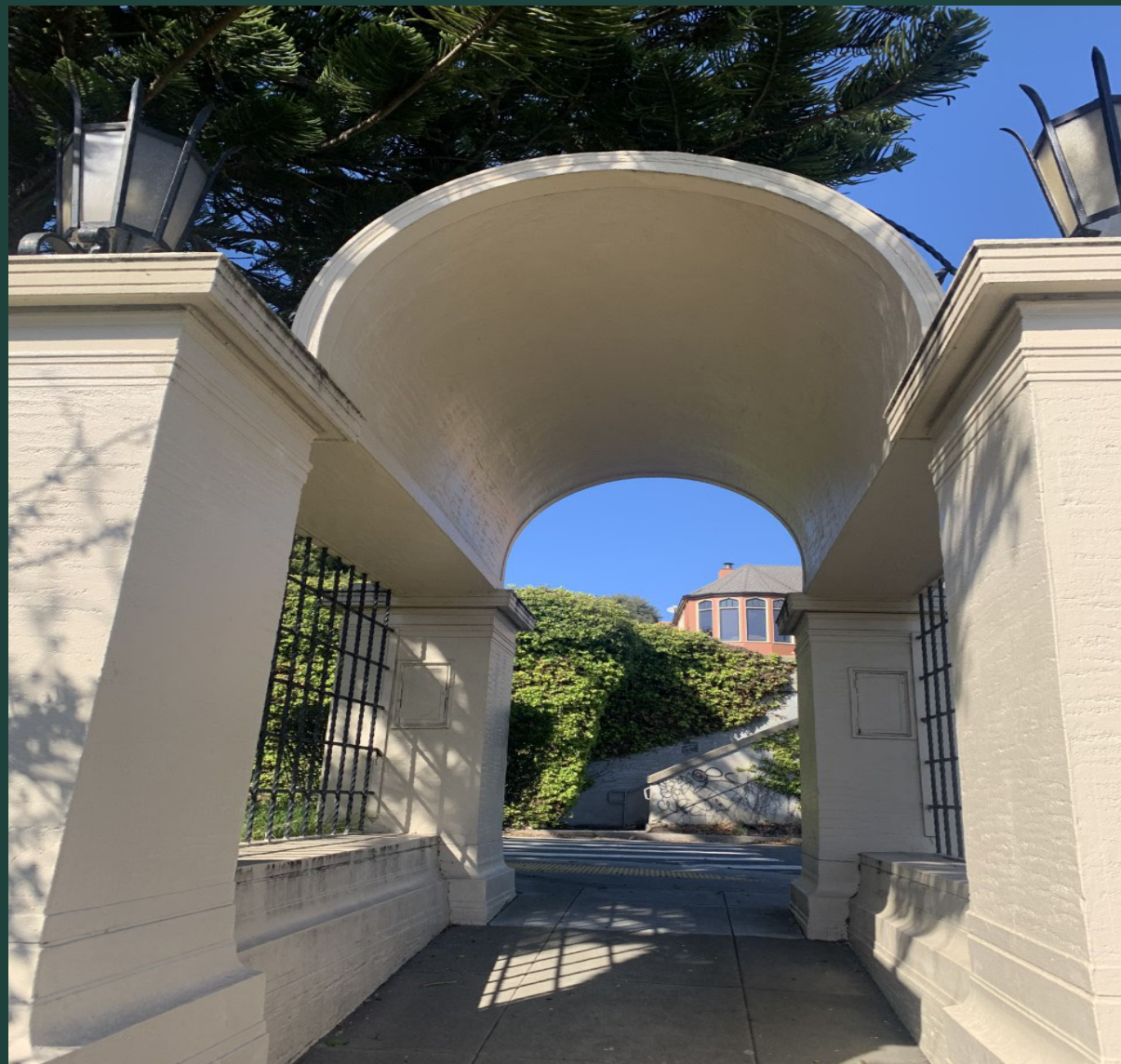
One of the two barrel-vaulted portals (restored in 2003), with a curved wrought iron grill and lamps mounted above.