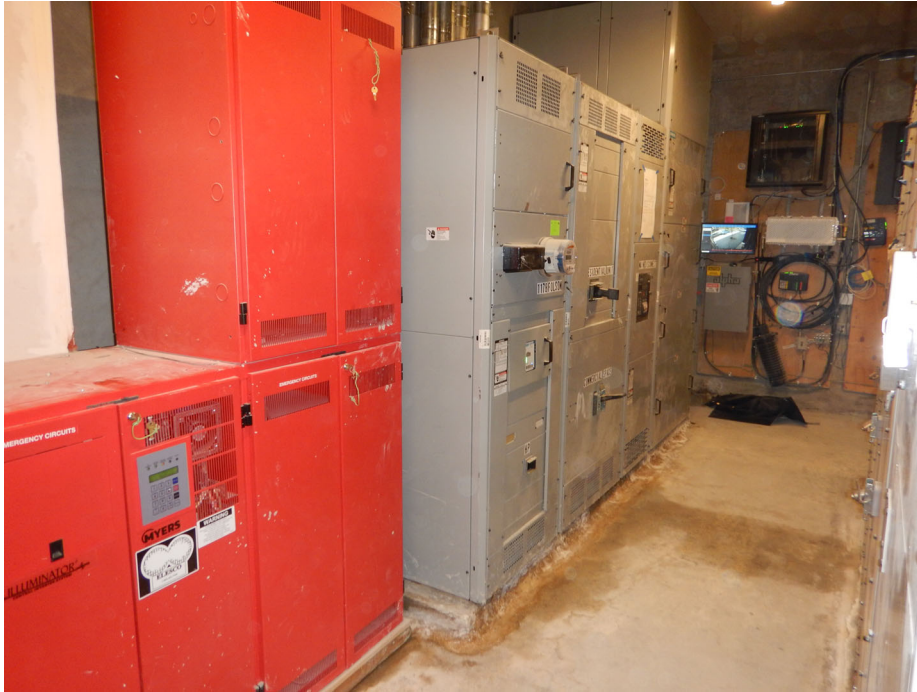
Photo 1: General view of electrical equipment. Note water on floor.