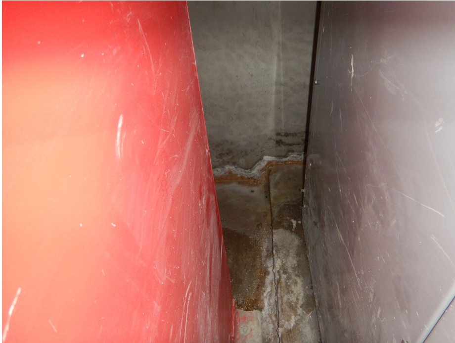
Photo 3: Efflorescence at wall/slab cold joint behind electrical equipment.