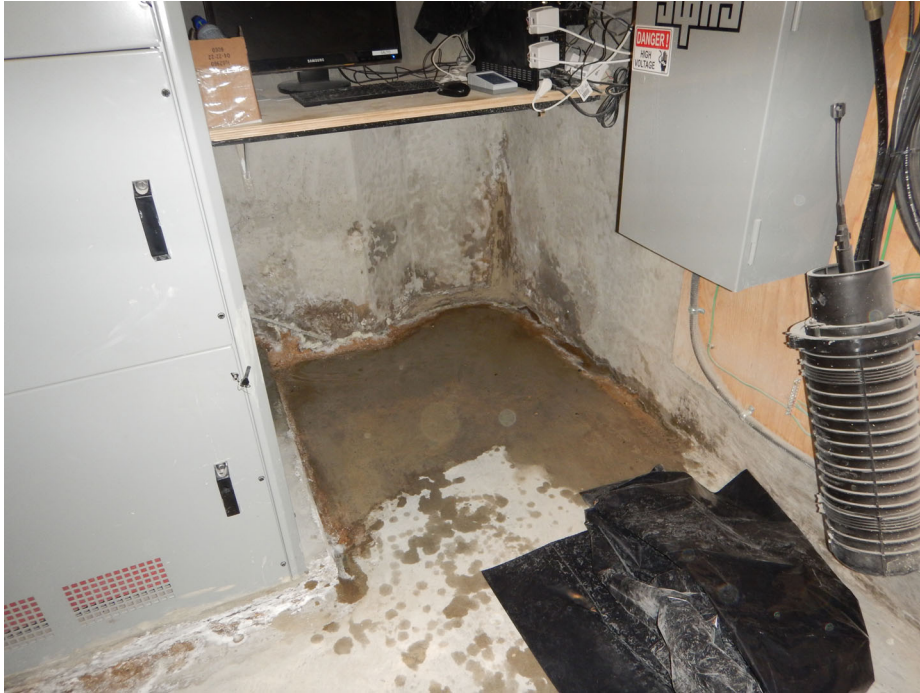
Photo 5: Efflorescence on wall base and water on floor adjacent to equipment (right side).