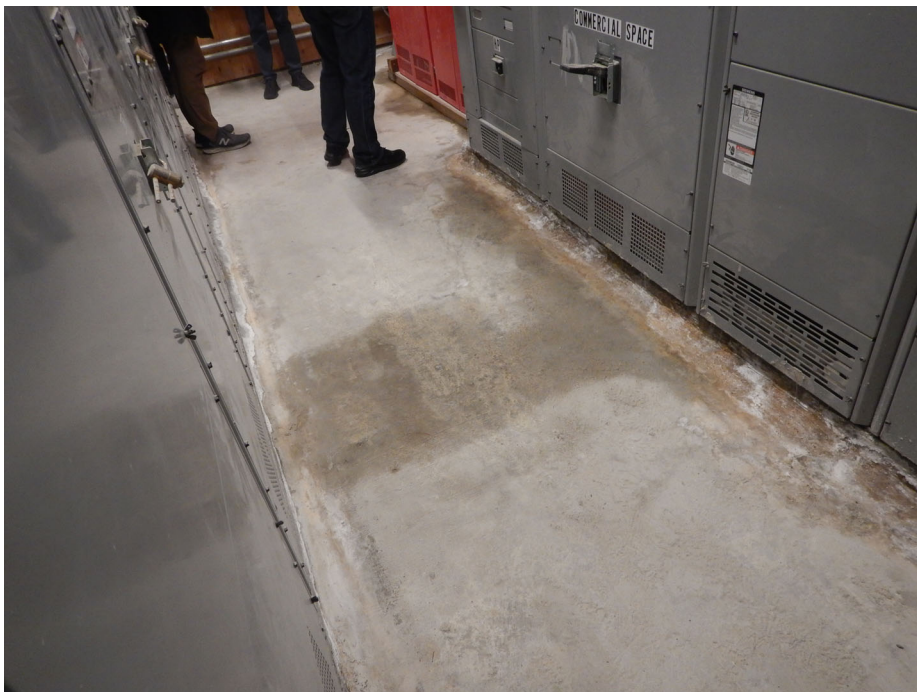
Photo 2: Efflorescence and water on floor in front of electrical equipment.