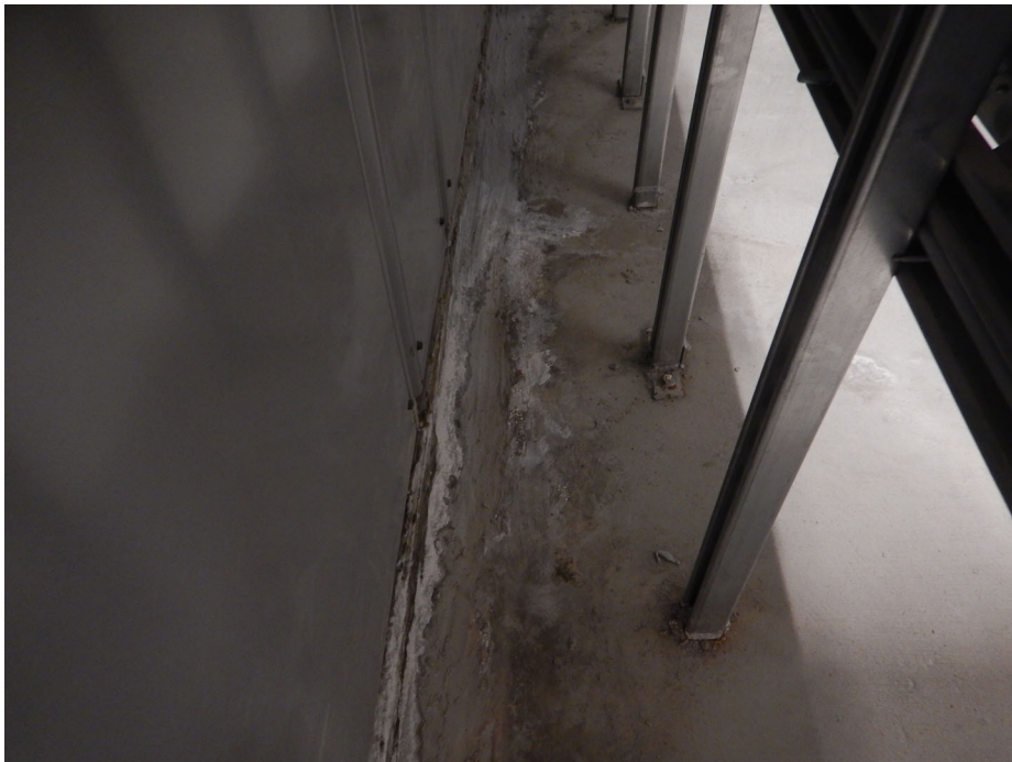
Photo 4: Efflorescence on side of concrete platform in middle of electrical room.