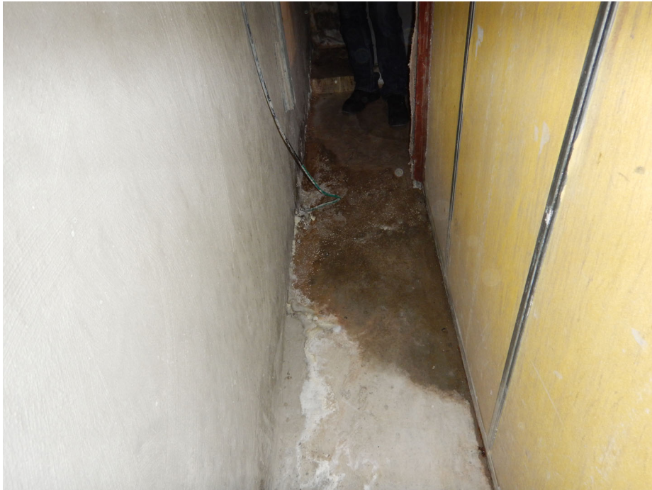
Photo 6: Efflorescence on wall base and water on floor adjacent to equipment (left side).