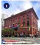
1 University Club 800 Powell Street Year Built: 1908 Significant for its Roman Renaissance Revival architecture designed by San Francisco architects of merit Bliss & Faville originally for Stanford University