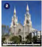
2 Saints Peter & Paul Church 600-660 Filbert Street Year Built: 1922-1924 Significant for its association with Italian American cultural heritage and for its Gothic Romanesque architecture