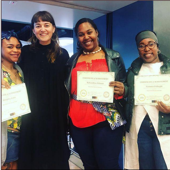
2019 SHEC grads, two of whom have since begun working for SFUSD.