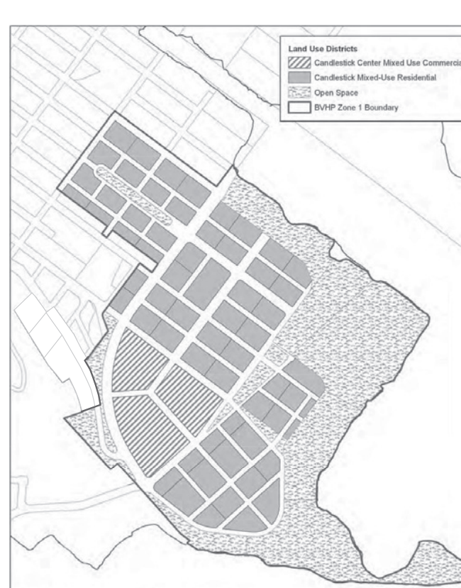
Map 4: Zone 1 Land Use Districts. Bayview Hunters Point Redevelopment Plan. Office of Community Investment and Infrastructure. 2018.