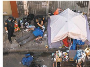
Nick Otto / Special to The Chronicle 2020

In signing the first state law clearing the way for safe injection sites this week, Rhode Island's governor provided an example of leadership that Cali-