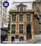
12 George Perine House 550 Powell Street Year Built: 1910 Significant as a rare and very late example of a second empire style house and as the only structure left downtown built as a single-family residence