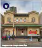
8 Central Chinese High School 827-829 Stockton Street Year Built: 1914 Significant for its association with Chinese cultural heritage as a school that promoted Chinese culture and study