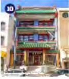
10 Chinese Consolidated Benevolent Association 848 Stockton Street Year Built: 1908 Significant for its association with Chinese cultural heritage as the former HQ of the six hui-tuan, an alliance of rival Chinese factions, which represented the interests of all Chinese in O.F. and the West