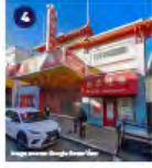
4 Great China Theater 626 Jackson Street Year Built: 1924 Significant for its association with Chinese cultural heritage originally occupied by the Ying Wei Lun Hoop Theatrical Co., a Chinese Opera company, and later as The Great Star Theater showing Chinese-language movies