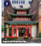
7 Chinese Telephone Exchange 748 Washington Street Year Built: 1909 Significant for its association with Chinese cultural heritage as the only Chinese telephone exchange in the United States