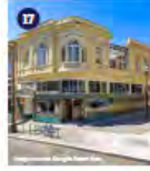
17 A. Cavalli Bookstore / Vesuvio Cafe 203 Columbus Avenue Year Built: 1913 Significant for its association with the Counterculture movement in San Francisco