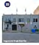
19 Italian Athletic Club 1690 Stockton Street Year Built: 1936 Significant for its association with Italian American cultural heritage and for its Art Deco style architecture