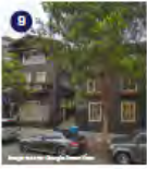
9 Telegraph Hill Neighborhood Association 1786 Stockton Street Year Built: 1907 Significant for its First Bay Tradition architecture designed by architect of merit Bernard Mayboeck