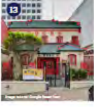
13 Nam Kue School 755 Sacramento Street Year Built: 1925 Significant for its association with Chinese cultural heritage as the original headquarters of the Rock Yam Benevolent Society and later as the earliest and longest surviving school preserving Chinese culture and language in America