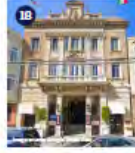
18 Fugazi Building 678 Green Street Year Built: 1912 Significant for its association with the Italian American cultural heritage, LGBTQ history in San Francisco, and architect of merit Italo Zanolini