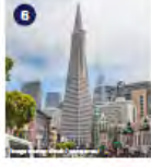
6 Transamerica Pyramid 600 Montgomery Street Year Built: 1976 Significant for its Brutalist architecture designed by architect of merit William Pereira & Associates