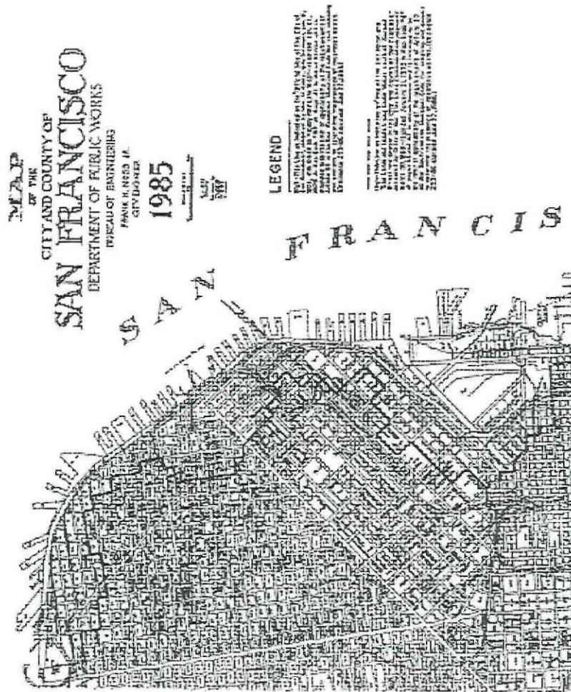
FIGURE 1A-I -1851 HIGH-TIDE LINE MAP

1 2 3 4 5 6 7 8 9 10 11 12 13 14 15 16 17 18 19 20 21 22 23 24 25