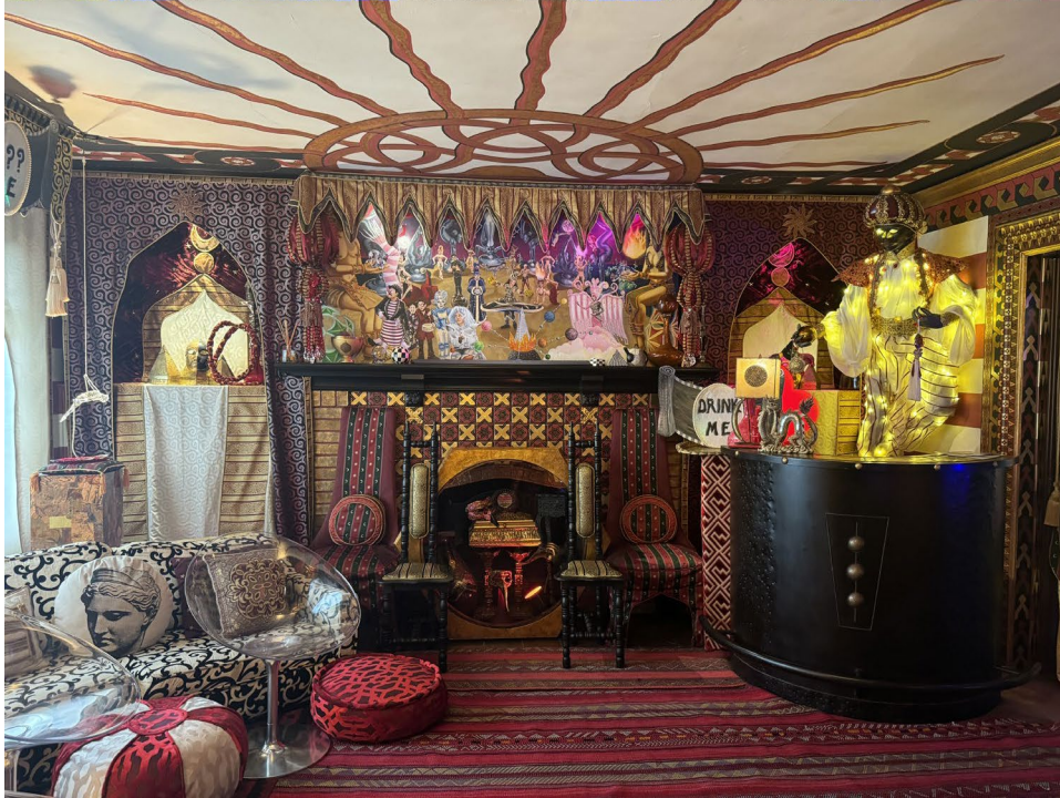
The Gregangelo Museum, 225 San Leandro Way, 2024