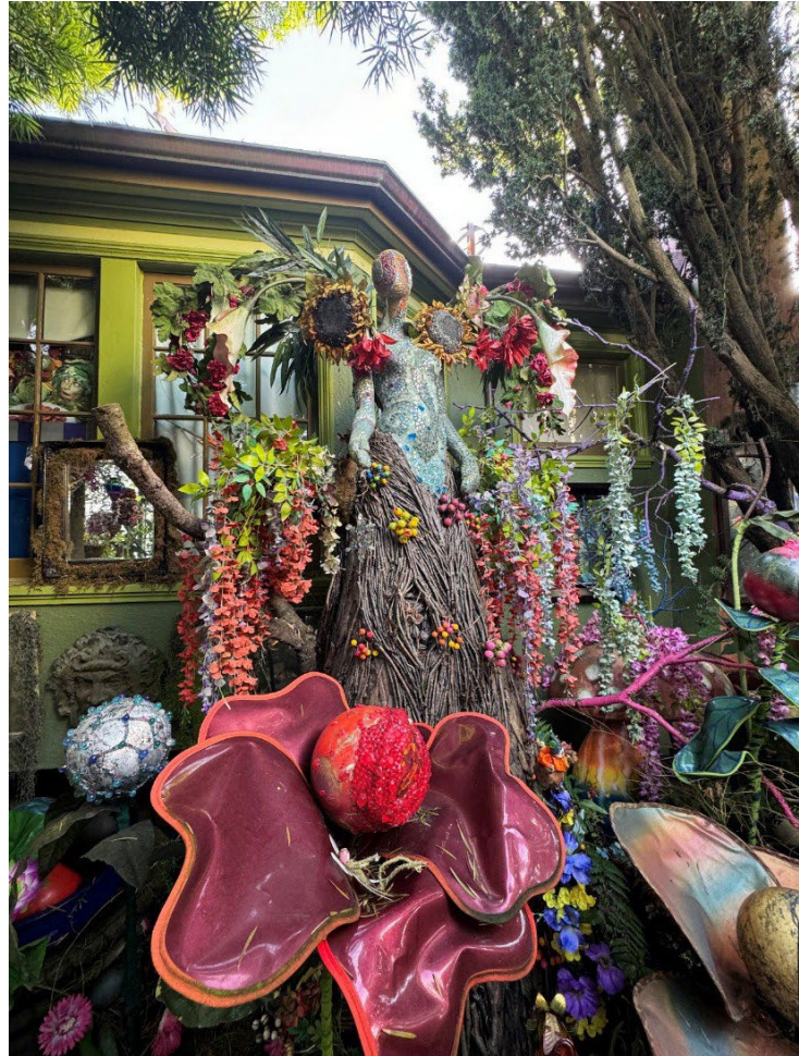
The Gregangelo Museum, 225 San Leandro Way, 2024