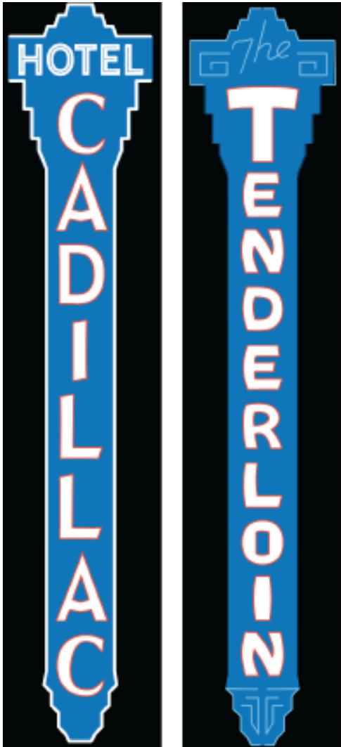
Figures 2 and 3: Proposed Cadillac Hotel 2-sided blade sign