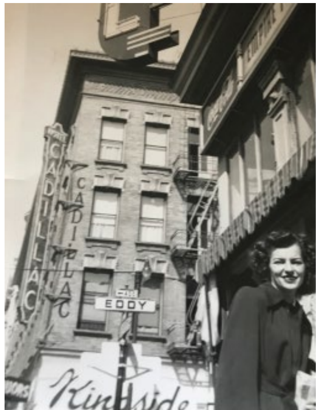
Figure 1: Historical photo of Cadillac Hotel circa 1940

The Tenderloin Museum is located on the ground floor of the Cadillac Hotel, a historic Residential Hotel. Signs proposed for Residential Hotels, such as Cadillac Hotel, are considered Identifying Signs 3 . The Cadillac Hotel / Tenderloin Museum is seeking to restore a blade sign at the property (see Figures 1-3). These blade signs are considered “Projecting Signs” under the Planning Code since they project out and extend beyond either the street property line or building setback. The Cadillac Hotel / Tenderloin Museum have worked with Neon Sign experts at SF Neon to design a replica of the historical sign noting the appropriate size and colors. Part of the process has also included adding a non-commercial on the other side that says “Tenderloin” to pay homage to the neighborhood. The Tenderloin Museum received Community Challenge funding, which is awarded to civic beautification projects to improve neighborhoods.