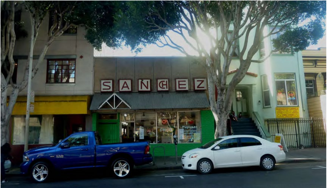
Casa Sanchez (2778 24 th Street) and adjacent buildings, primary (south) façade, view north, 2016.