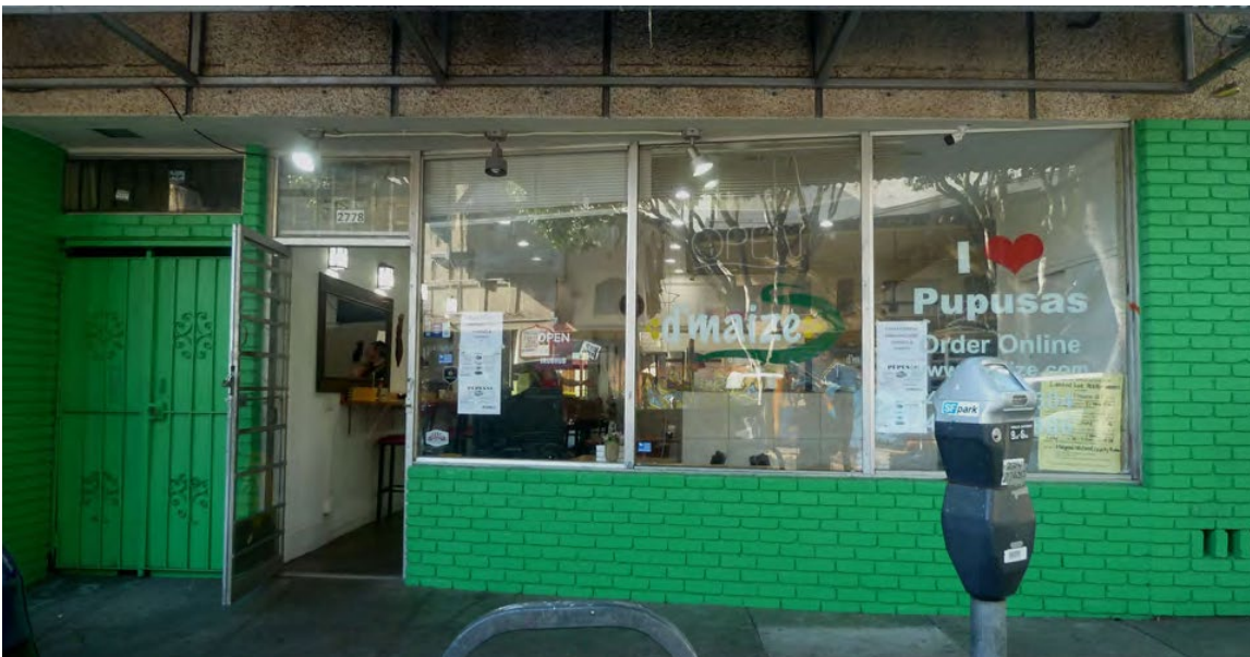
Casa Sanchez (2778 24 th Street), primary façade ground floor, view north, 2016.