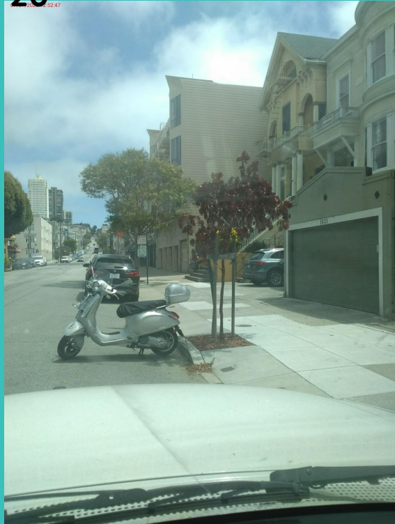
dead fuf tree. too small to post.