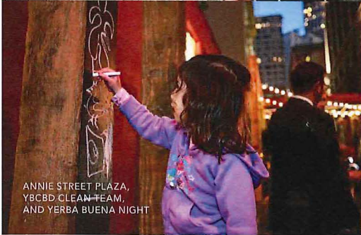
ANNIE STREET PLAZA, YBCBD CLEAN TEAM, AND YERBA BUENA NIGHT