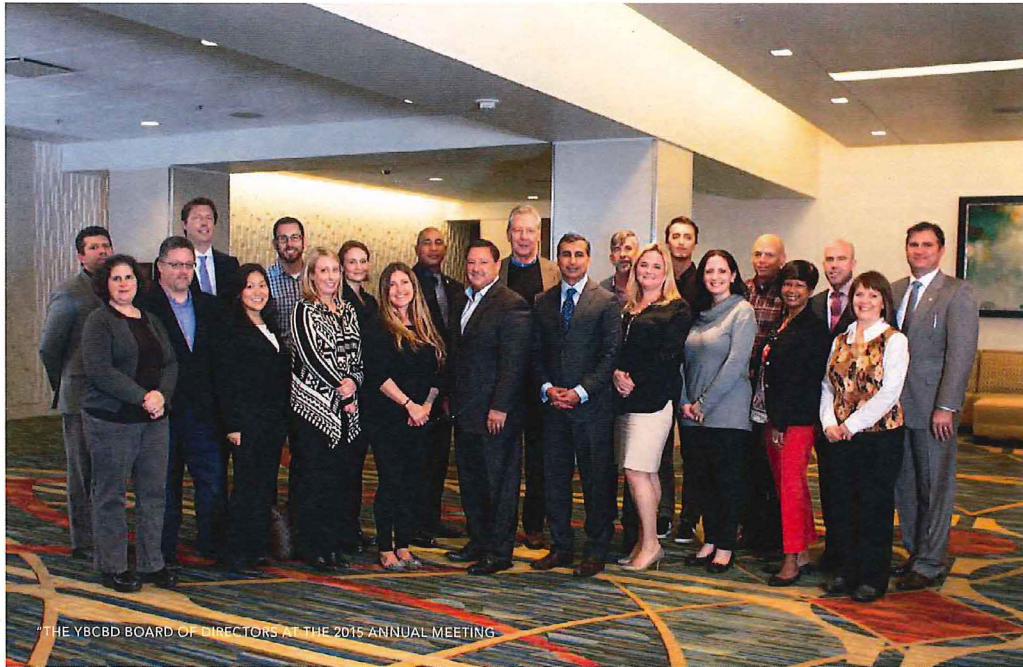
THE YCBCD BOARD OF DIRECTORS AT THE 2015 ANNUAL MEETING