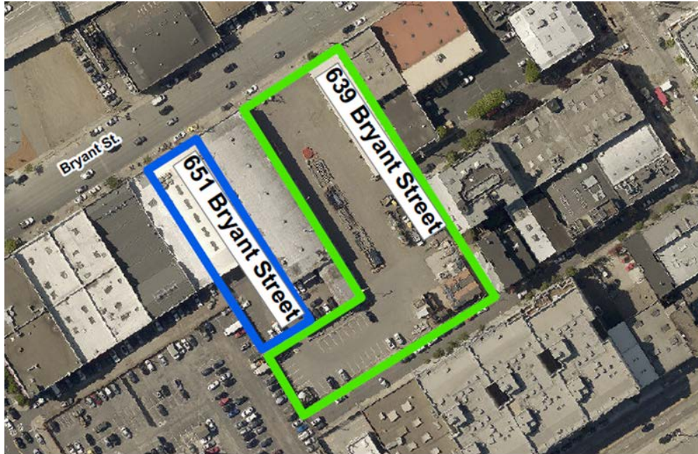
Exhibit 1: 639 Bryant Street and 651 Bryant Street

The parcels at 651 Bryant and 639 Bryant are shown in Exhibit 1 below.