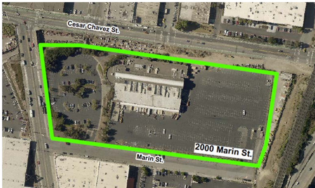
Exhibit 2: 2000 Marin Street