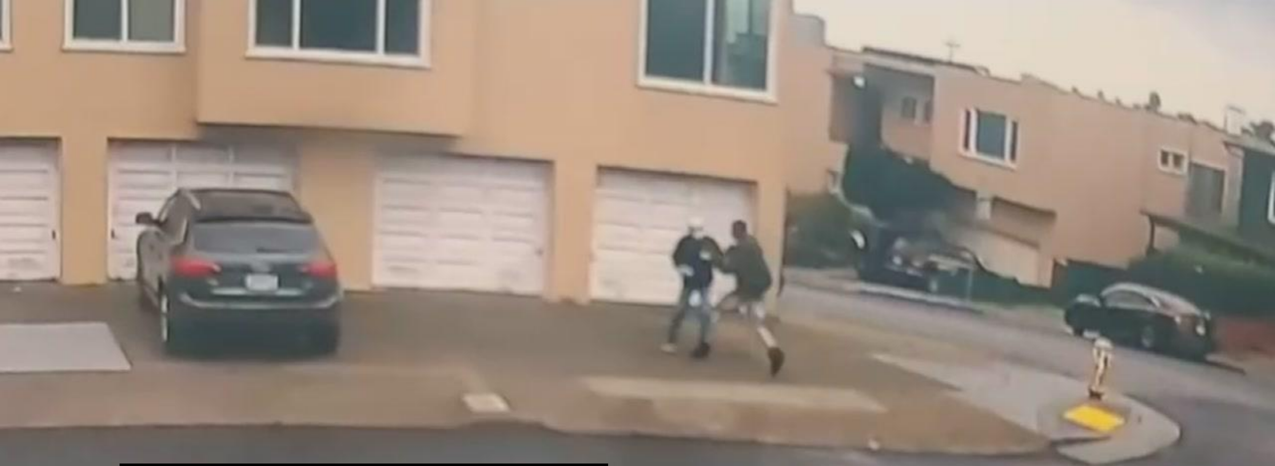
January 28, 2021 Consent for video led to arrest of suspect two days after this incident