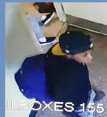
A couple seconds later, suspects return to beat and rob victim a second time as she tries to escape