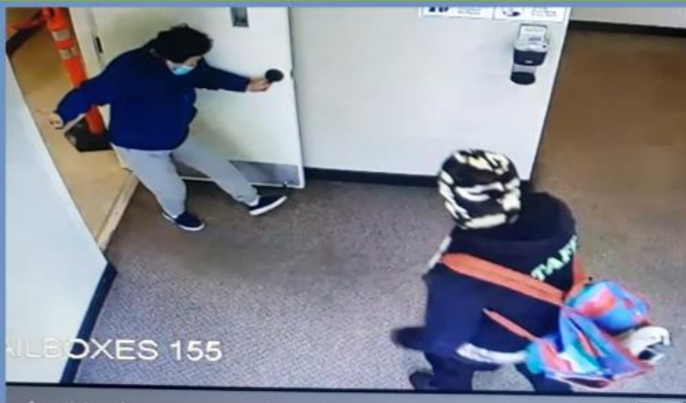
Images from first brutal robbery

July 31, 2022 Consent for video led to capture of suspects in this crime