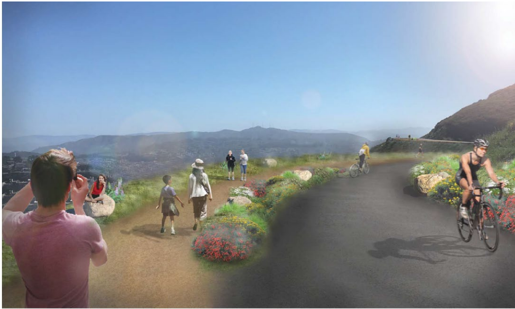
PERSPECTIVE VIEW: LOOKING SOUTH FROM EAST OF NORTH PEAK