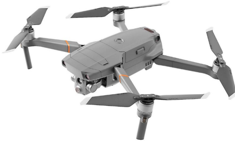
Small Unmanned Aircraft Systems