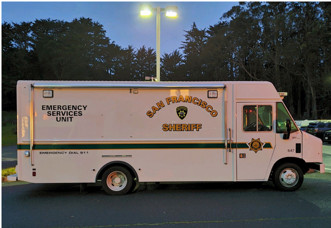
Rapid Response Vehicle (actual SHF equipment)