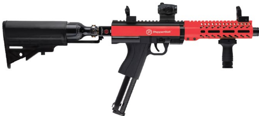
PepperBall PPC Breacher