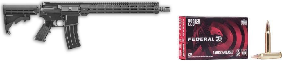
(.556 / .223) Calibre Rifle & Ammunition