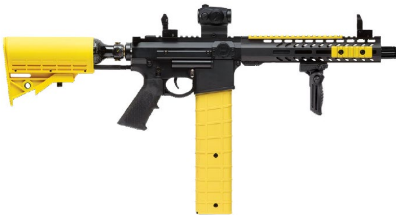
PepperBall VKS PRO