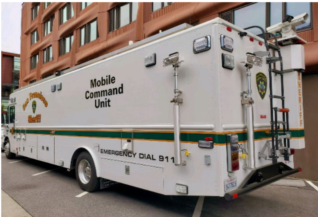
Mobile Command Unit (actual SHF equipment)