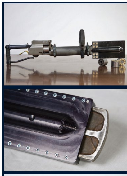
Kinetic Breaching Tool