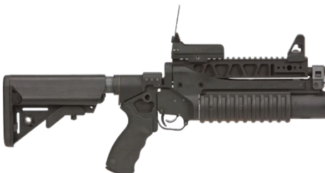
40 MM Chemical Agent Launcher