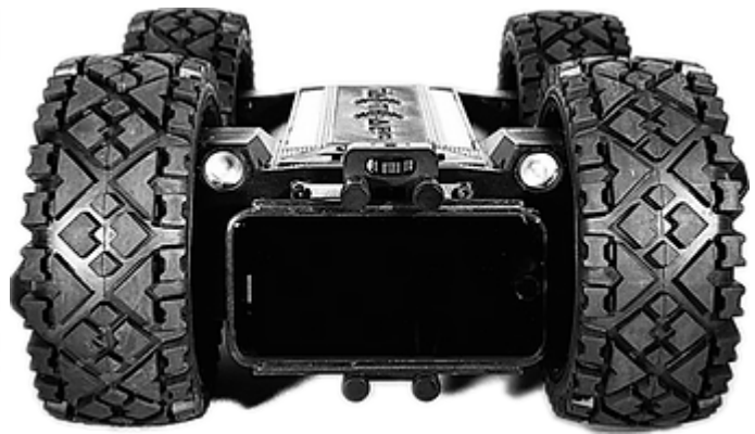
(Left) Recon Scout Robot, to be replaced by 4Sight Tactical R/C (Right).