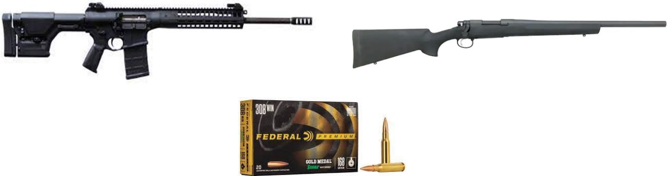
Sniper Rifles & Ammunition