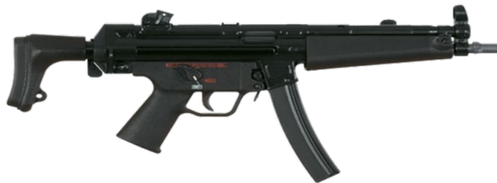
MP-5 Sub-Machine Gun