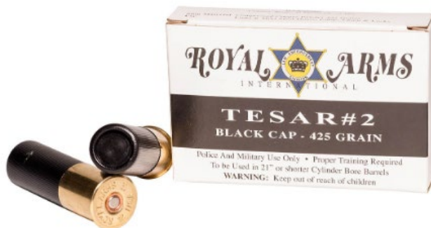
Breaching Shotgun & Ammunition