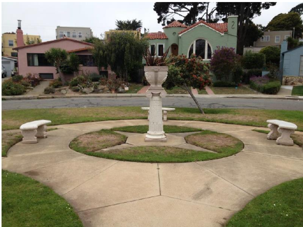
Ionic column, urn, and benches, top; Marble dedication plaque, bottom. Ingleside Terraces Sundial, HALS CA-99, https://www.loc.gov/pictures/item/ca4152/