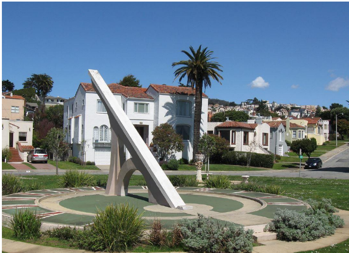
Ingleside Terraces Sundial and Sundial Park, SF Heritage photo included in Board File No. 201299, top; Benches, urns, star-shaped ornamental paving, and walkways, Google, bottom.