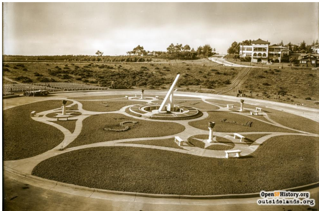
1913, Western Neighborhoods Project – wnp4.17, top; The Mercury News, Jane Tyska/Bay Area News Group, bottom, https://www.mercurynews.com/wp-content/uploads/2020/02/SJM-L-10COOL-0223-18.jpg?w=1280