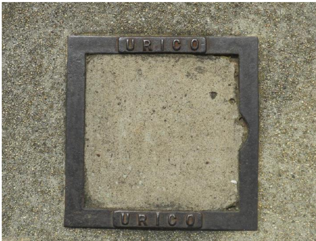
URICO Grate, Ingleside Terraces Sundial, HALS CA-99, https://www.loc.gov/pictures/item/ca4152/