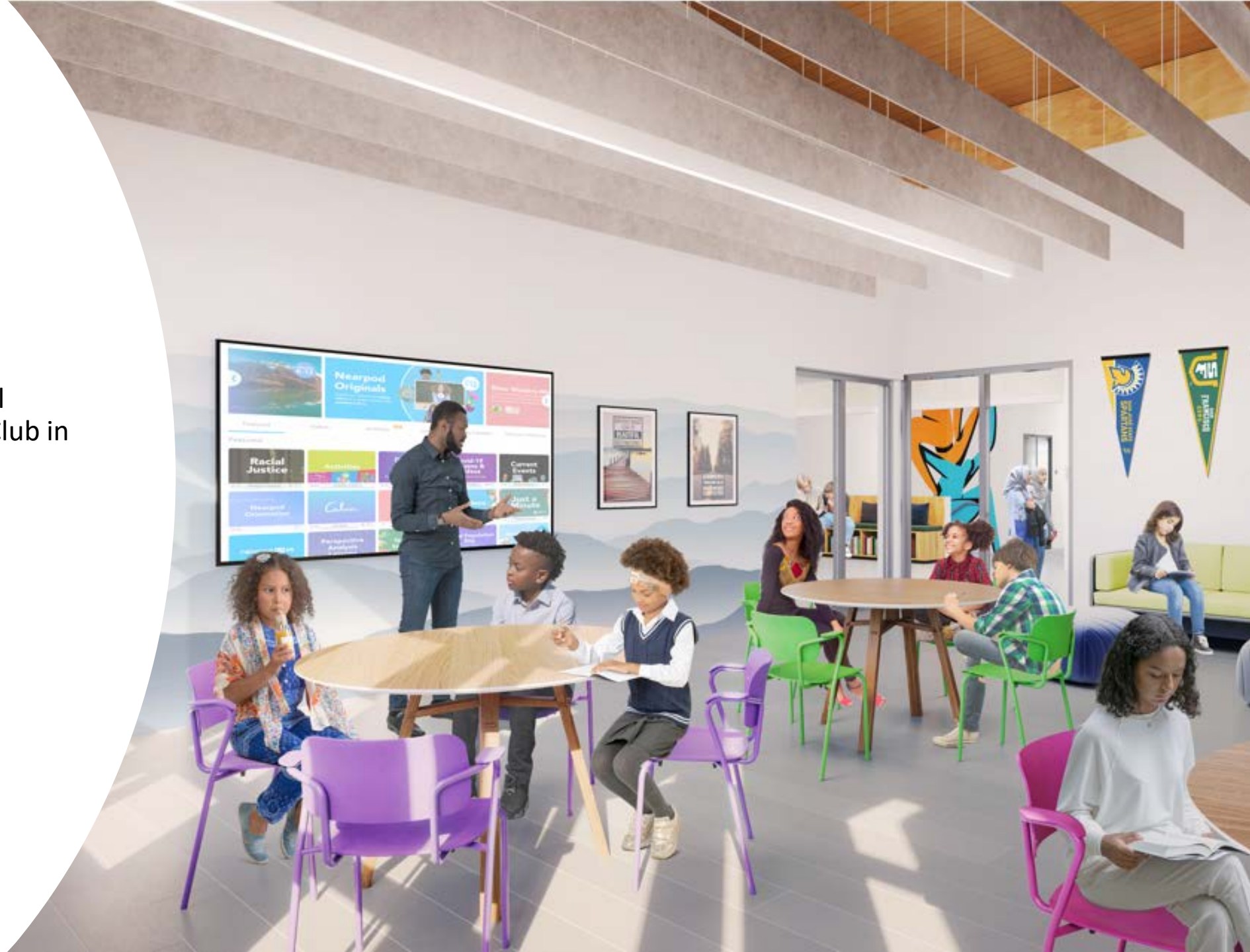
Rendering of the Middle School Classroom at the Boys & Girls Club in the Community Center