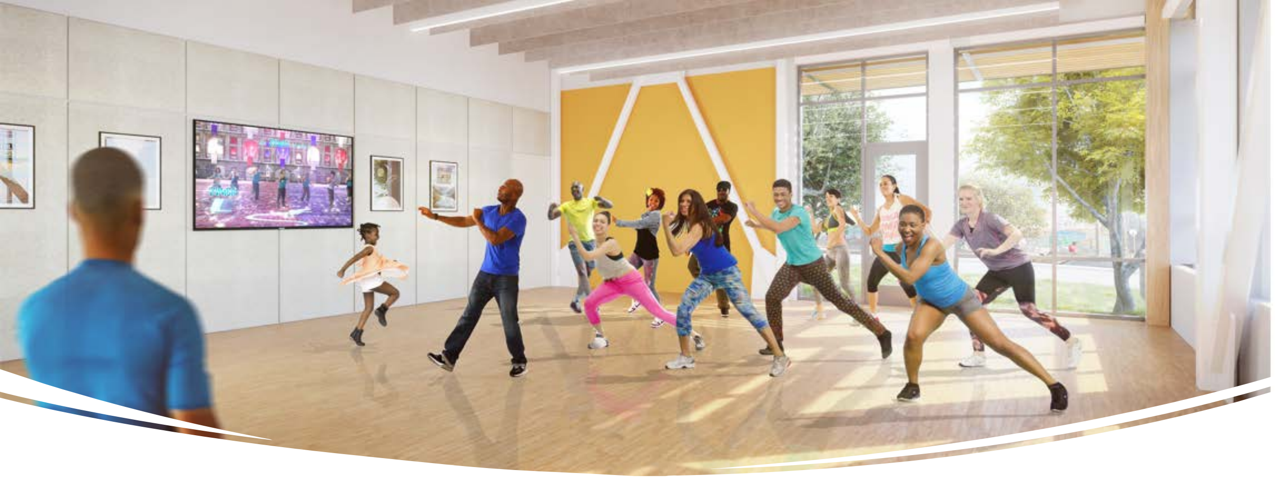
Rendering of a Zumba class in one of the multi purpose rooms