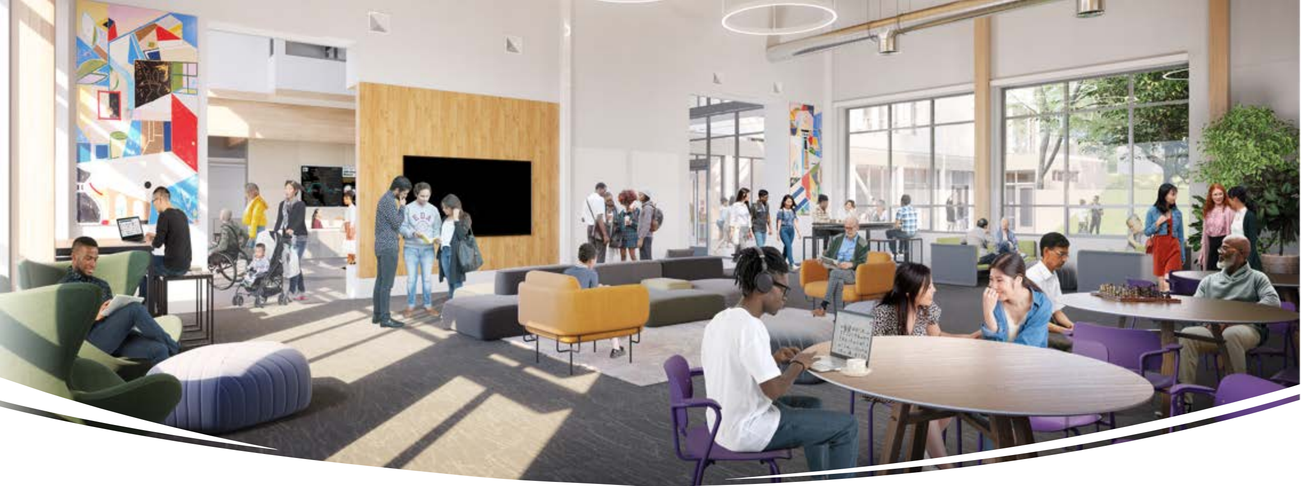
A rendering of the Living Room in the Community Center