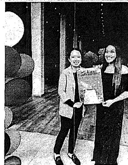
Kim Ono Kimonos Participating with Balloons and In-Store Specials