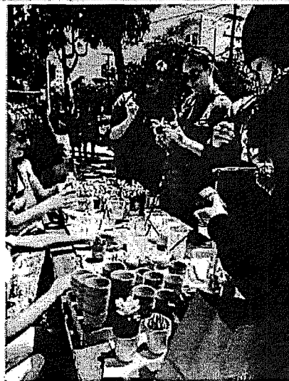
Customer Engagement That Could Not Take Place in the Store