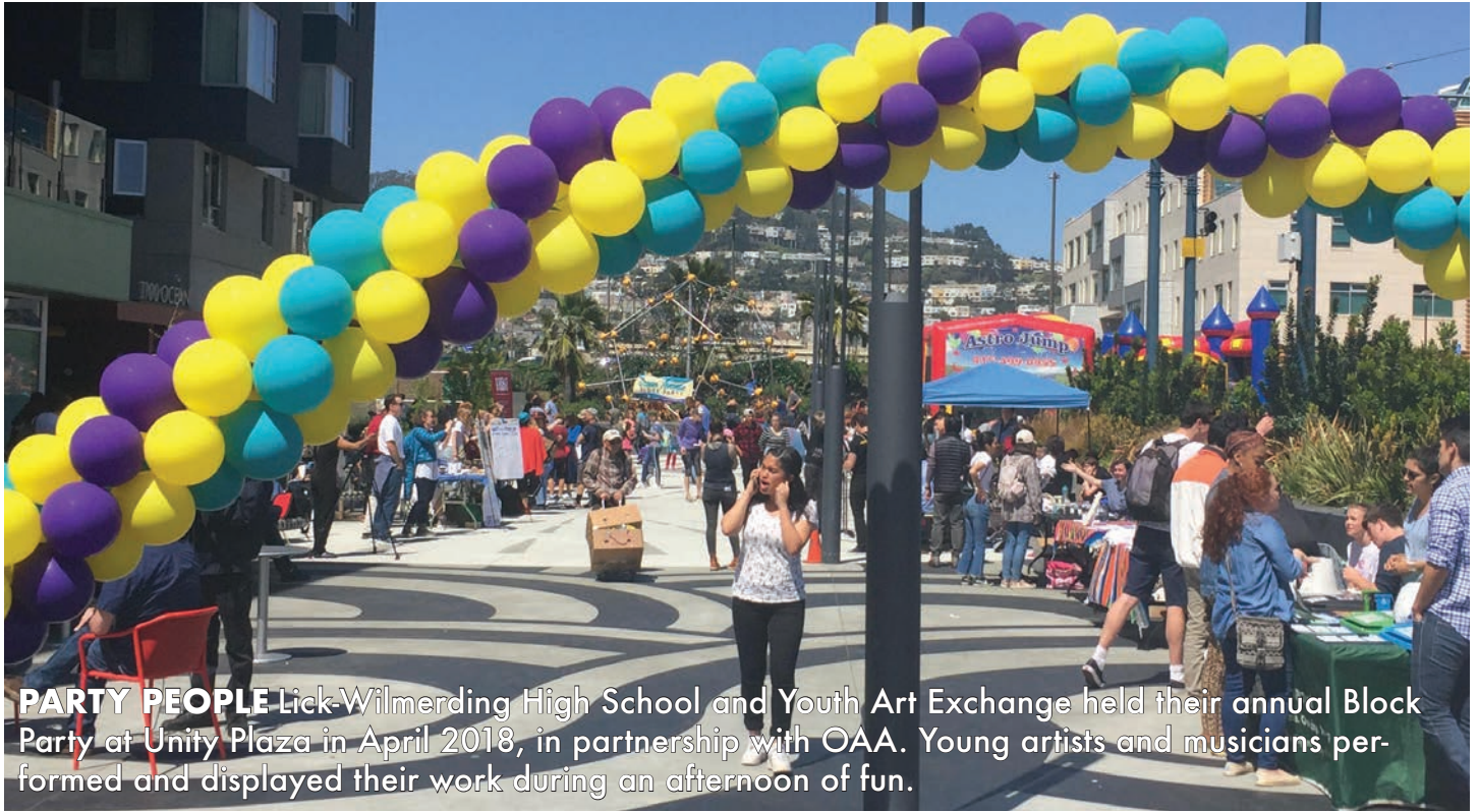
PARTY PEOPLE Lick-Wilmerding High School and Youth Art Exchange held their annual Block Party at Unity Plaza in April 2018, in partnership with OAA. Young artists and musicians performed and displayed their work during an afternoon of fun.