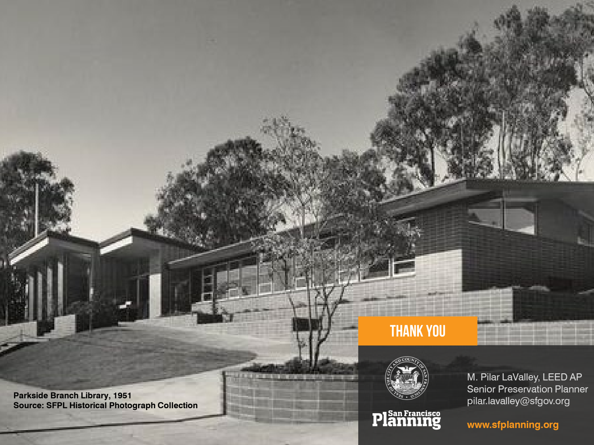
Parkside Branch Library, 1951