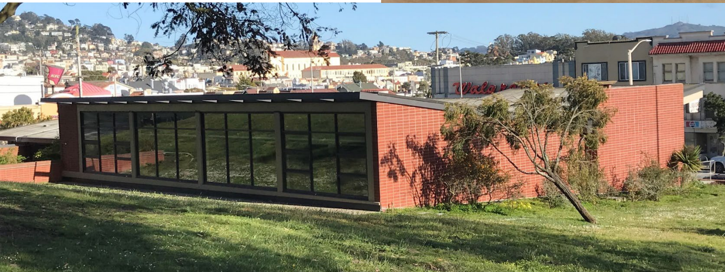
Parkside Branch Library, north and west elevations, 2023