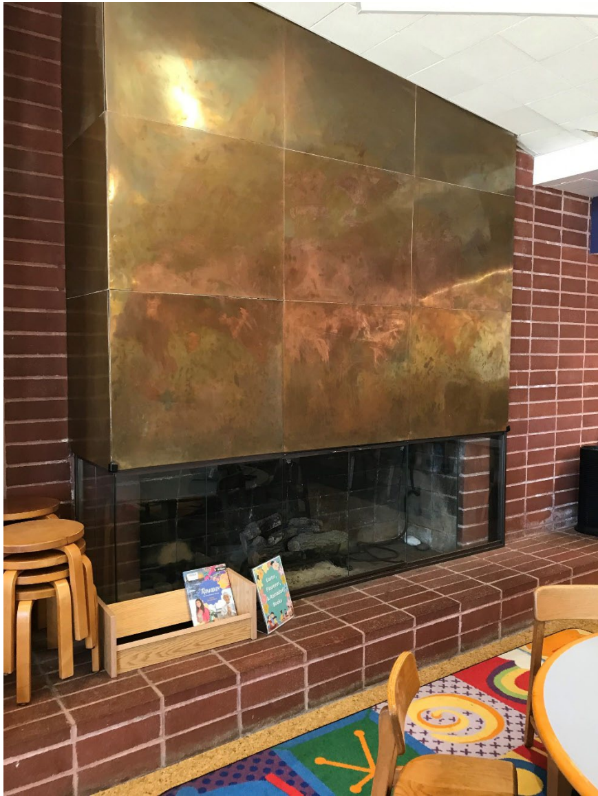
Parkside Branch Library, fireplace in former Reading Room, 2023