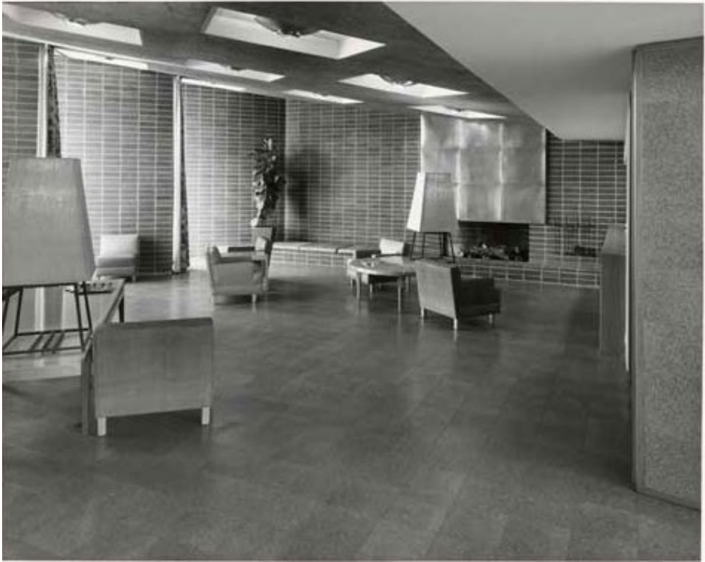
Parkside Branch Library, former Reading Room, circa 1951