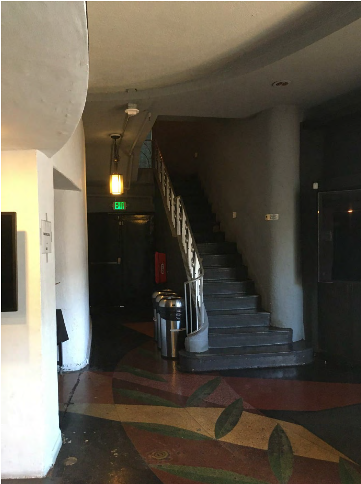
Grand Theater, lobby/foyer, view south, 2023.