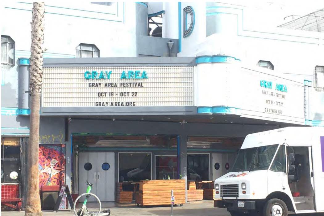
Grand Theater, marquee and entrance vestibule, view east, 2023.