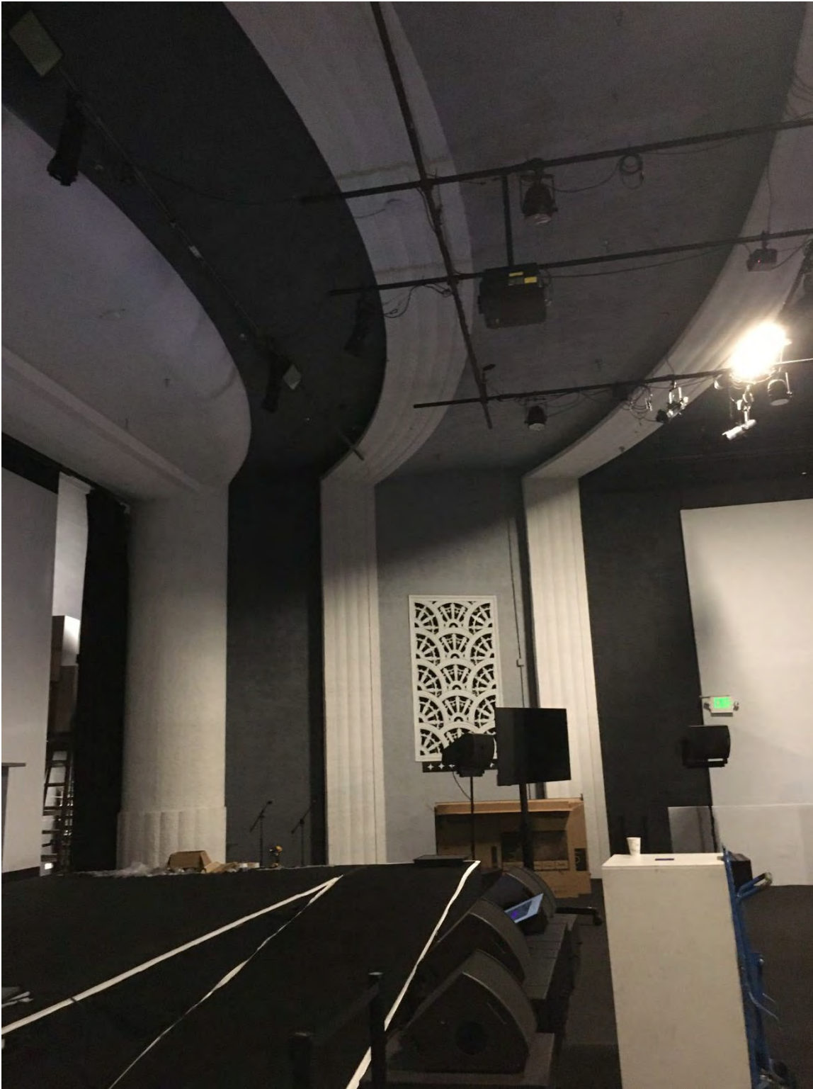
Grand Theater, auditorium with proscenium details, view south, 2023.