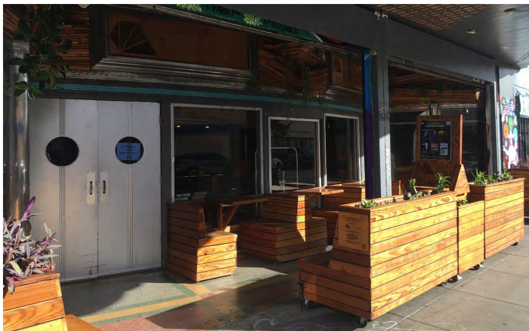
Grand Theater, entry vestibule, view east, 2023.