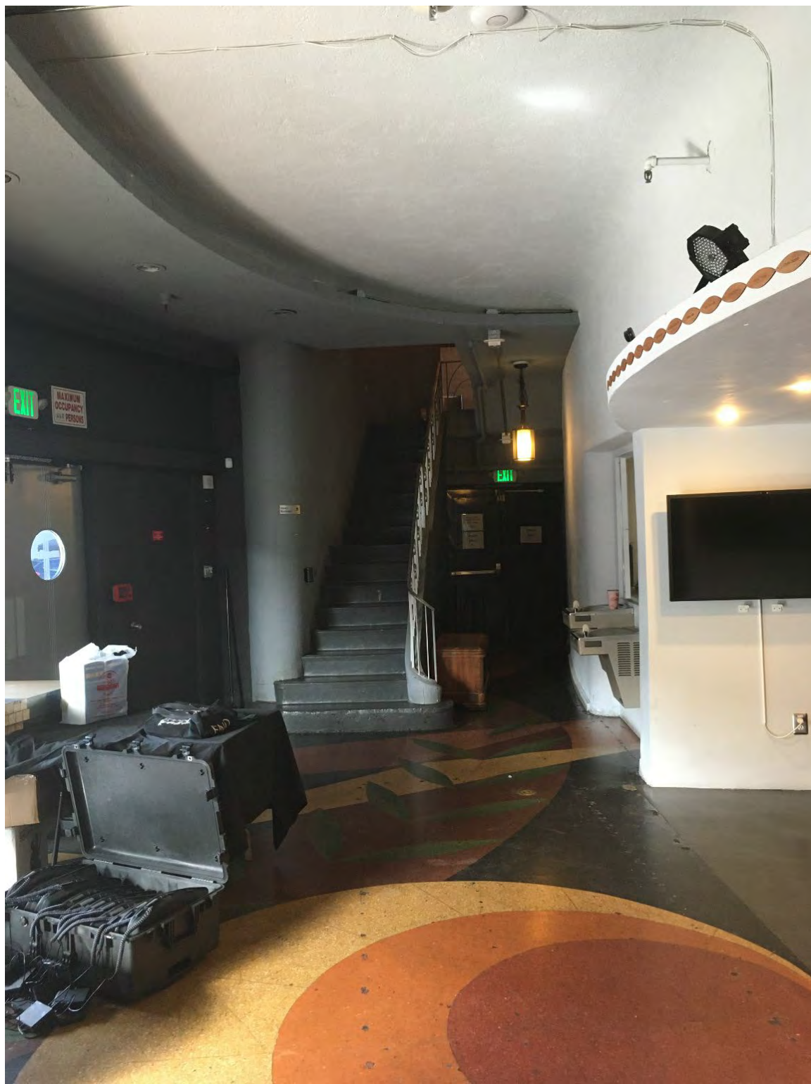
Grand Theater, lobby/foyer, view north, 2023.