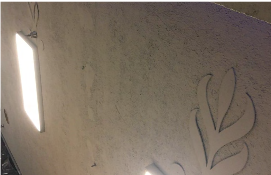
Grand Theater, detail of foliate decals on former auditorium ceiling, 2023.