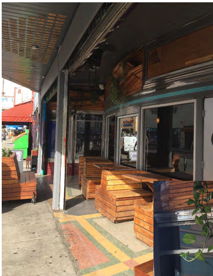
Grand Theater, entry vestibule and storefront details, 2023.