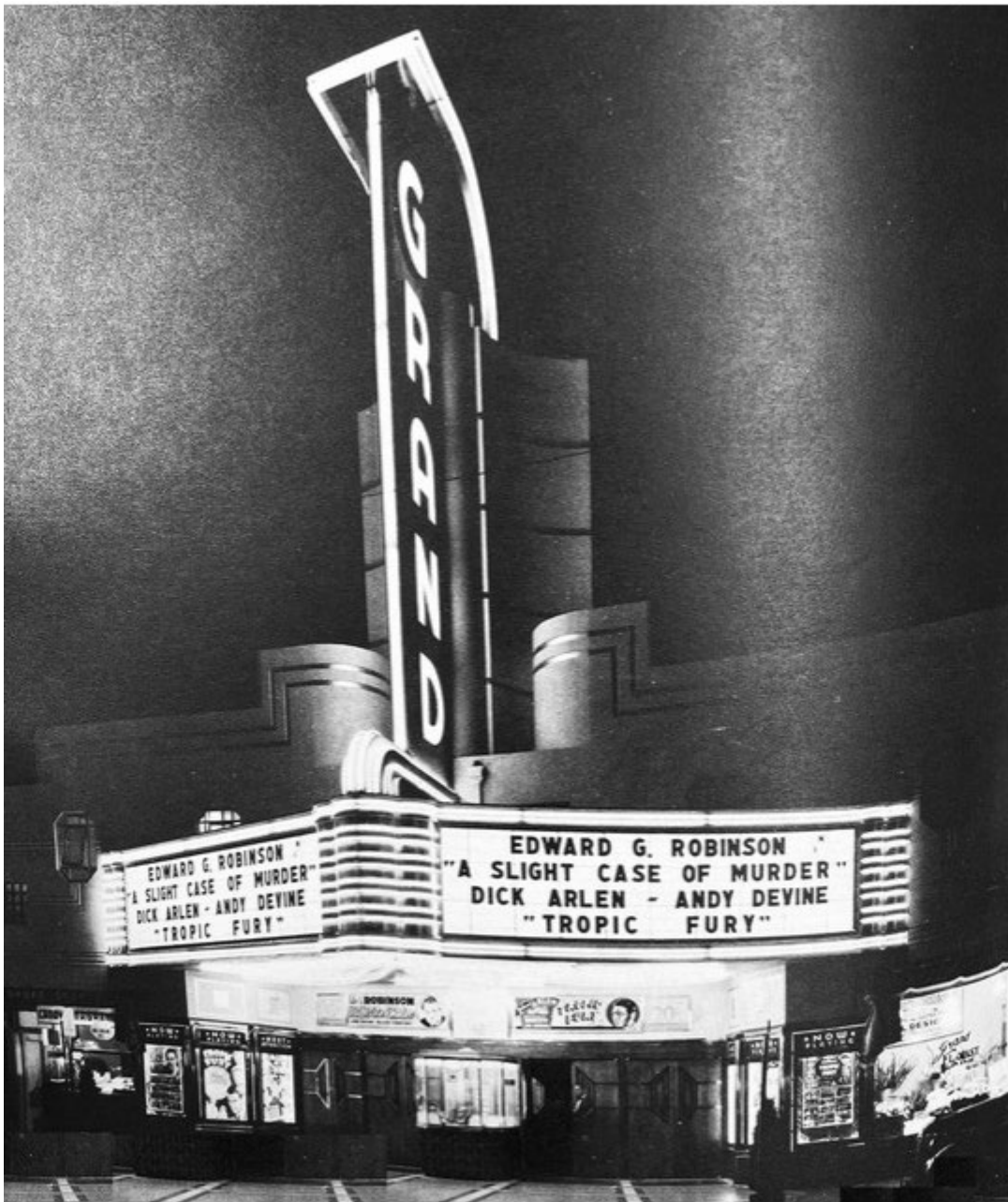
Grand Theater, 1941: Source: San Francisco Theatres: The Grand Theatre