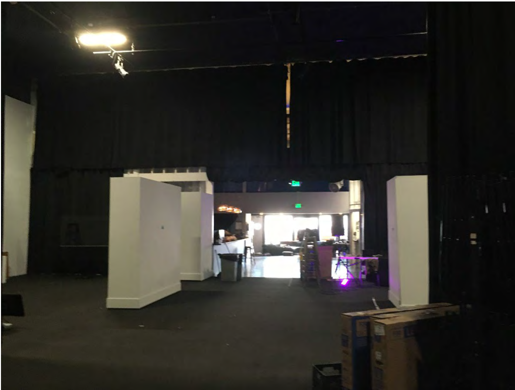
Grand Theater, auditorium, view west, 2023.