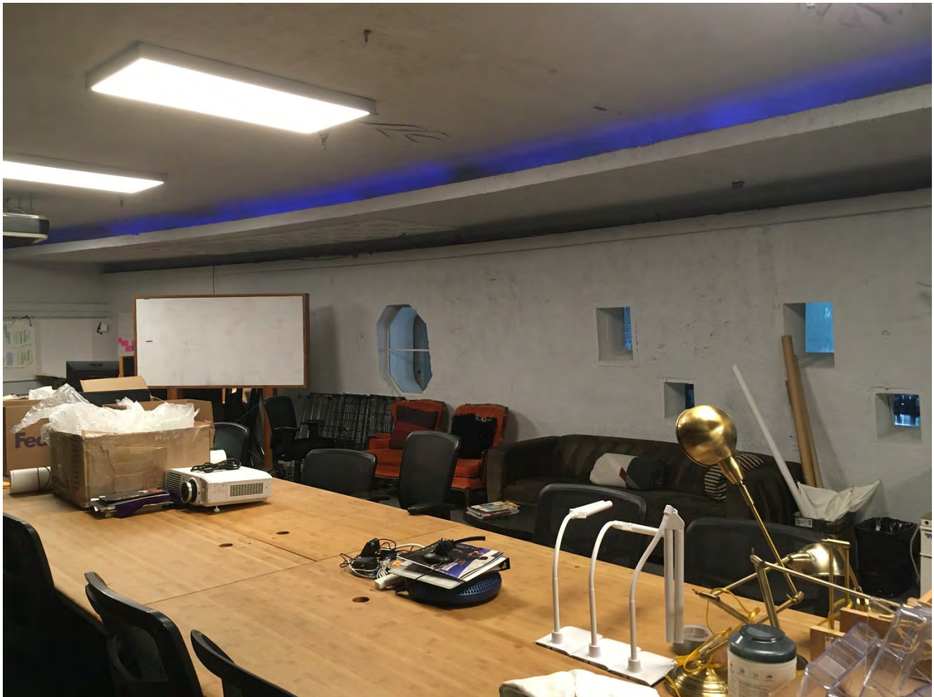
Grand Theater, second floor interior addition with original rear wall of auditorium and holes in wall for projection booth, 2023.