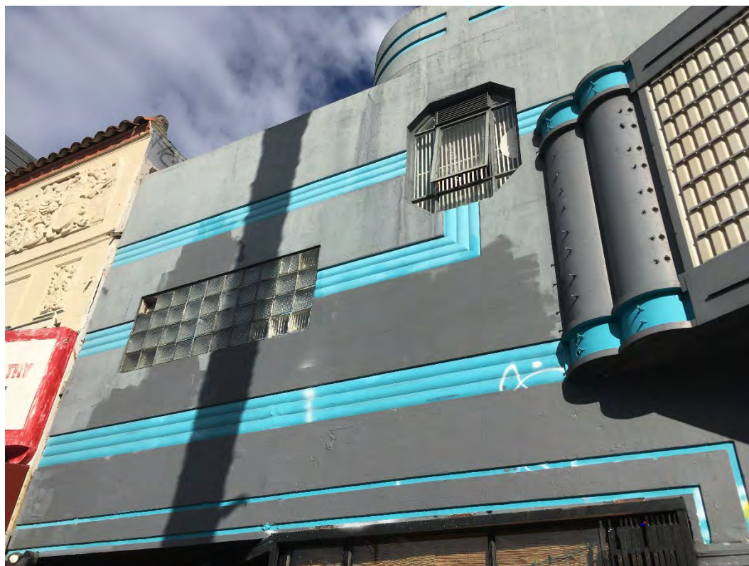
Grand Theater, façade details, 2023.