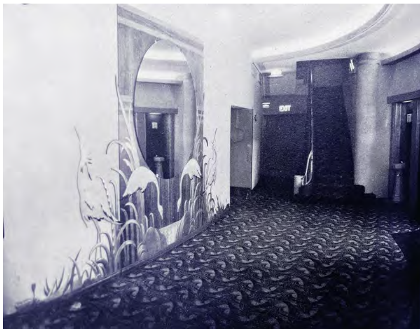
Grand Theater, foyer, circa 1940.