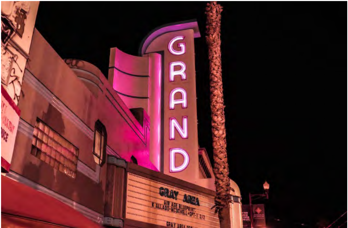
Grand Theater, newly reilluminated neon sign, February 2023.

Source: Mission Moves: After 30 years, Grand Theater sign shines anew (missionlocal.org)