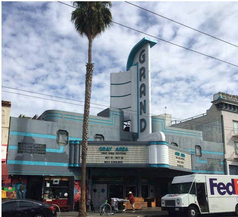
Grand Theater, 2023