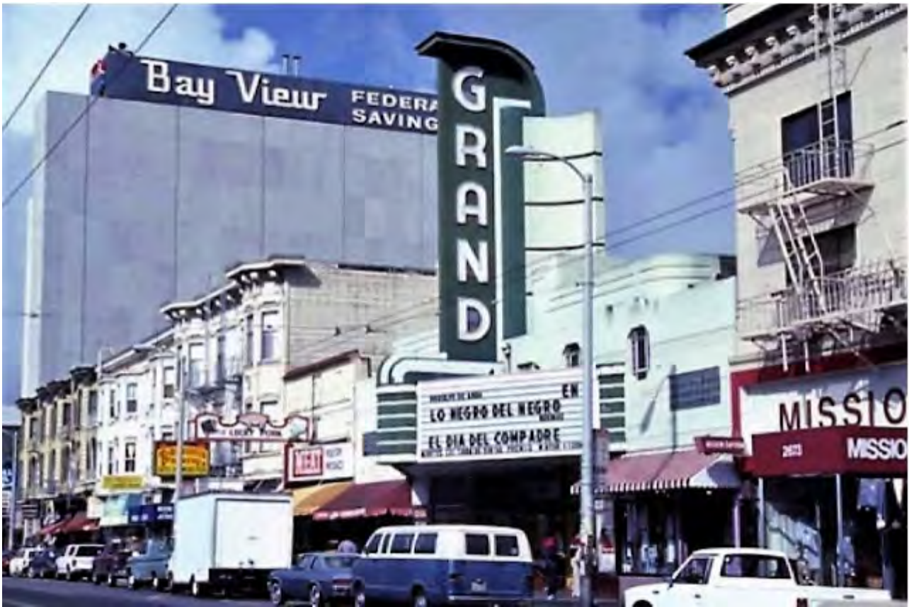
Grand Theater, circa 1980.