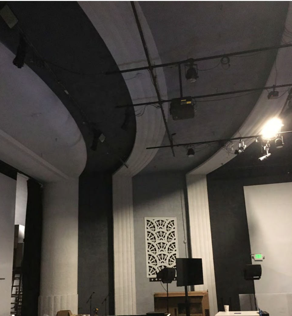
Grand Theater, 2023