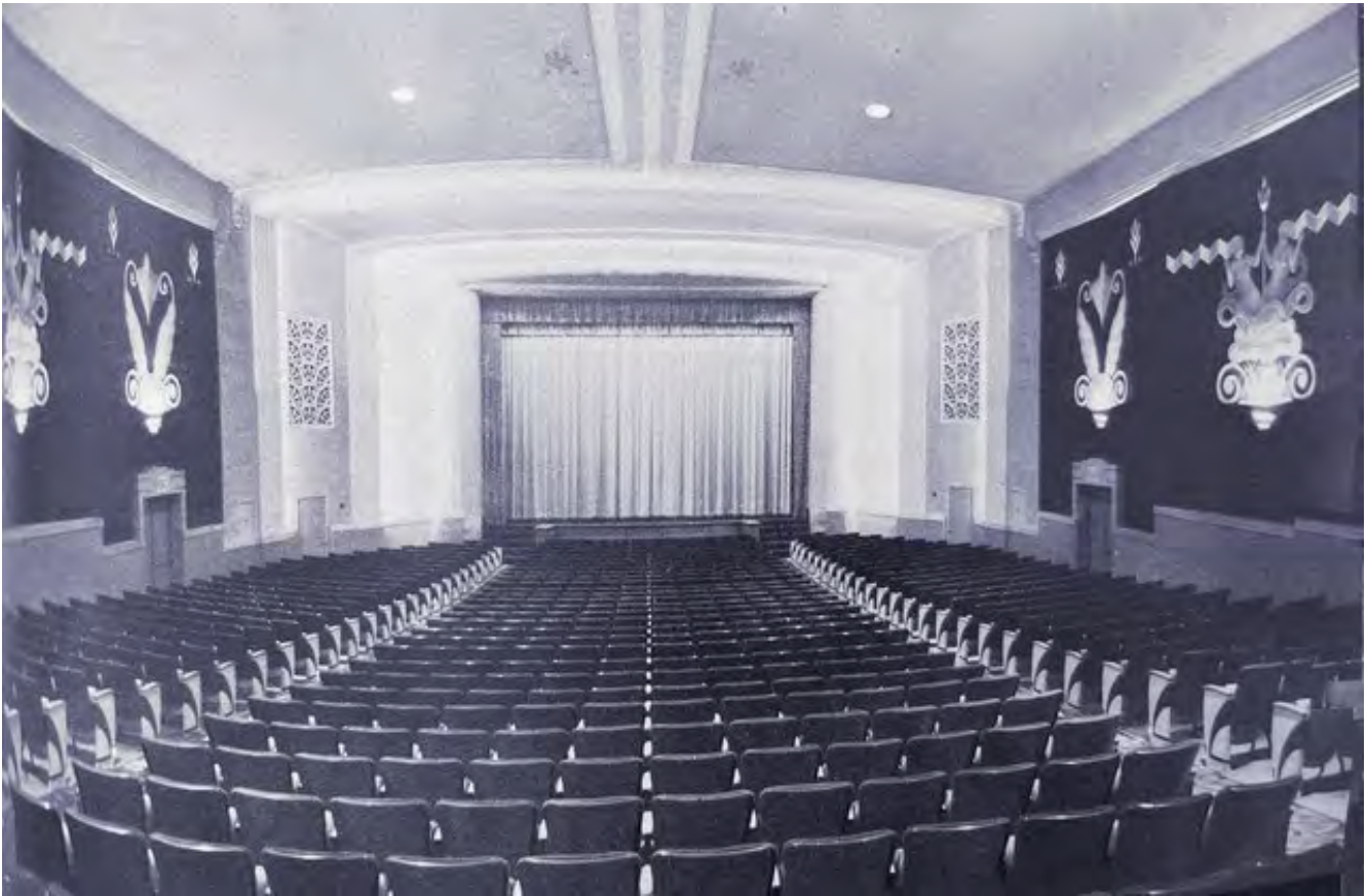
Grand Theater, auditorium, circa 1940.