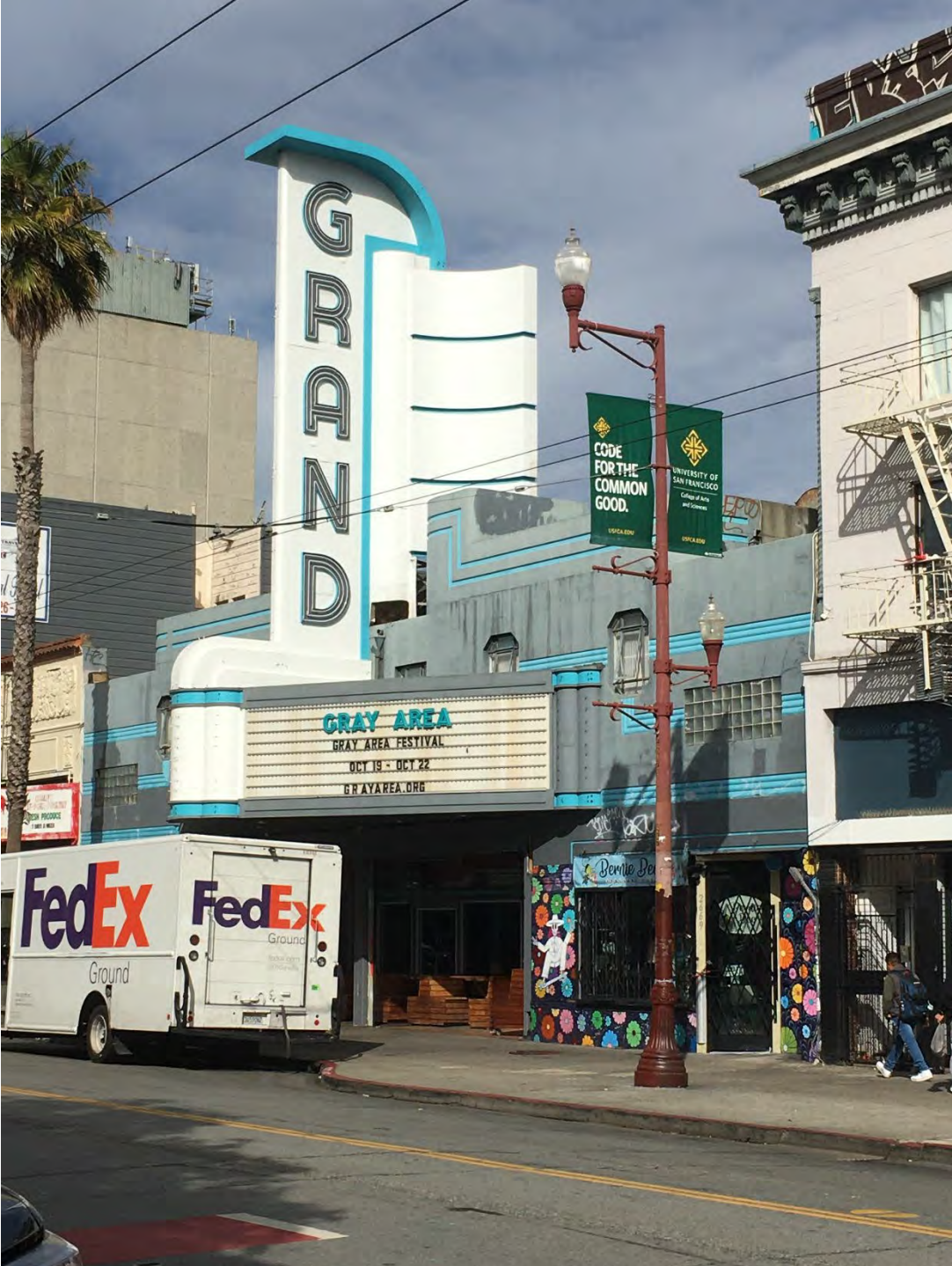
Grand Theater, façade, view north, 2023.