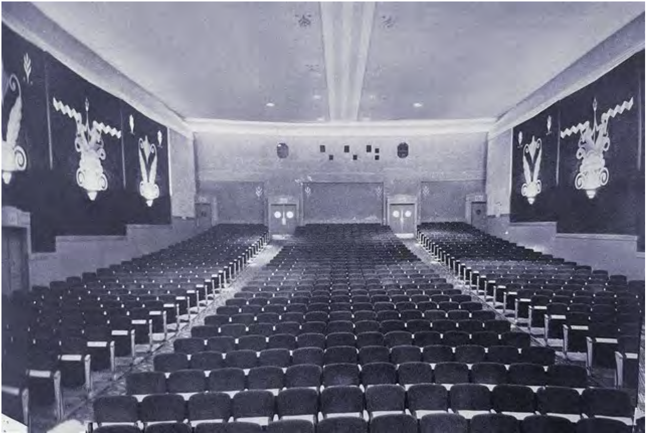
Grand Theater, auditorium, circa 1940.