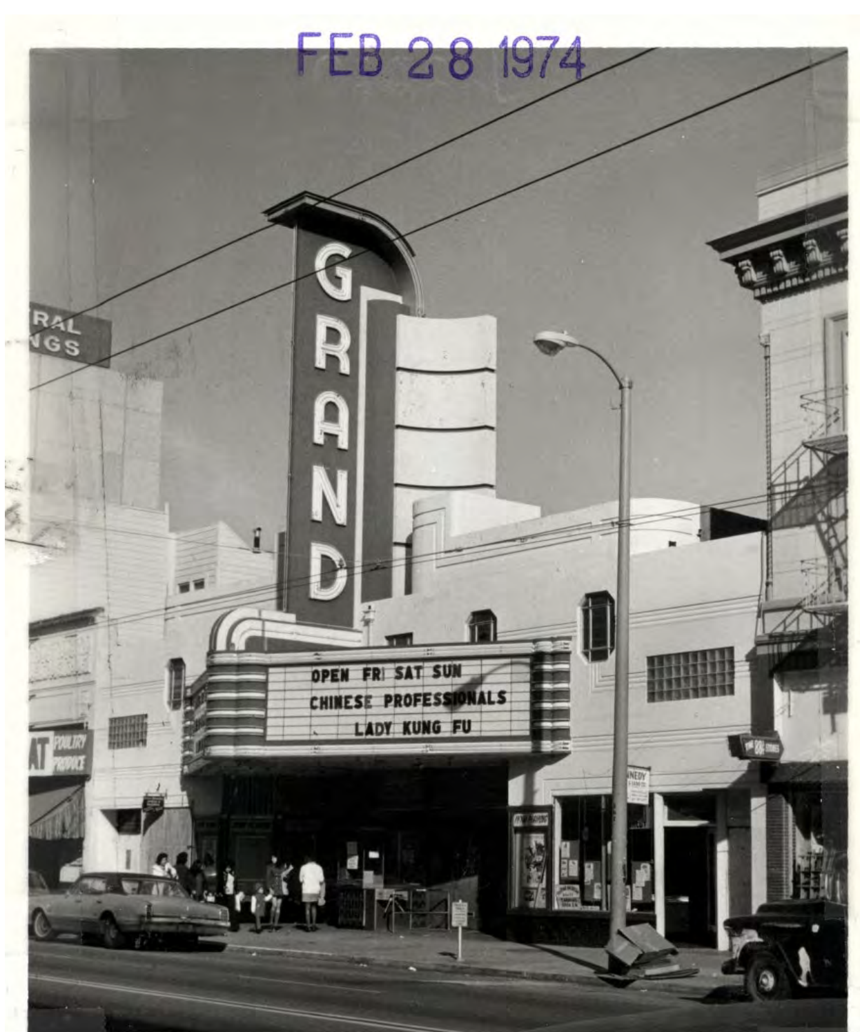
Grand Theater, 1974.