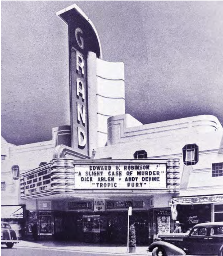
Grand Theater, 1941