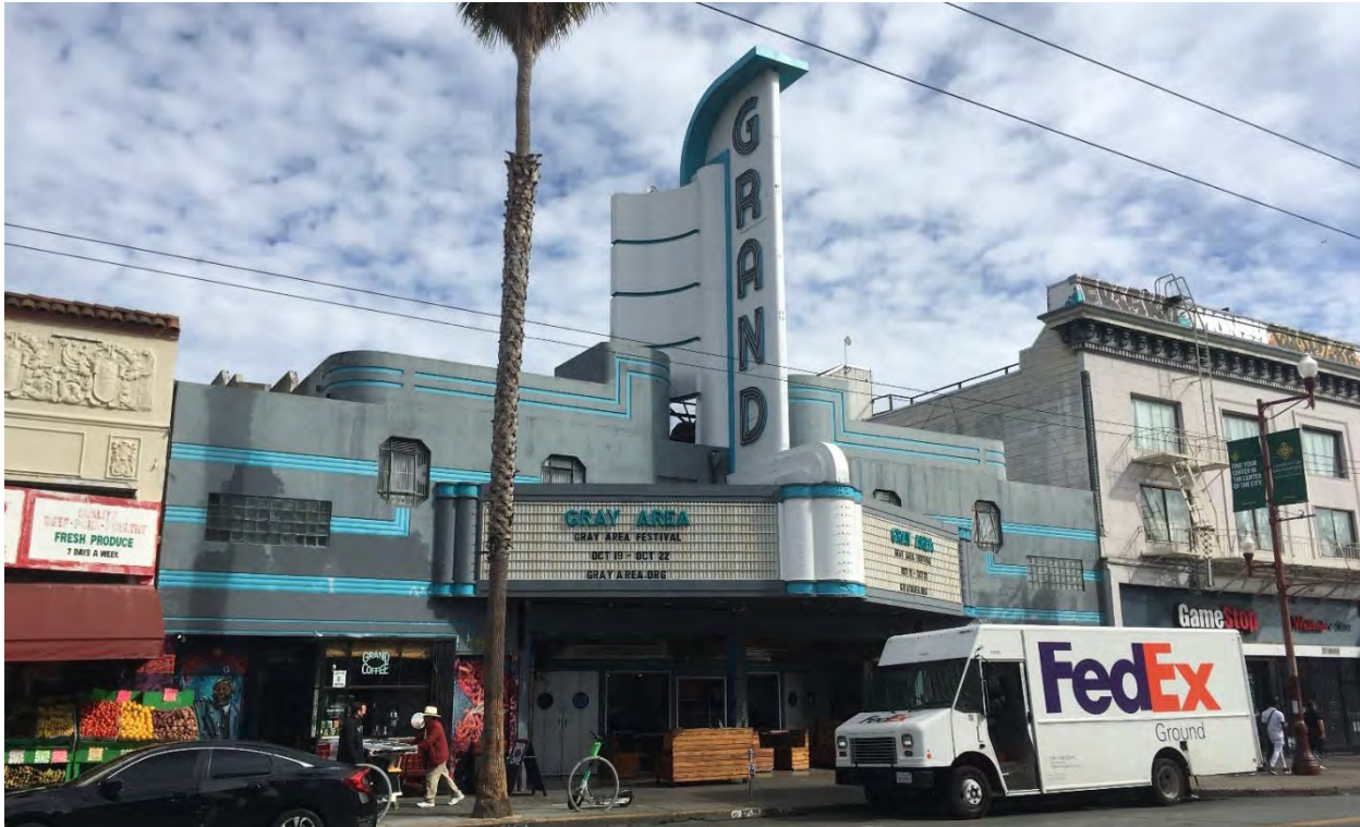
Grand Theater, façade, view east, 2023.