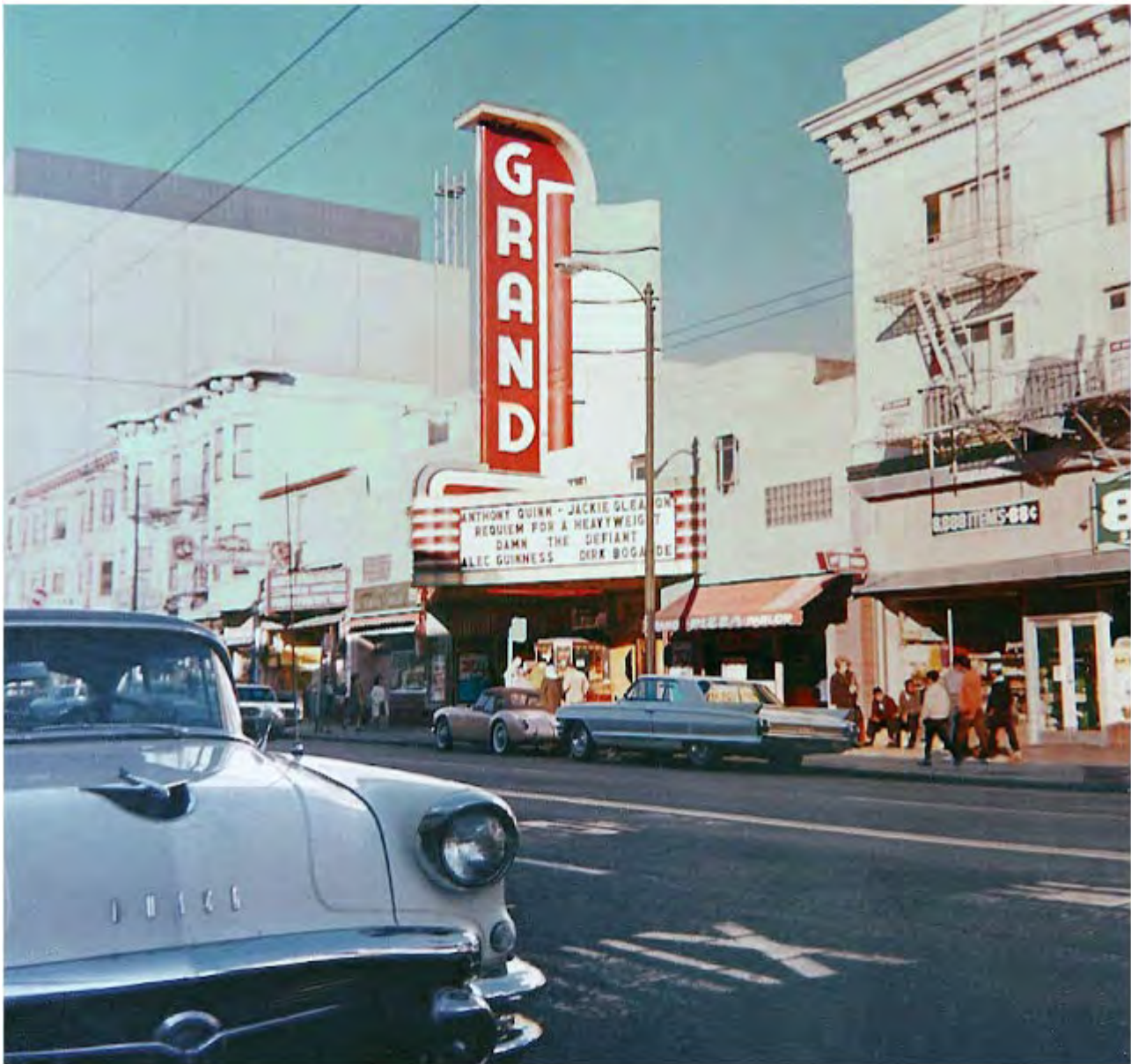
Grand Theater, 1963.