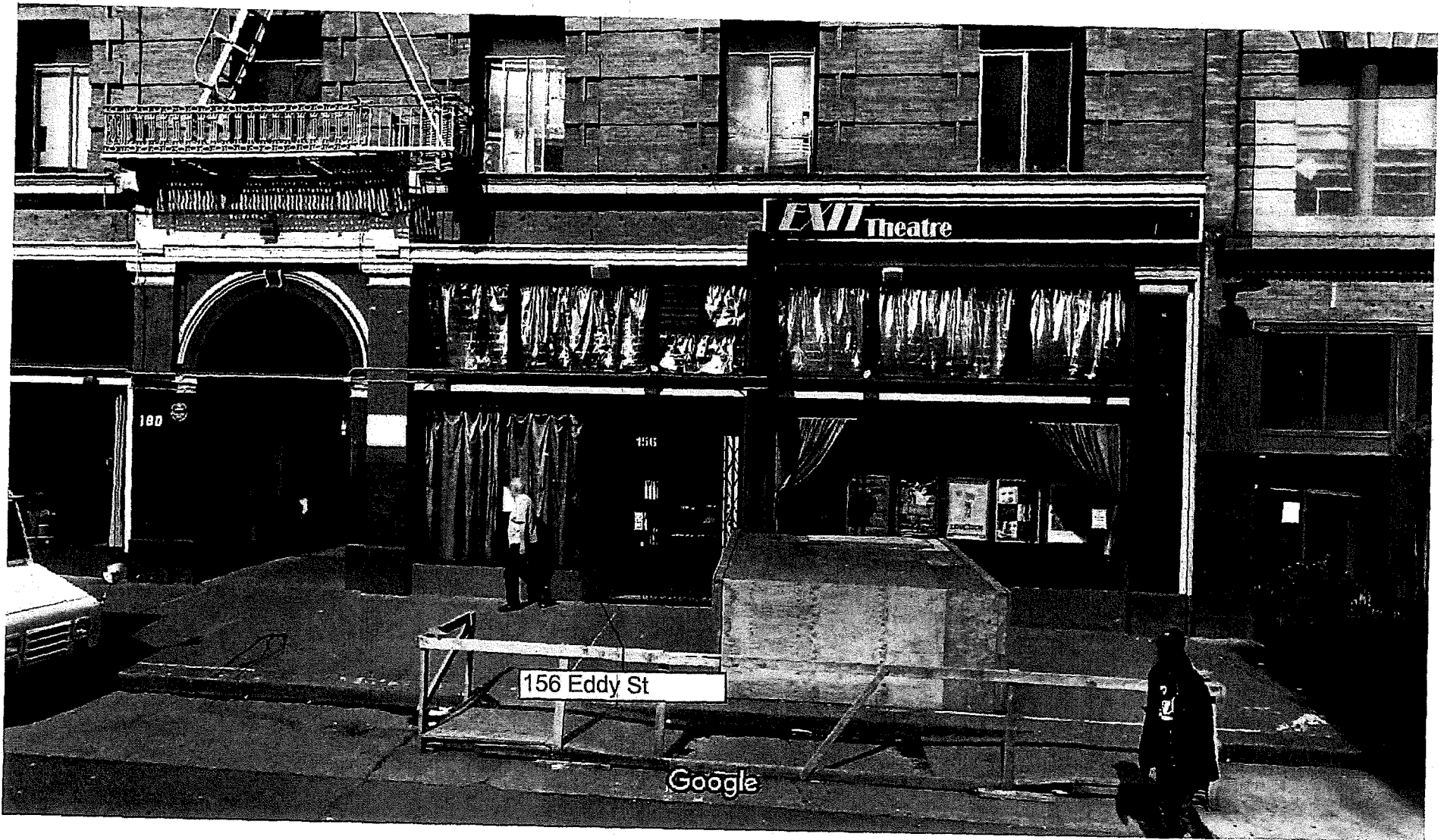
San Francisco, California Street View - Feb 2017