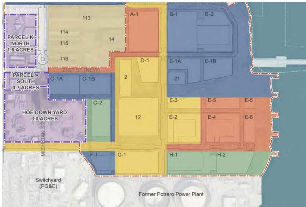
Exhibit 1: Hoedown Yard Site

The Infrastructure Financing Plan assumes that the Hoedown Yard will be developed with 367 condominium units, within 384,365 gross building square feet, which will generate property tax increment revenue under the IRFD to fund affordable housing development on the Waterfront Site and Parcel K South. Because affordable housing will not be developed on the Hoedown Yard site, the condominiums will also be assessed a 28 percent in-lieu fee payable to the Mayor’s Office and Housing and Community Development (MOHCD) for development of affordable housing outside of the Pier 70 Special Use District.