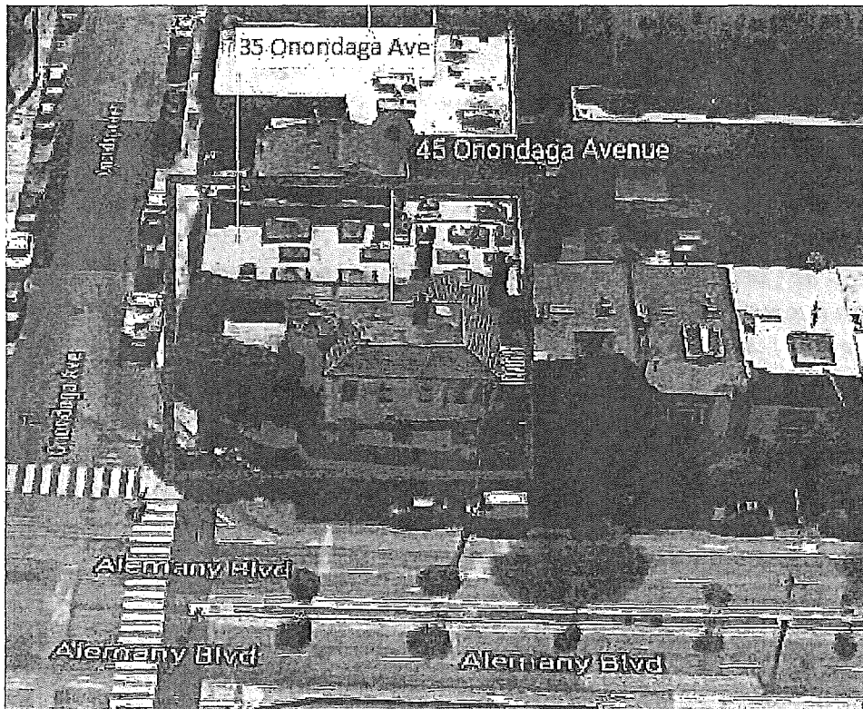
Exhibit 1: 35 Onondaga Avenue and 45 Onondaga Avenue

35 Onondaga Avenue and 45 Onondaga Avenue are City-owned properties in the City's Outer Mission – Ingleside neighborhoods. These properties were formerly used by the Department of Public Health but have been vacant since 2011. 35 Onondaga Avenue is approximately 3,960 square feet and 45 Onondaga Avenue is approximately 4,244 square feet. The properties, which are adjacent, are shown in Exhibit 1 below.