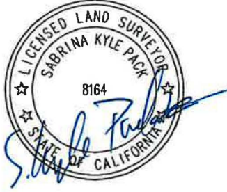
EXHIBIT A-1 ILLUSTRATIVE PLAT TO ACCOMPANY LEGAL DESCRIPTION

CANDLESTICK PARK DRIVE LOT Q, FINAL MAP NO. 12681 CITY AND COUNTY OF SAN FRANCISCO, CALIFORNIA MAY 26, 2026