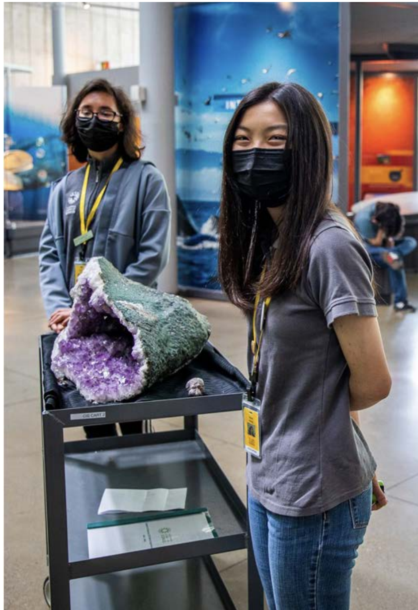
Careers in Science