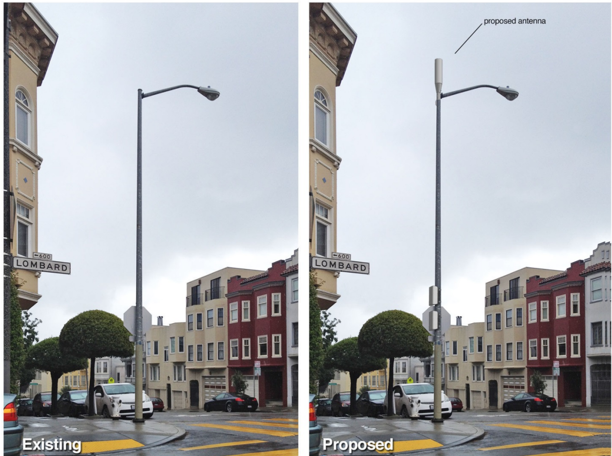
Exhibit: Installation of DAS Equipment on Street Light Pole