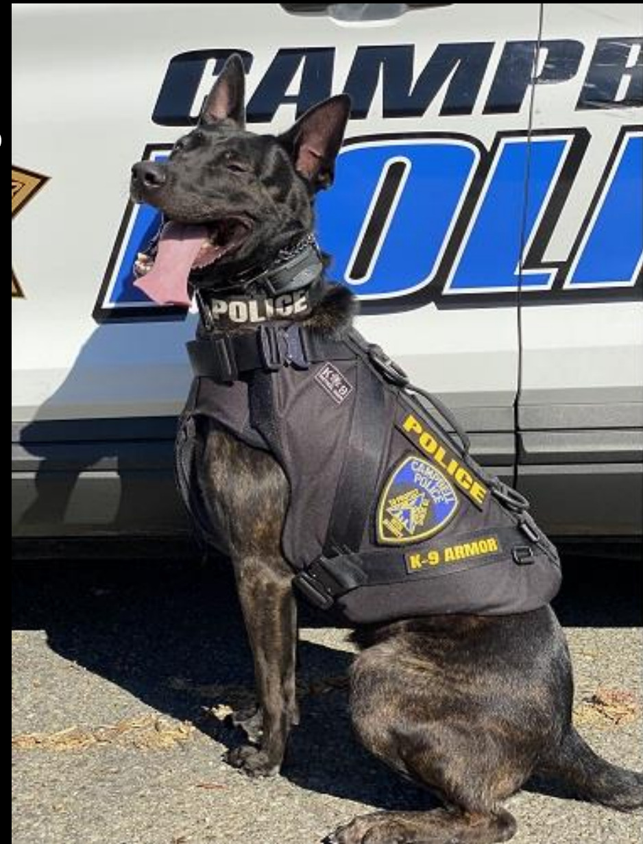
Campbell PD K9 Koa 2022