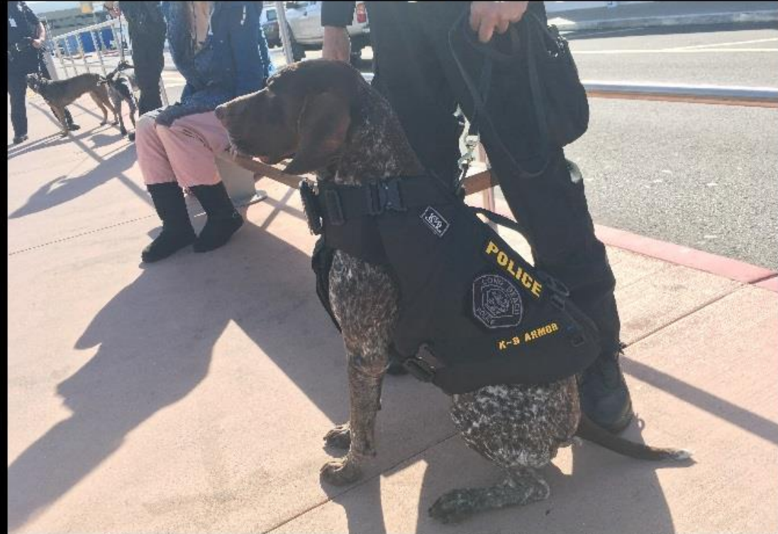
Honored to protect Long Beach PD K9 Amigo, Kala and Kiss Protectors of Long Beach Airport

Long Beach PD K9 Amigo and Kiss received their K-9 ARMOR vests January 2022 We are proud to have given a vest to Long Beach PD K9 Kala in 2020 Amigo was selected for special duty protecting Super Bowl 2022