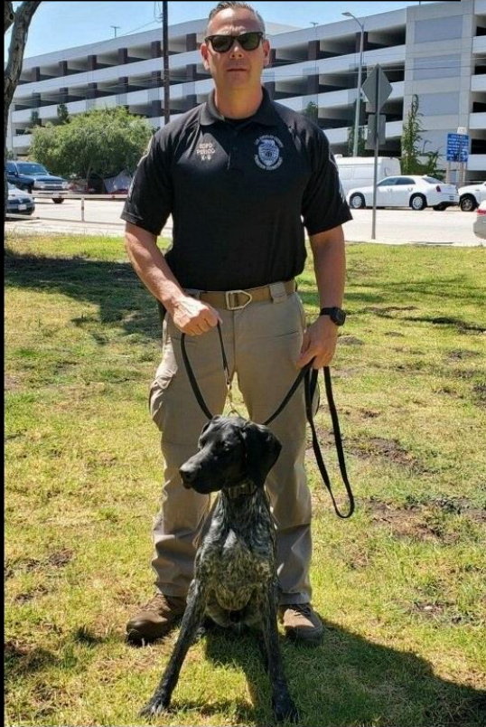
Donate to protect LAPD Paco