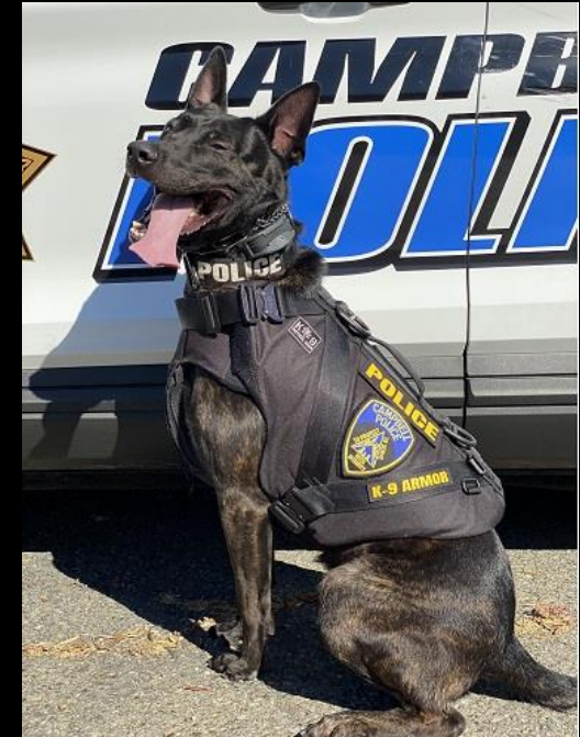
Campbell PD K9 Koa 2022

K-9 Armor has given vests to protect over 170 K9 Heroes from 2004 to 2022 thanks to donations to www.K9Armor.com