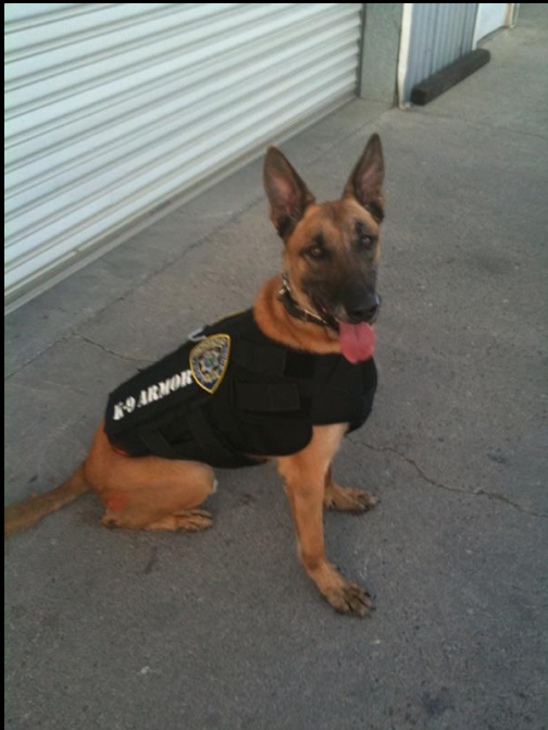
Richmond PD K9 Sabre 2009

We accept tax-deductible donations to give bulletproof spikeproof vests to California police dogs