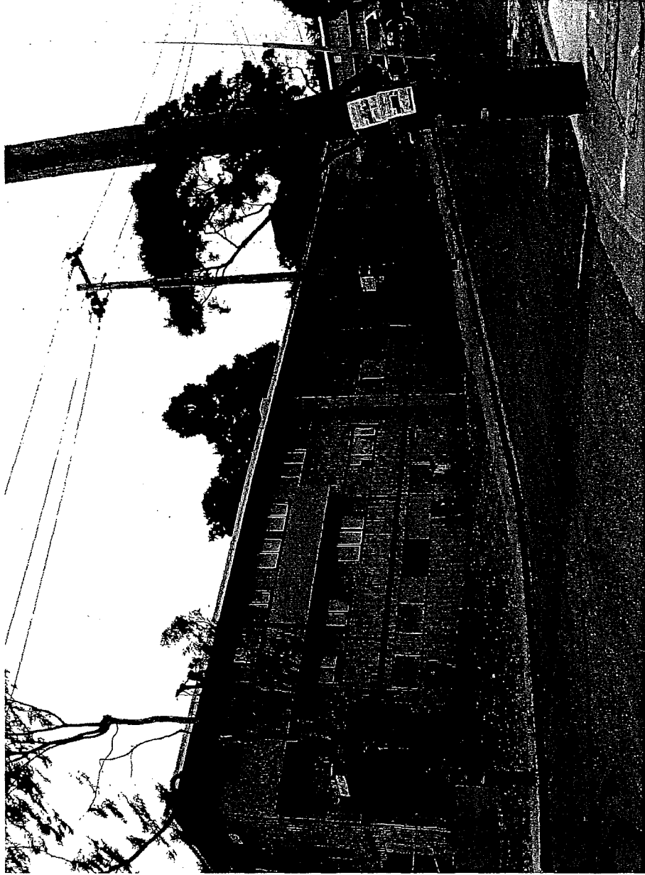
HUNTERS VIEW, PRE-RENOVATION