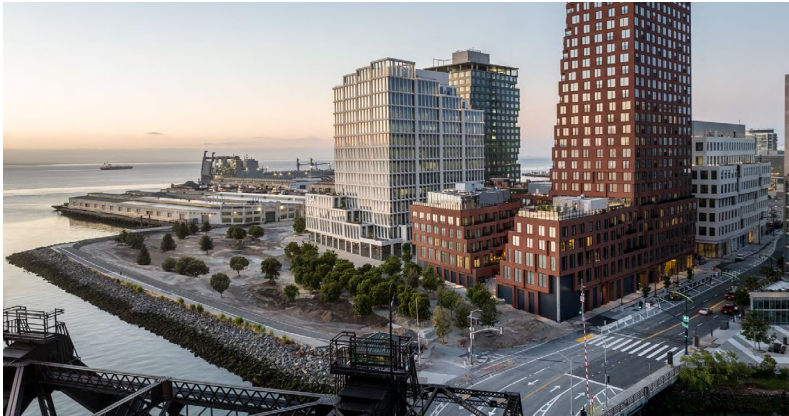
China Basin Park