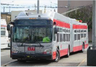
New Muni Vehicles: Motor Coaches, Trolleybuses, Light Rail

San Francisco County Transportation Authority