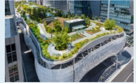
Salesforce Transit Center