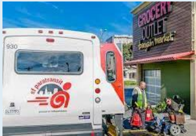
Paratransit Operations and Vehicles