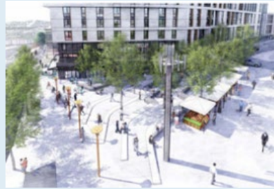
BART Station Improvements