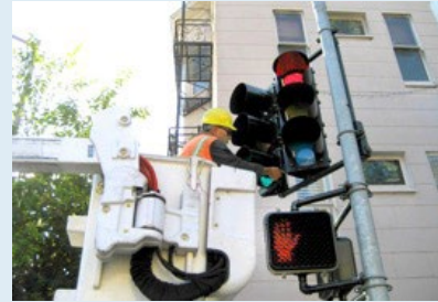
Traffic Signals and Signs