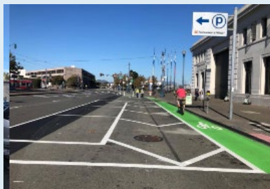
Vision Zero Quick Builds