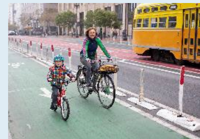
Protected Bike Lanes