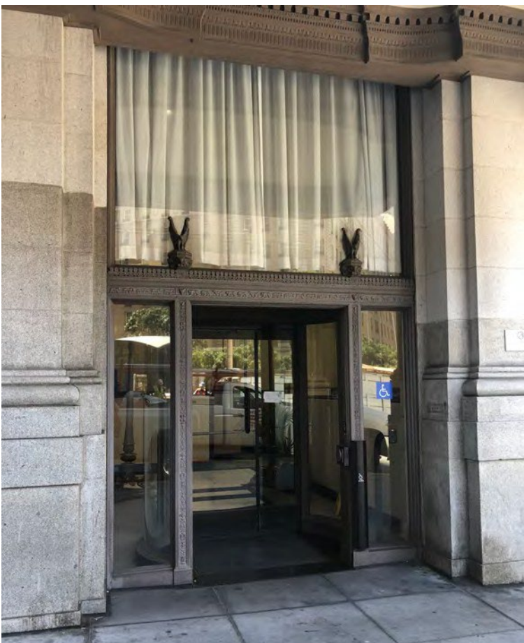
Post Street entrance, October 2019.