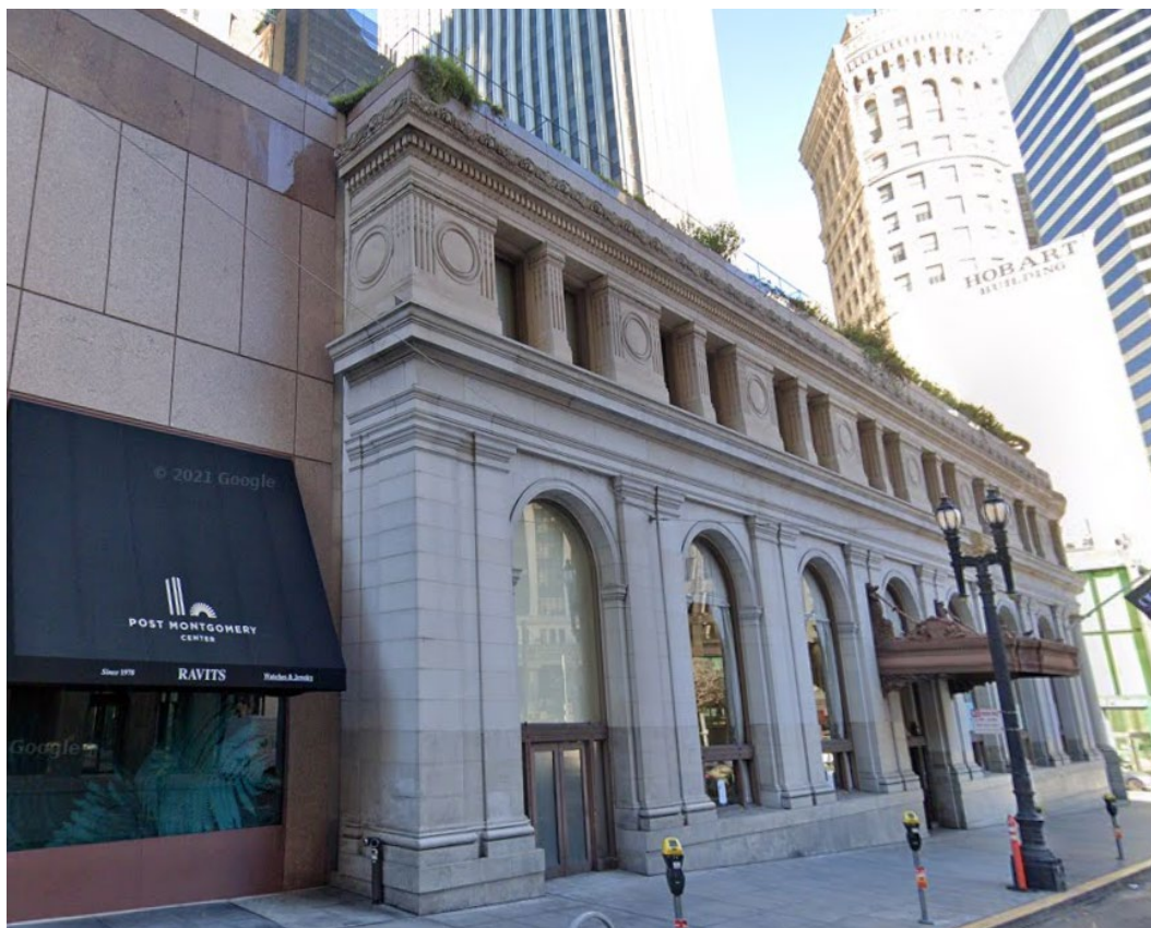
Post Street elevation where building connects to Crocker Galleria, 2020.