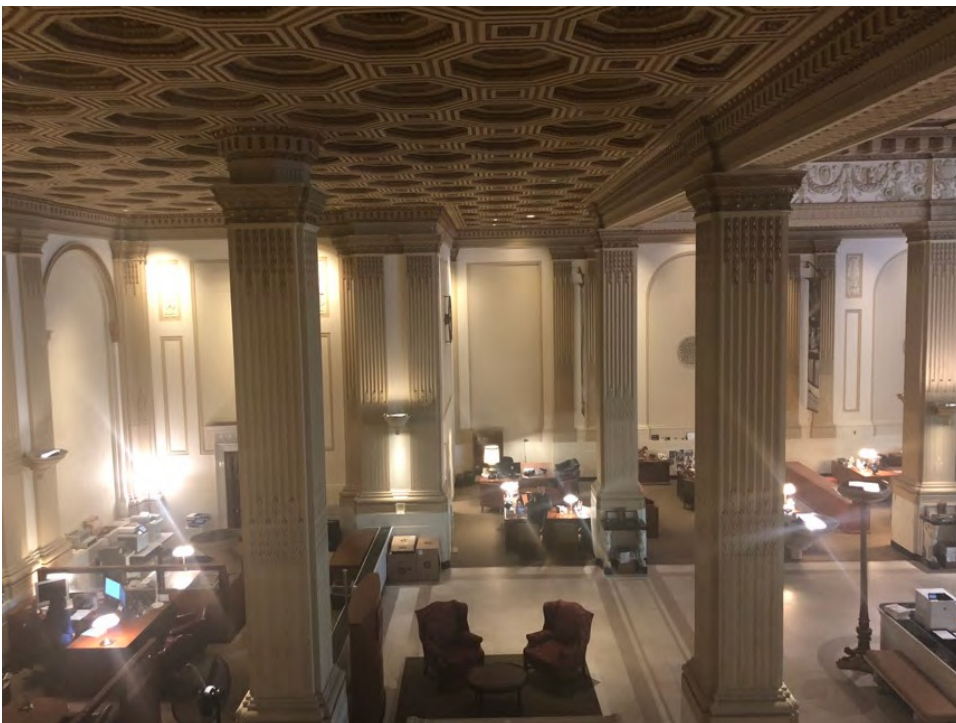
West end of 1920 banking hall, looking north, 2019.