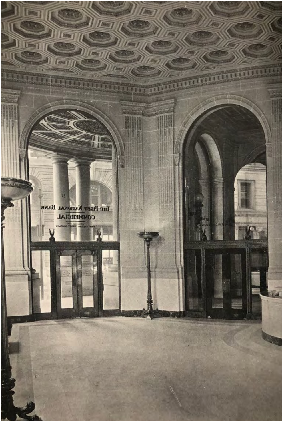
Looking south to the exterior rotunda from the lobby of the 1920 addition, from The Architect and Engineer, October 1922.