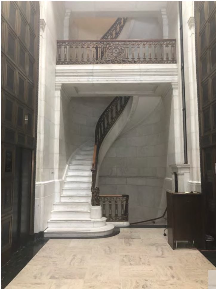
View of the curved stairway in the original 1908 lobby and detail view of the squirrel on the newel post, 2019.