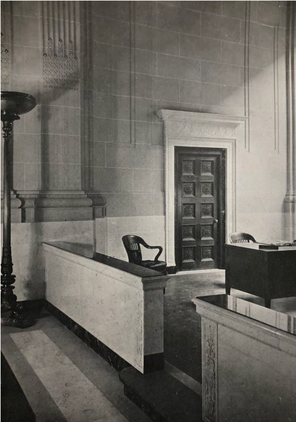
View of the office area at the west side of the 1920 banking hall, from The Architect and Engineer , October 1922.