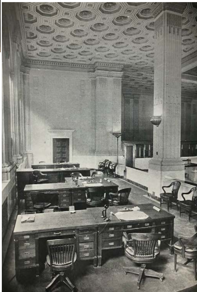
Right: View of the 1920 banking hall, looking north, from The Architect and Engineer , October 1922. Source: architecture + history, llc. (2020) report.