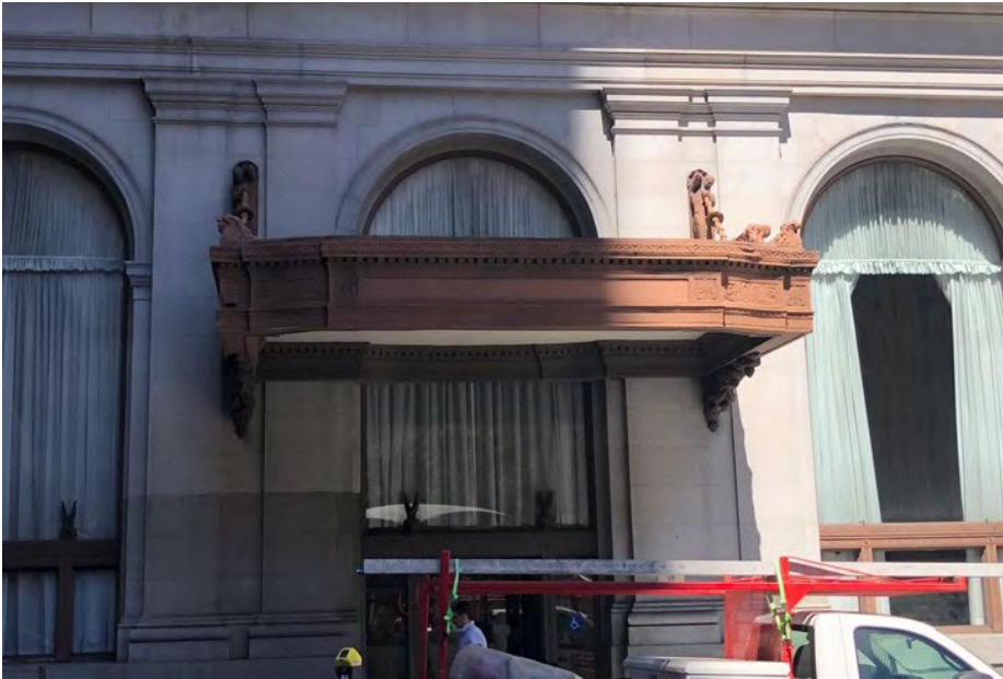
Canopy at Post Street entry, October 2019.