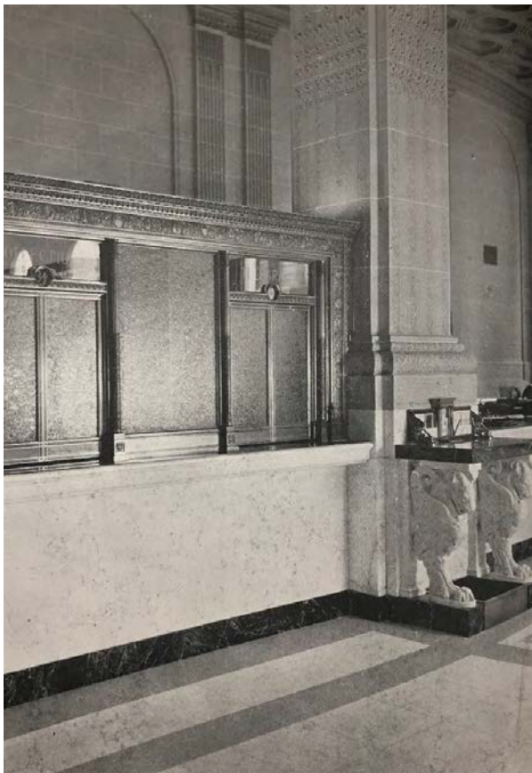
Entry information area in the 1920 banking hall, from The Architect and Engineer, October 1922.