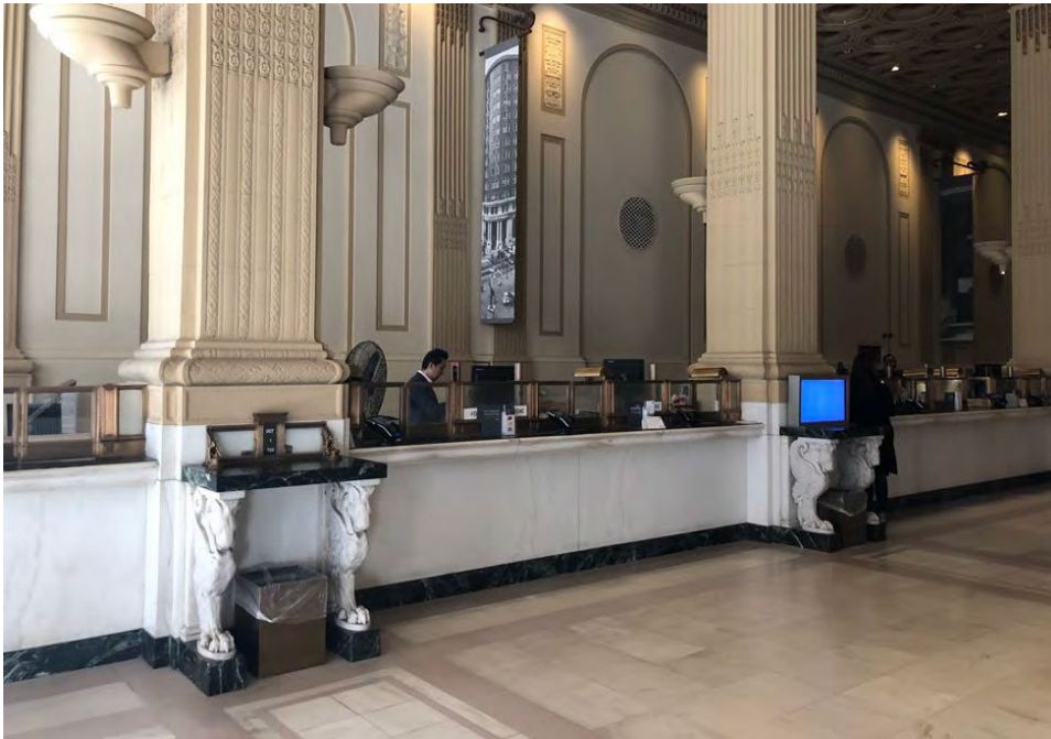
Entry information area in the 1920 banking hall, October 2019.