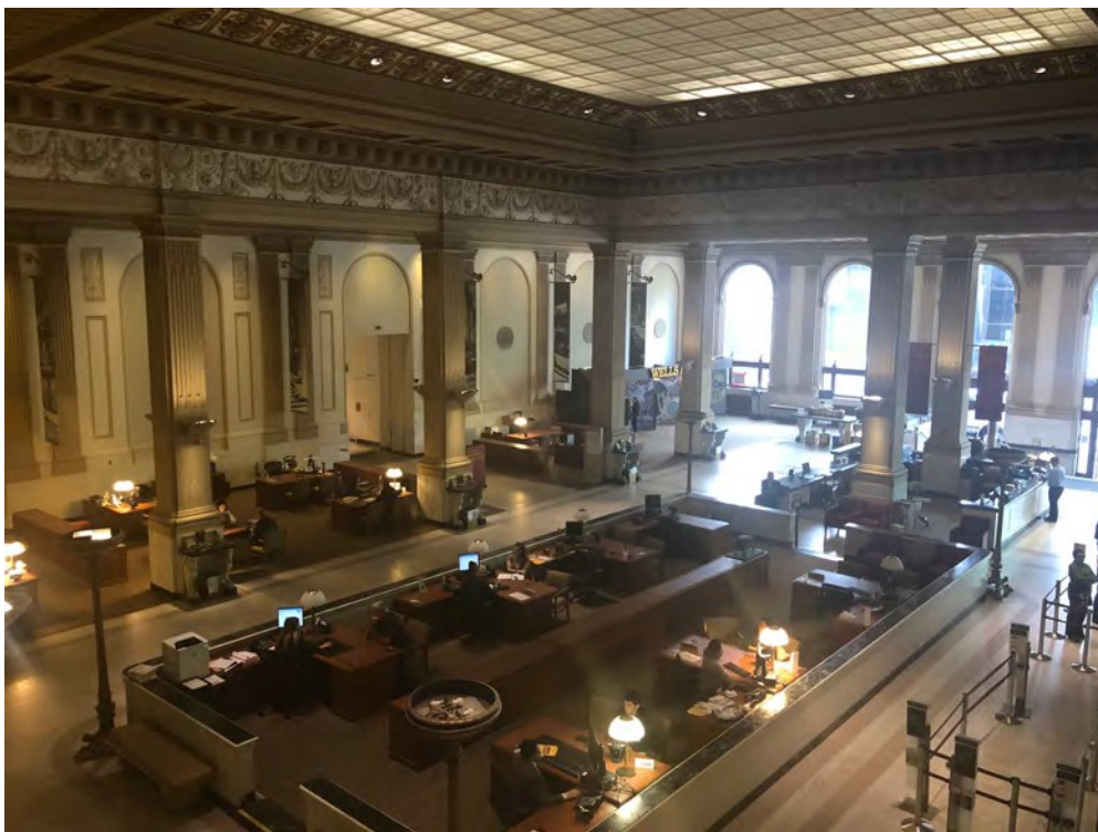
Interior of 1920 banking hall, looking northeast, 2019.