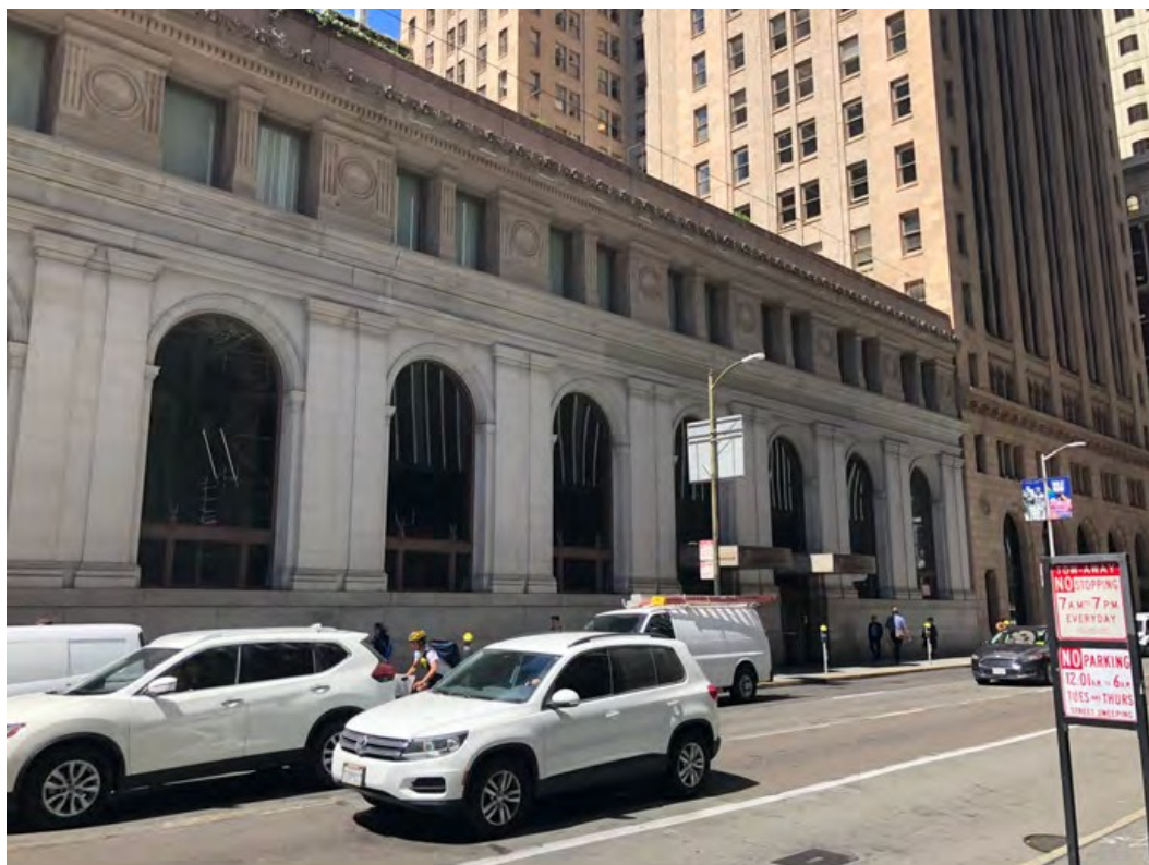
Montgomery Street elevation, view northwest, October 2019.