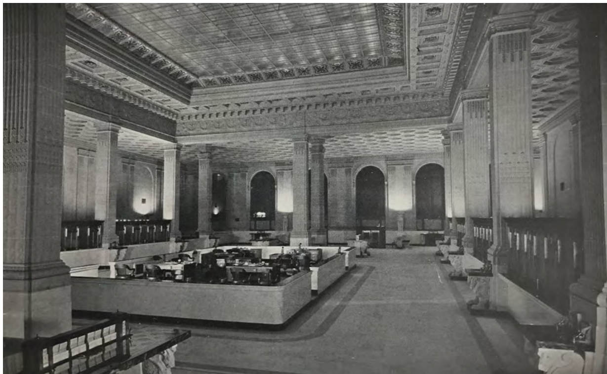
View of the 1920 banking hall, looking east, from The Architect and Engineer , October 1922.