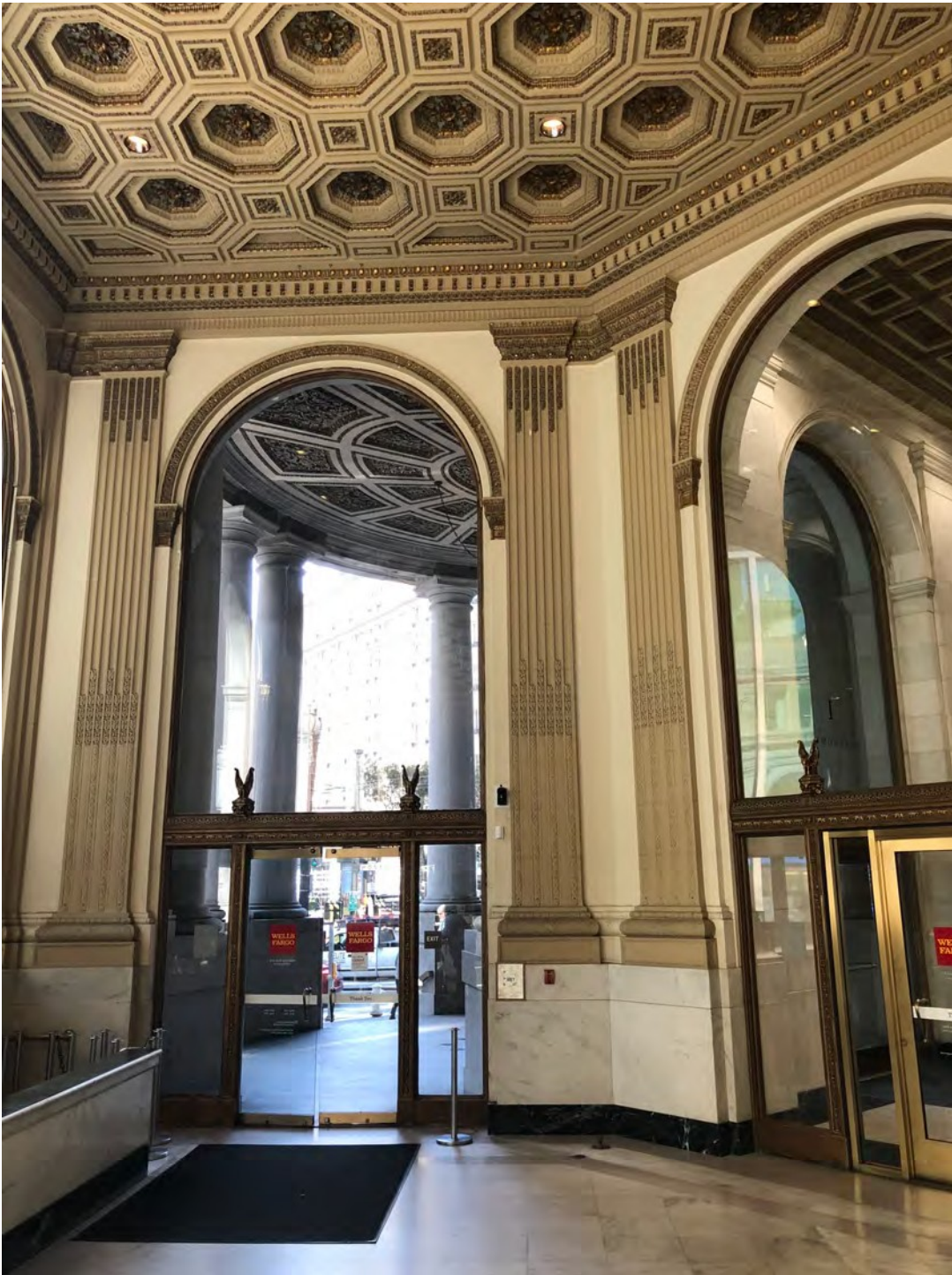
Interior of lobby in 1920 banking hall with exterior rotunda in background, view south, 2019.