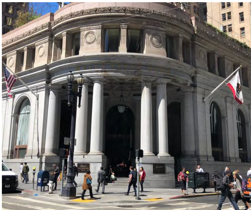
Detail of the rotunda entry, October 2019.