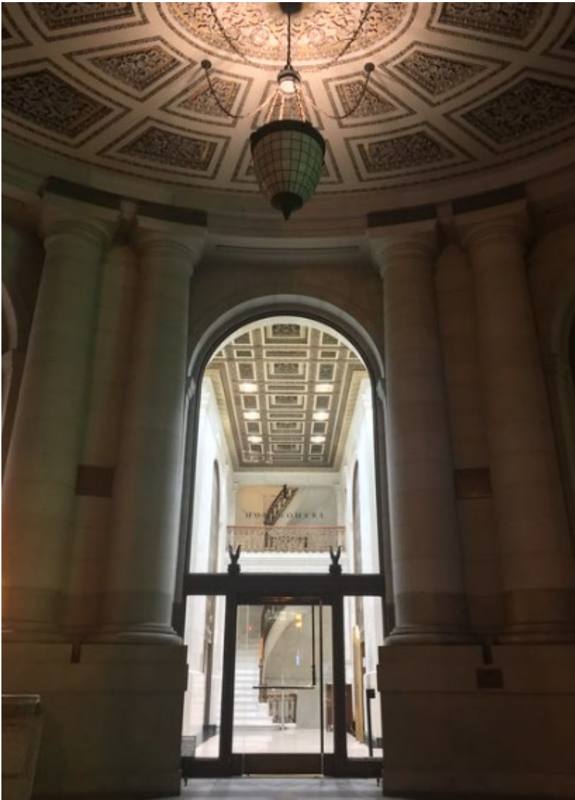
View of 1908 lobby from rotunda entrance, 2018.