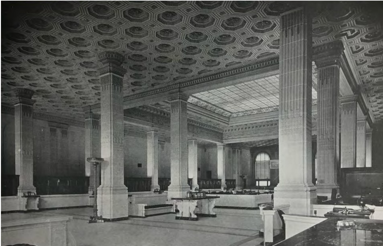
View of the 1920 banking hall, looking southwest, from The Architect and Engineer , October 1922. Source: architecture + history, llc. (2020) report