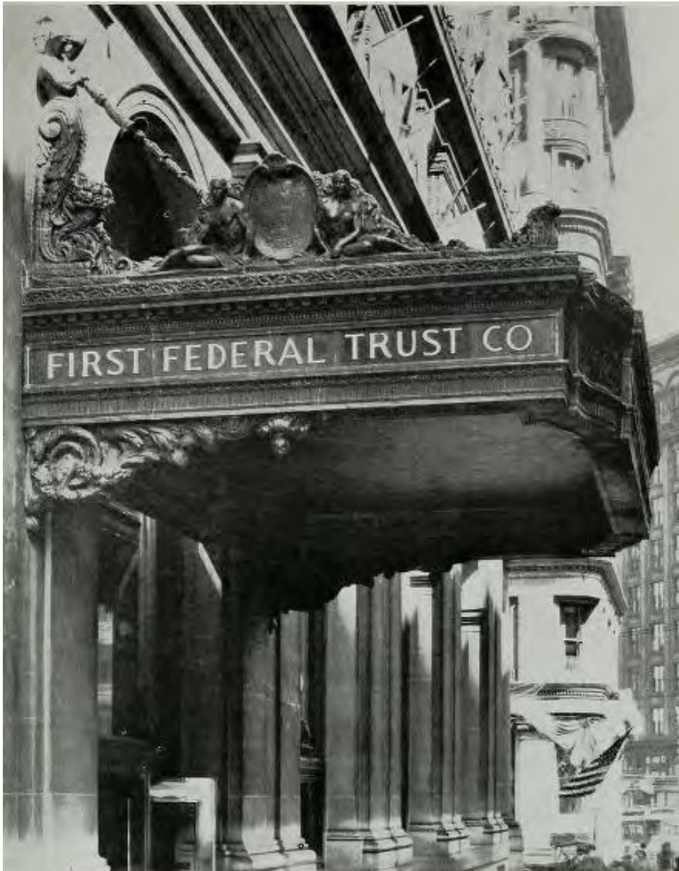
View of the canopy from the October 1925 Architect & Engineer .