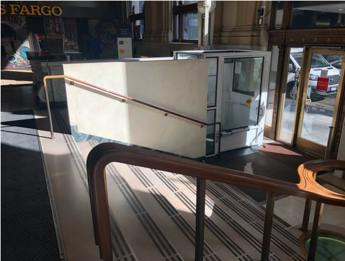
View of the Montgomery Street entry with the inserted lift and detail of railing, October 2019.