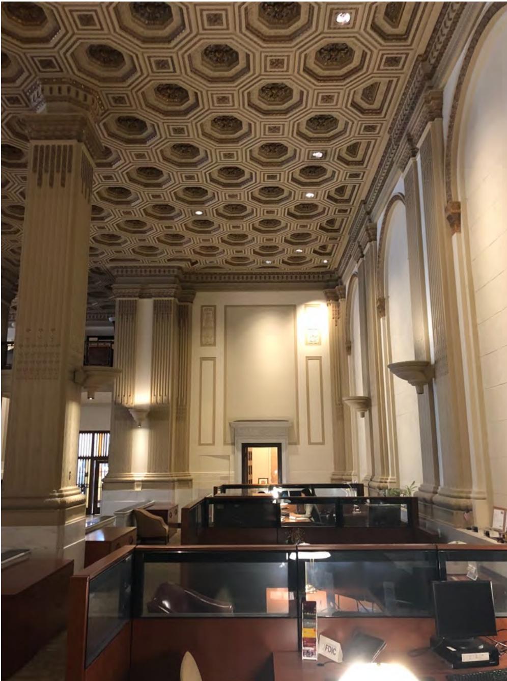
View of the office area at west end of 1920 banking hall, looking south, October 2019.