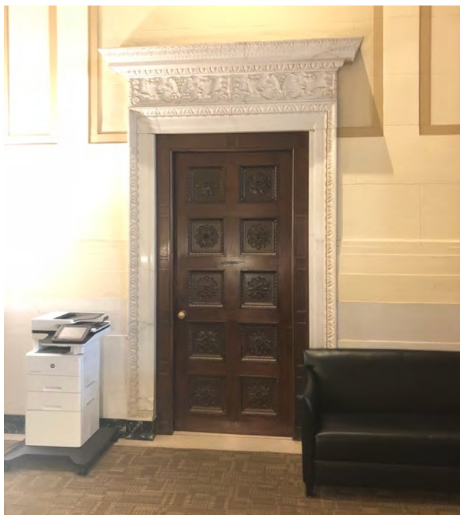
Above: Door and surround in 1920 banking hall, 2019.