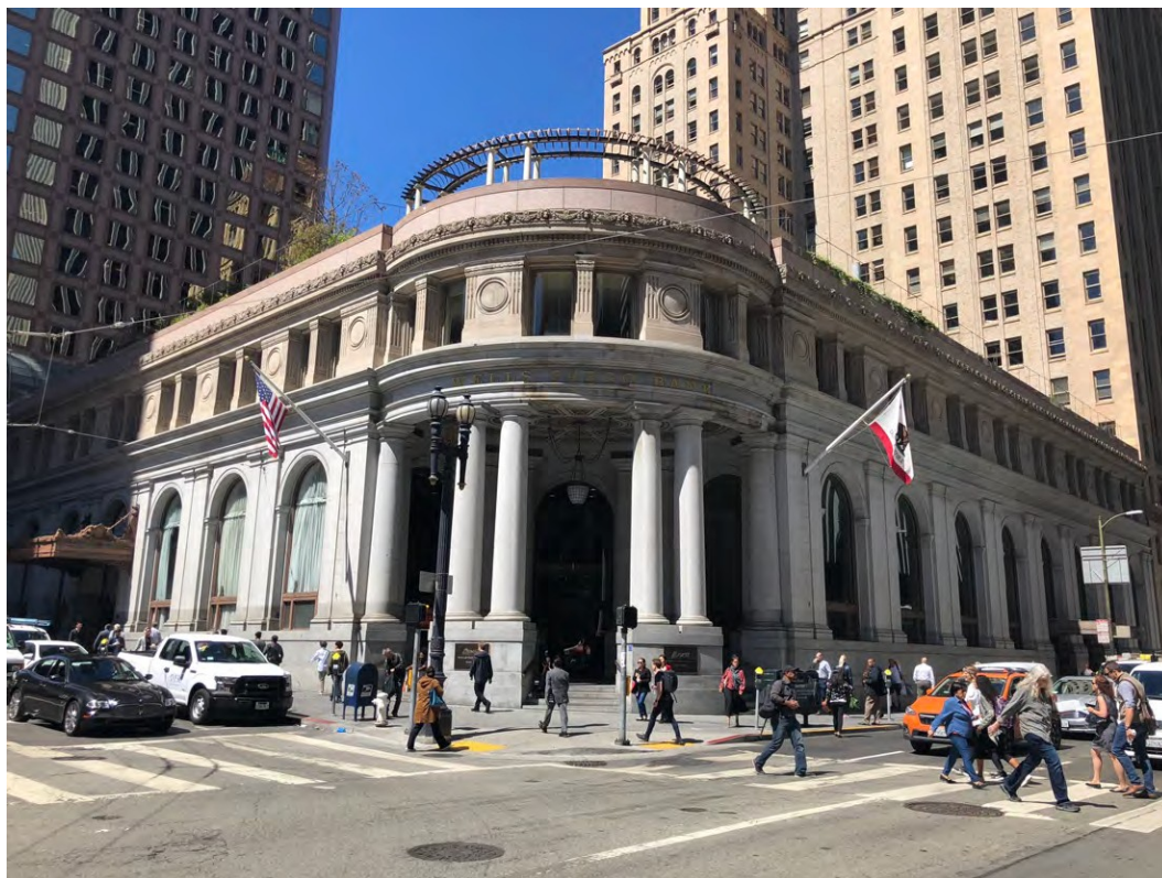
One Montgomery Street, October 2019.