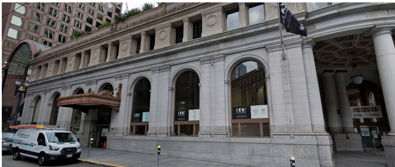
Post Street elevation, 2021.