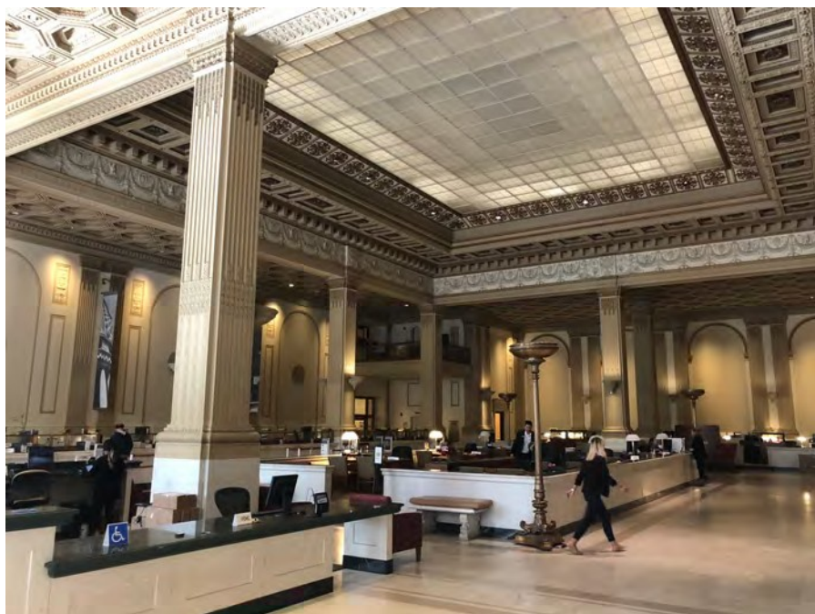
Interior of 1920 banking hall, view southwest, 2019.