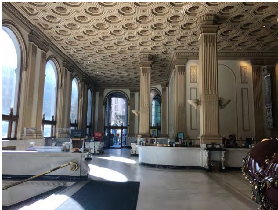
Interior of 1920 banking hall with stair to Montgomery Street entrance, looking south, 2019.