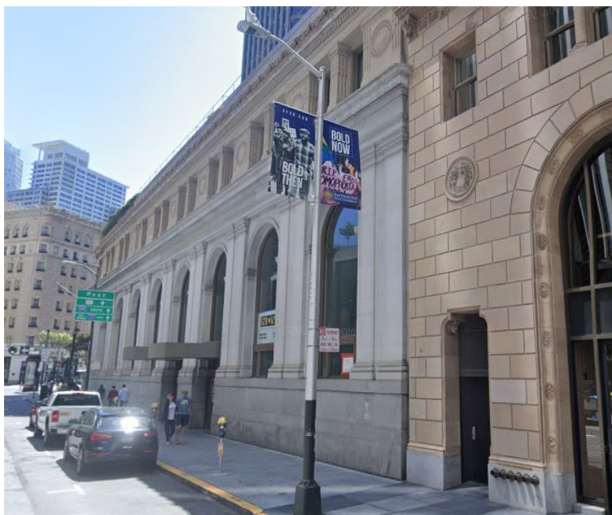
Montgomery Street elevation, view southwest, 2020.