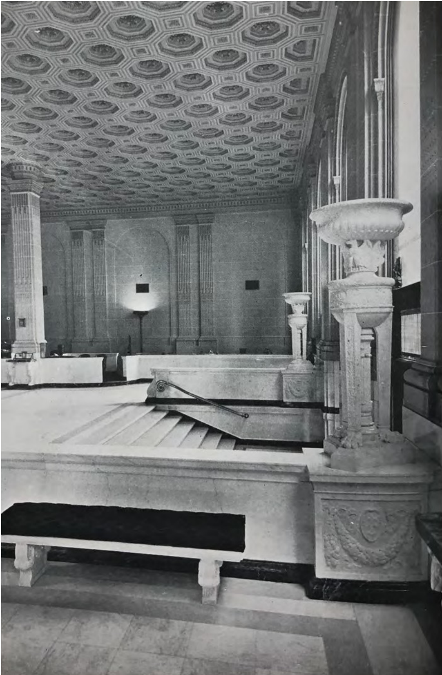
View of the entry from Montgomery Street into the 1920 banking hall, from The Architect and Engineer , October 1922.