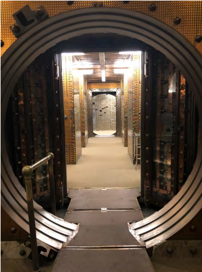
Detail view of the main vault and grille work on cage at vault in basement, 2019.