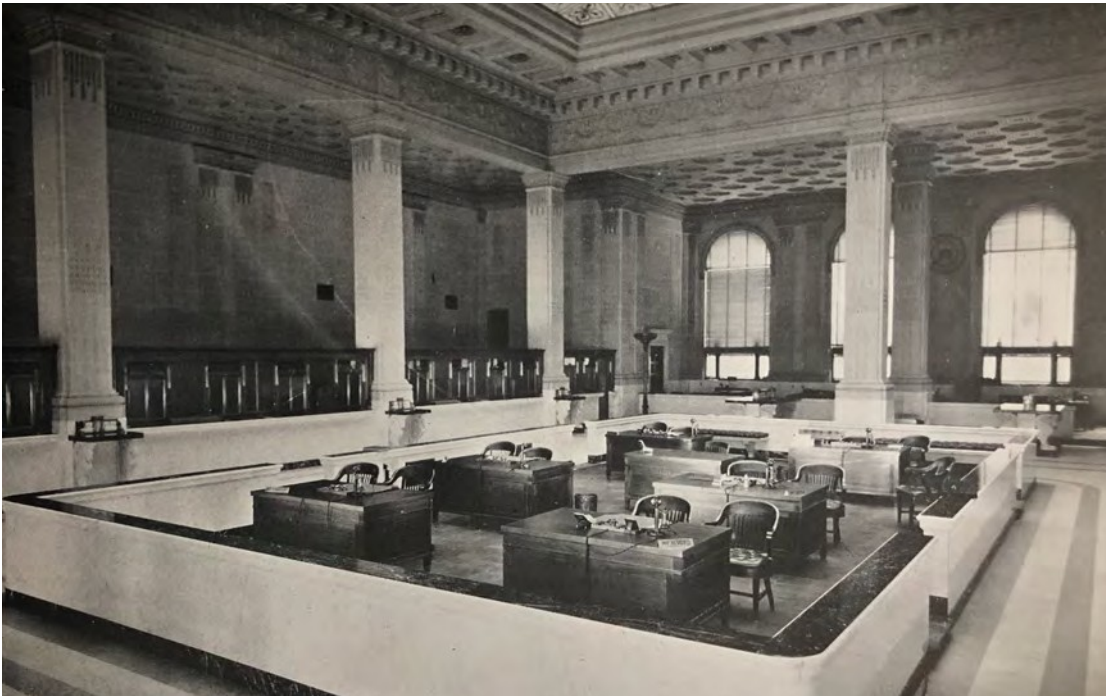
View of 1920 banking hall addition, looking southwest, from The Architect and Engineer , October 1922.