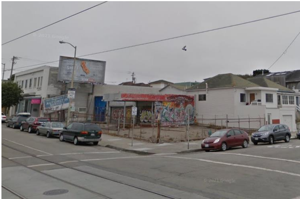
Before photo, taken August 2016

Previous use: former gas station vacant since 2011 Proposed project: 20 unit mixed-use building