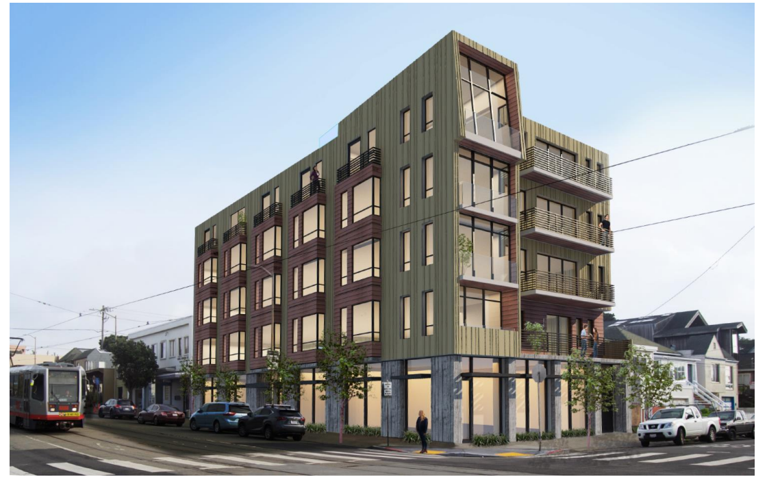
Proposed project, entitled November 2019