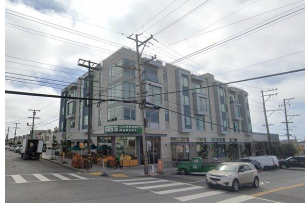
New construction, taken March 2022