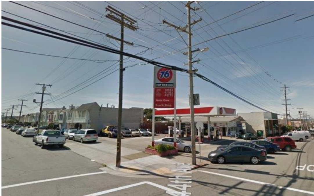
Before photo, taken March 2014

Existing use: 12-unit mixed-use building with Gus's Community Market on the ground floor