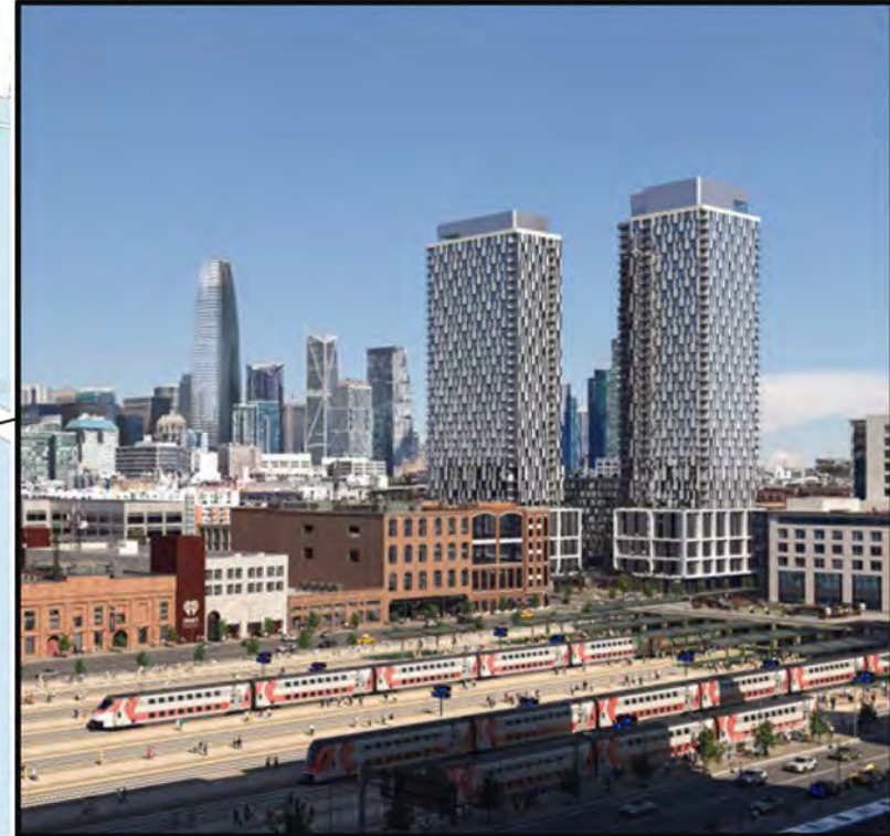
Solomon Cordwell Buenz