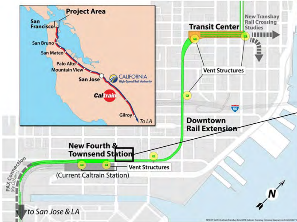
Transbay Joint Powers Authority