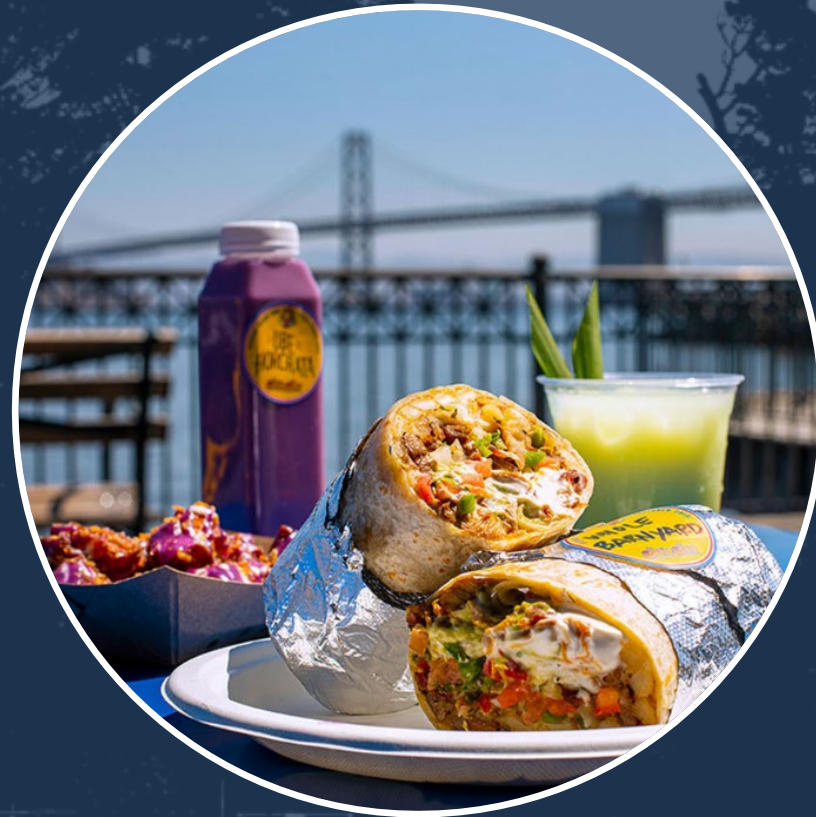
RESTAURANTS, BARS & VENDORS