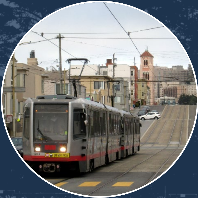
FREE MUNI FOR CONCERT GOERS