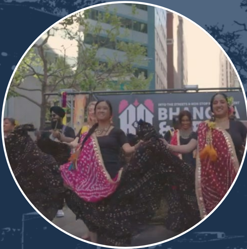
FREE DOWNTOWN CONCERTS