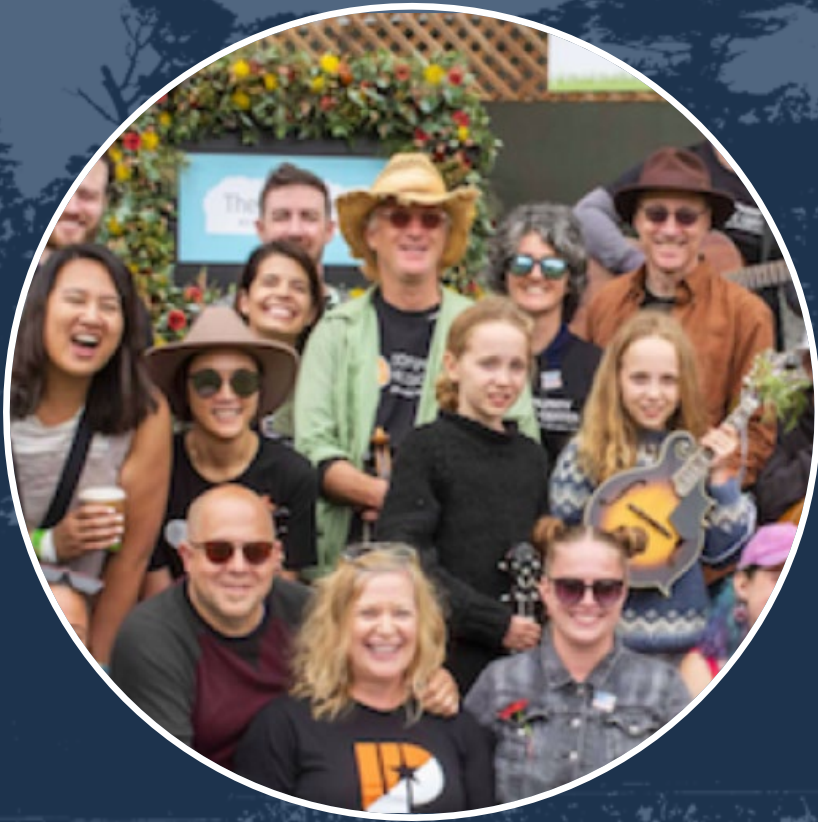
COMMUNITY BENEFIT FUND