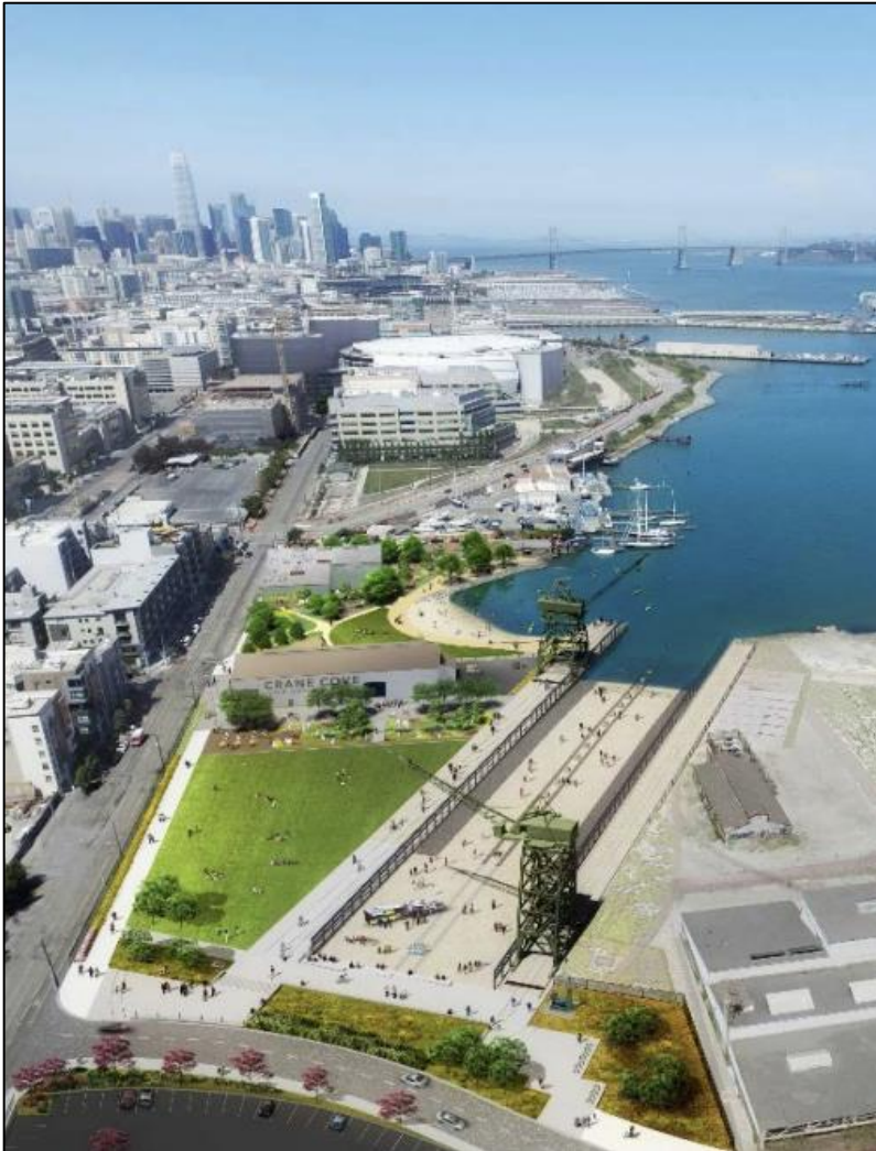
Exhibit 2: Crane Cove Park Architectural Rendering