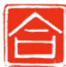
Chinatown Community Development Center 華協中心