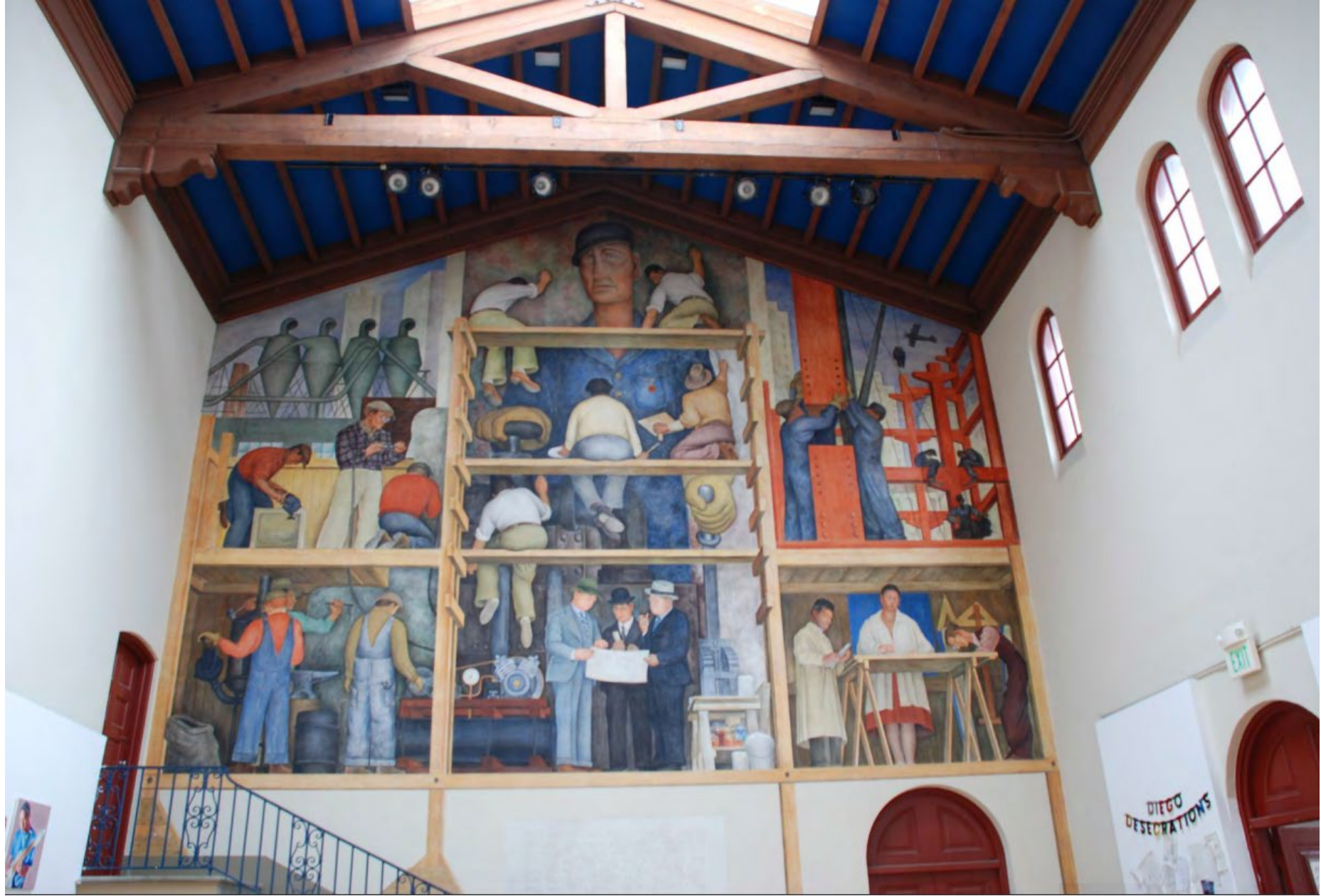
The Making of a Fresco Showing the Building of a City , 2015