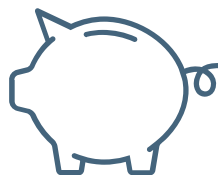
Smart Money Coaching