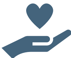
Behavioral Health Care