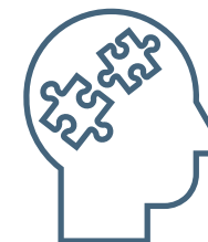
Life Skills Training