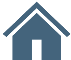
Housing Location Services

The key to successfully housing youth in Rapid Rehousing is wraparound support from expert providers: