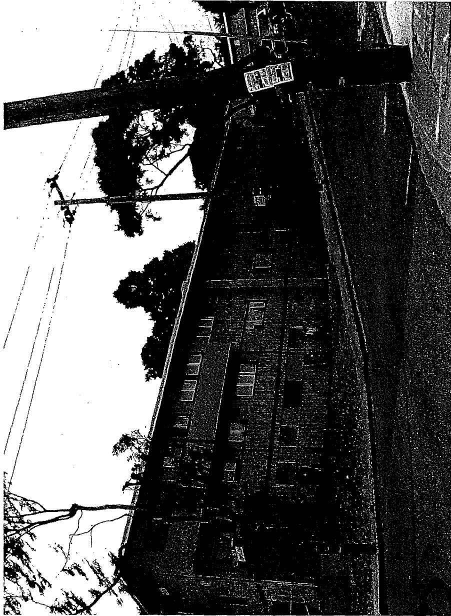
HUNTERS VIEW, PRE-RENOVATION

MAYOR'S OFFICE OF HOUSING AND COMMUNITY DEVELOPMENT