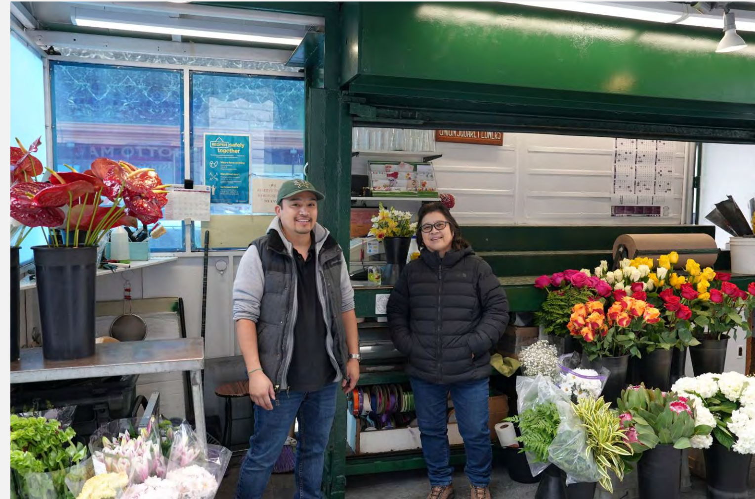
Stockton St. and O'Farrell St.