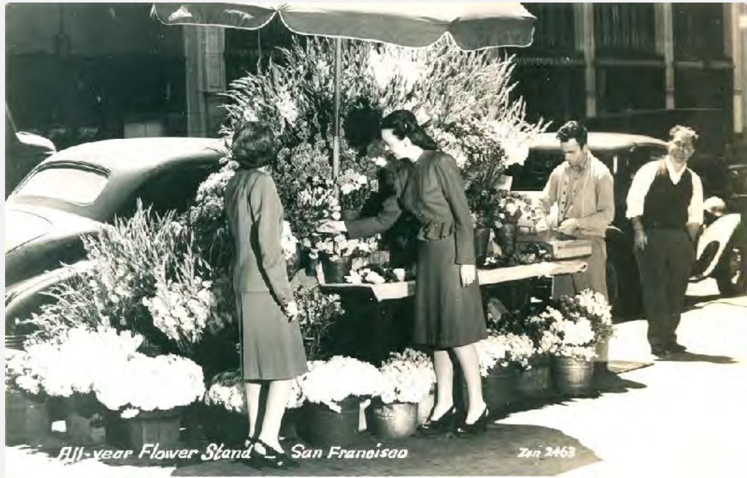
Flower Stand at Grant near Geary circa 1940