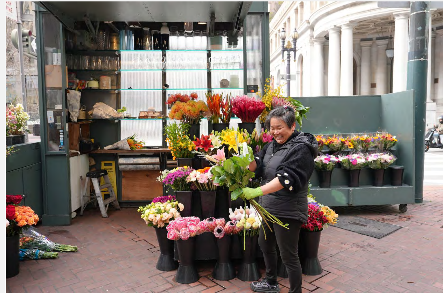
Montgomery St. and Post St.