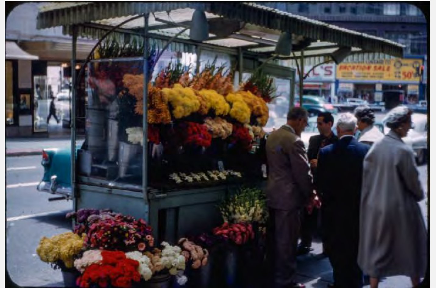
Flower Stand at Stockton near Ellis 1959