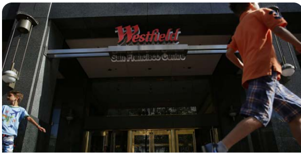
San Francisco's most prominent shopping mall goes bust businessinsider.com